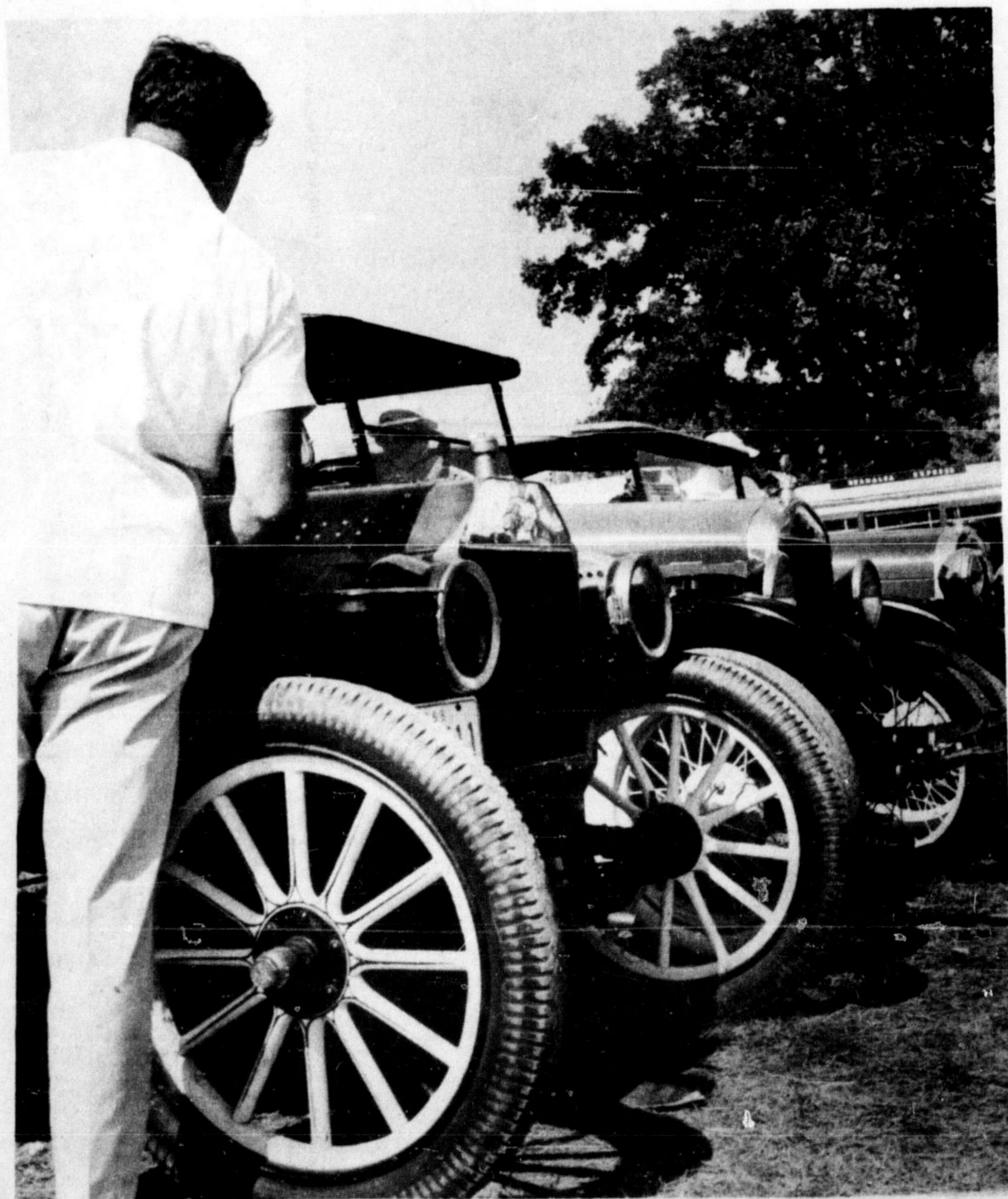
PUTT-PUTT POWER at the Steam-Era was supplied by these early Ford cars, just three of a total of 25 antique cars that were displayed. A visitor looks over the gleaming rads of these three, which were the latest things in transportation back in 1913, 1927 and 1929.