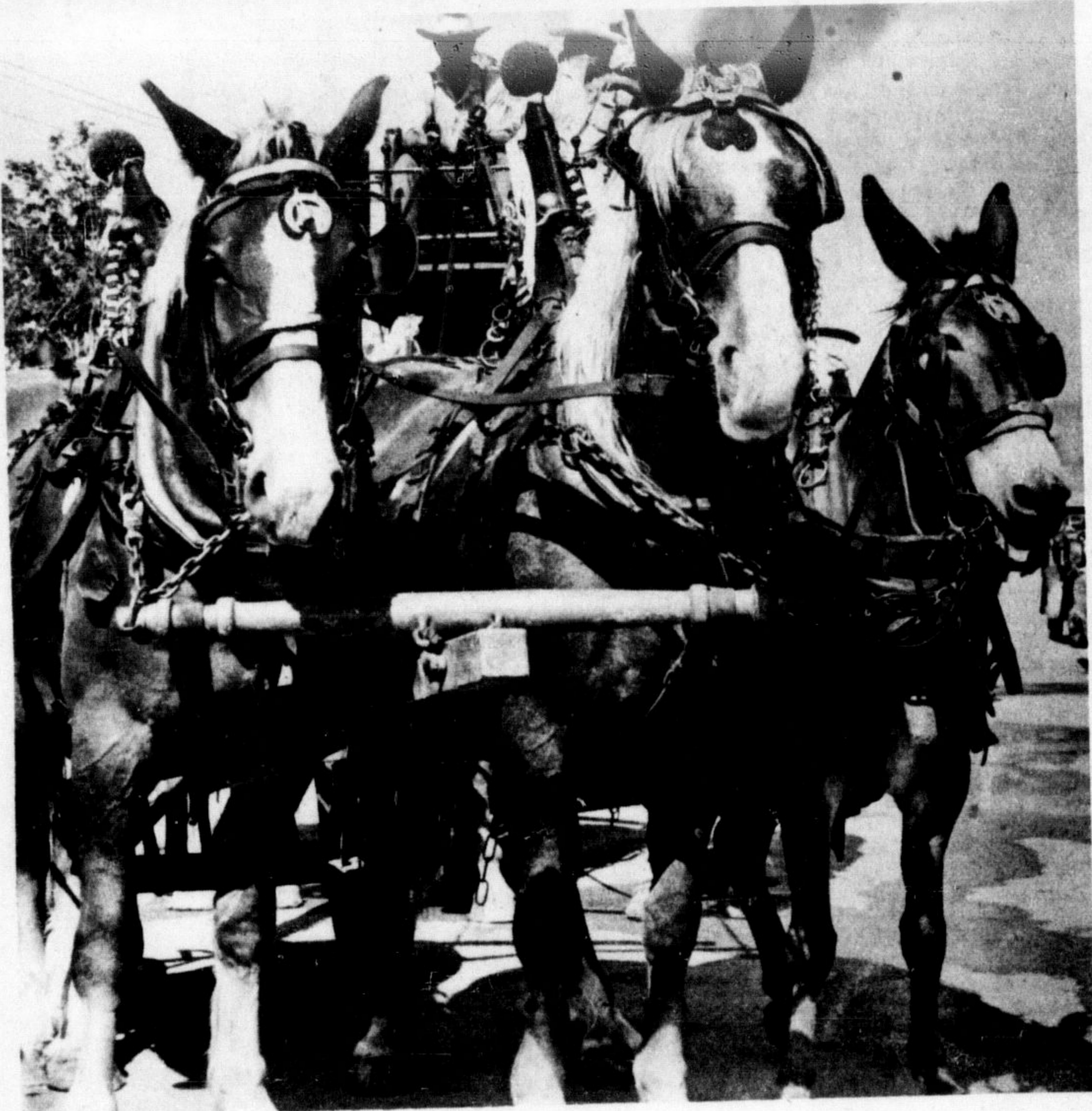
THREE TYPES OF POWER were on display at the Steam-Era reunion in Milton fair grounds over labor day weekend. Horse power was ably demonstrated by the six-horse (or was it five horses and one mule) team that pulled the heavy steam calliope around the grounds. The calliope came from the Minnie Thomson museum at Stratford.