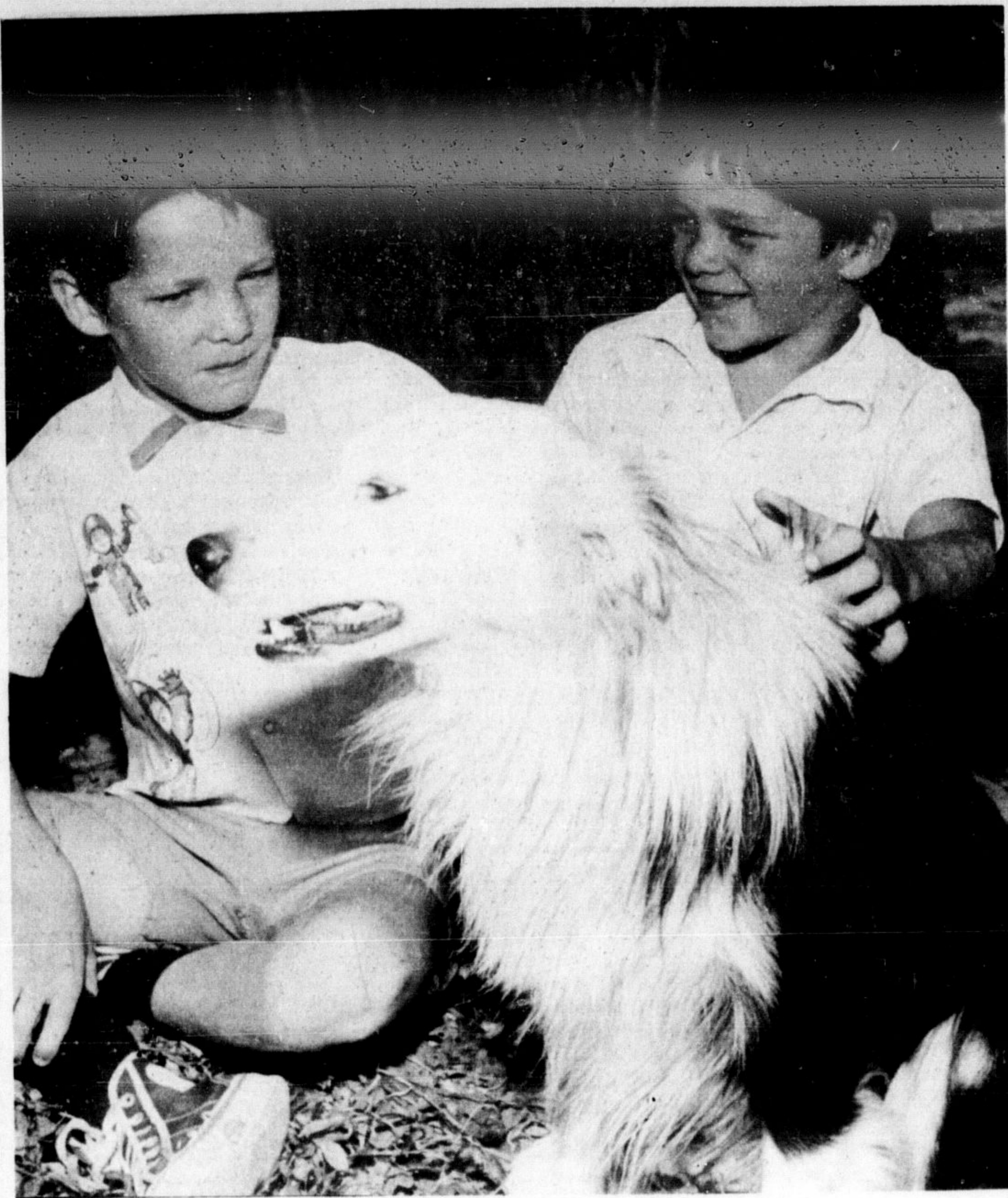
ENJOYING THE SHADE. 'Blackie' demonstrates Tarrant. Let's face it — it's been "dog-gone" hot in the sun. (Staff Photo)