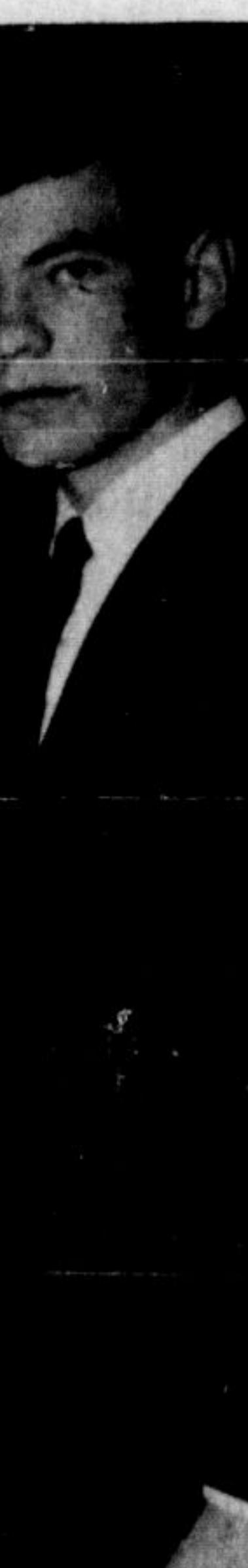
Most Popular fans voted the pres-

at t house League to a dinner behalf Lodge Following the games were in the young-