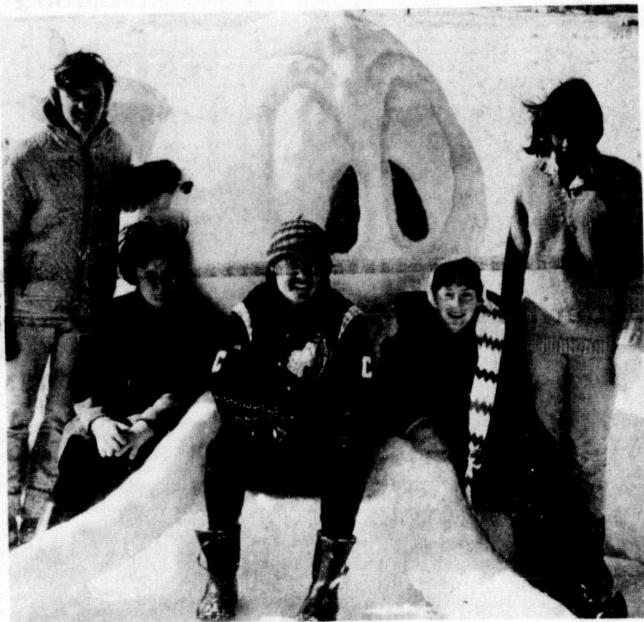
OSCAR THE OCTOPUS may even be back this weekend, as Milton District High students (and maybe some staff, too) join in the fun of the second annual winter snow carnival. Snoopy, Charlie Brown's mad dog, will be the star of the show. The fun lasts all day Saturday and is open to everyone. If the snow lasts, sculptures like this one from last year's show will be on display.