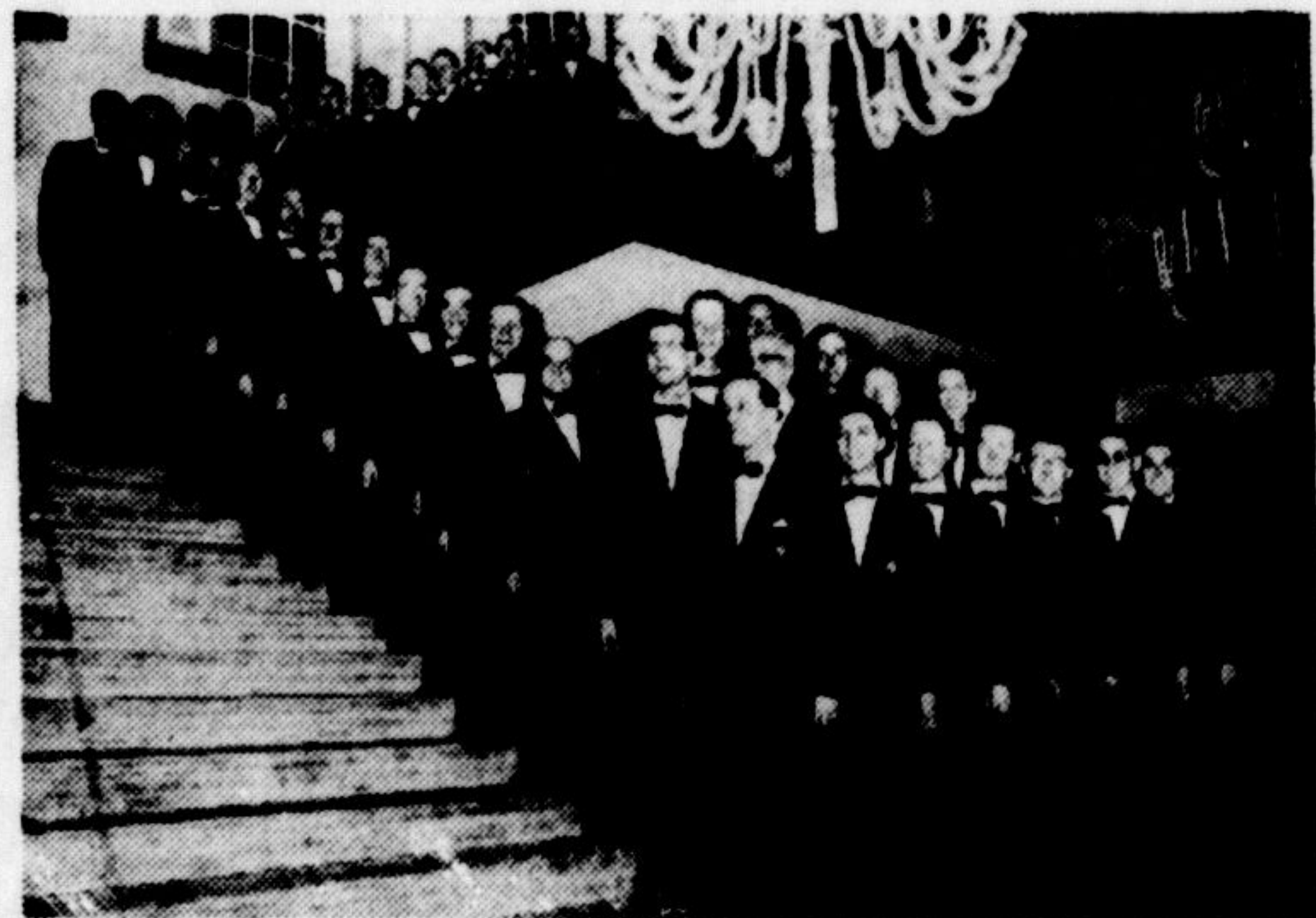
THE SCHNEIDER MALE CHORUS OF KITCHENER Will Present a Concert at: Martin Street Senior School Auditorium FRIDAY, SEPTEMBER 22 — Time: 8.30 p.m. Admission - $1.00 Tickets Available - Choir Members Sponsored by: Choir of Grace Anglican Church

For All of Your TV Needs Make CHASE'S YOUR T.V. Headquarters