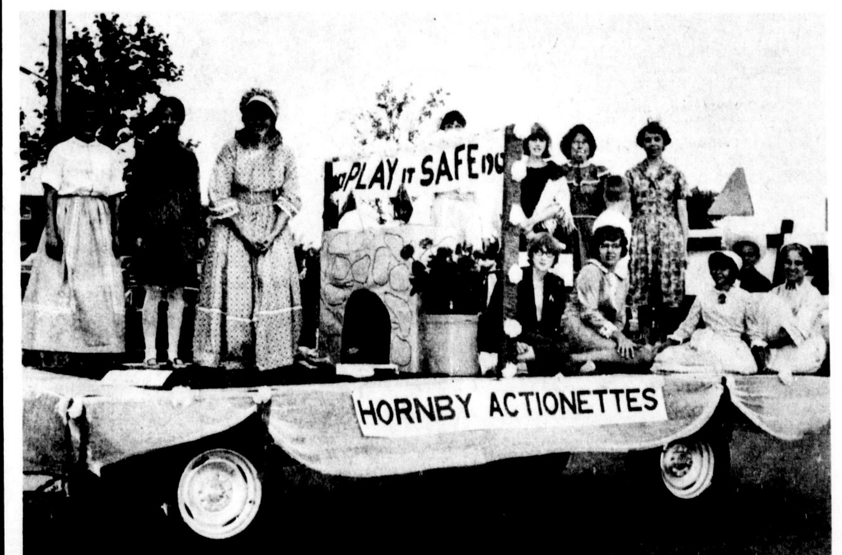
THE HORNBY ACTIONETTES , one of Halton's busy 4-H Homemaking Clubs, had a float decorated with costumed girls and safety themes in Saturday's parade. Their costumes and "look depicted the "good old days"