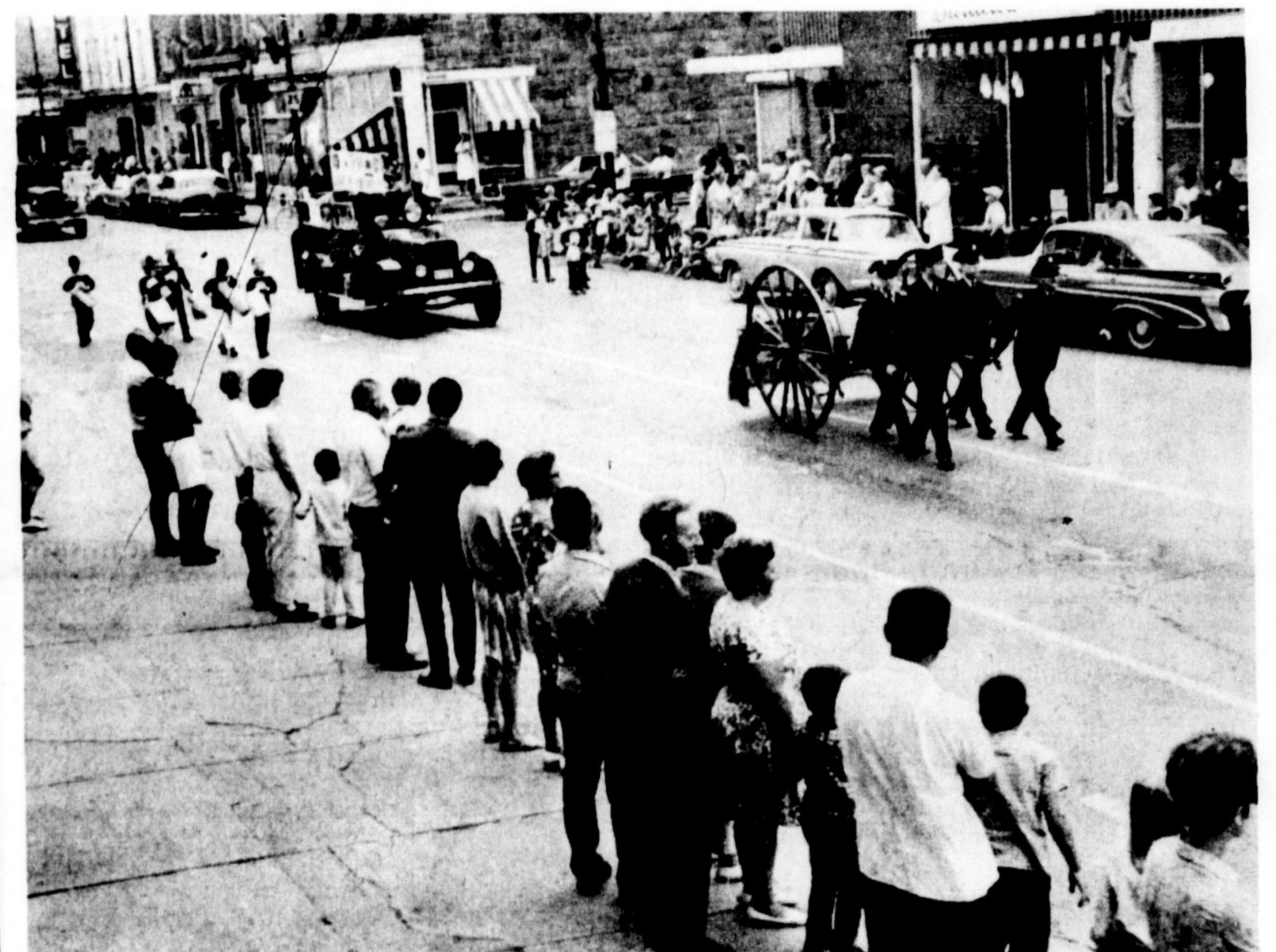
A CROWD OF THOUSANDS lined Milton's streets for the Saturday parade. Here's part of the downtown crowd watching antique fire-fighting equipment rolling by on the street. The equipment ranged from a hose reel from the 1800's to the modern fire pumps.