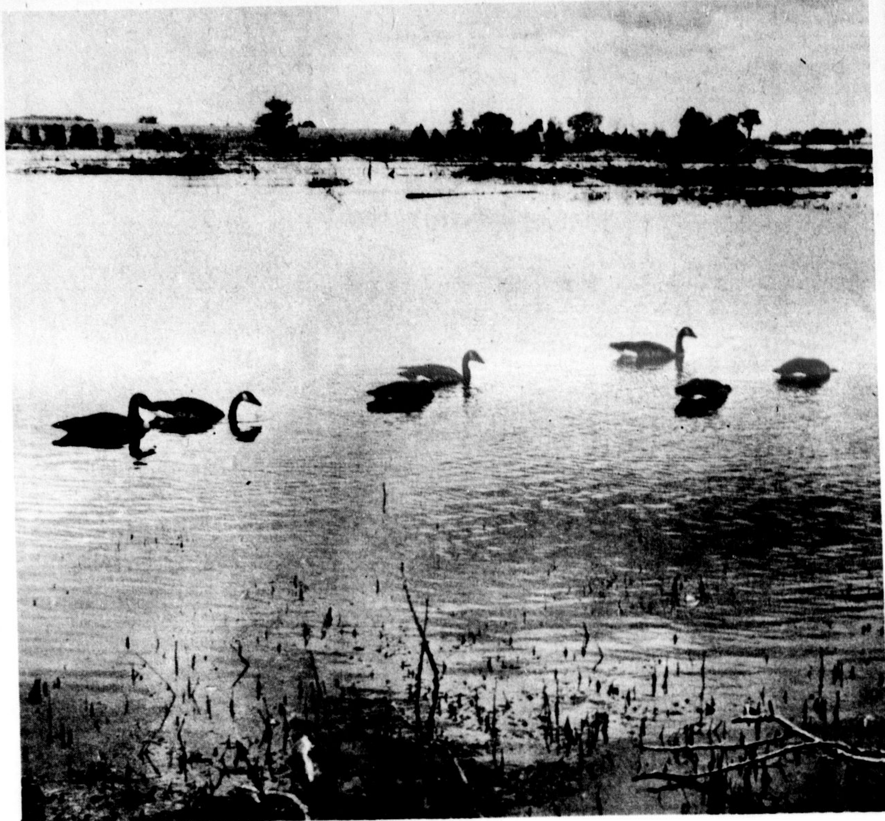
DUCKS ARE AMONG THE FIRST creatures on the farm. Mr. Timmermans, the proprietor, hopes to set up controlled duck hunting in the fall with the assistance of the Ontario Department of Lands and Forests.