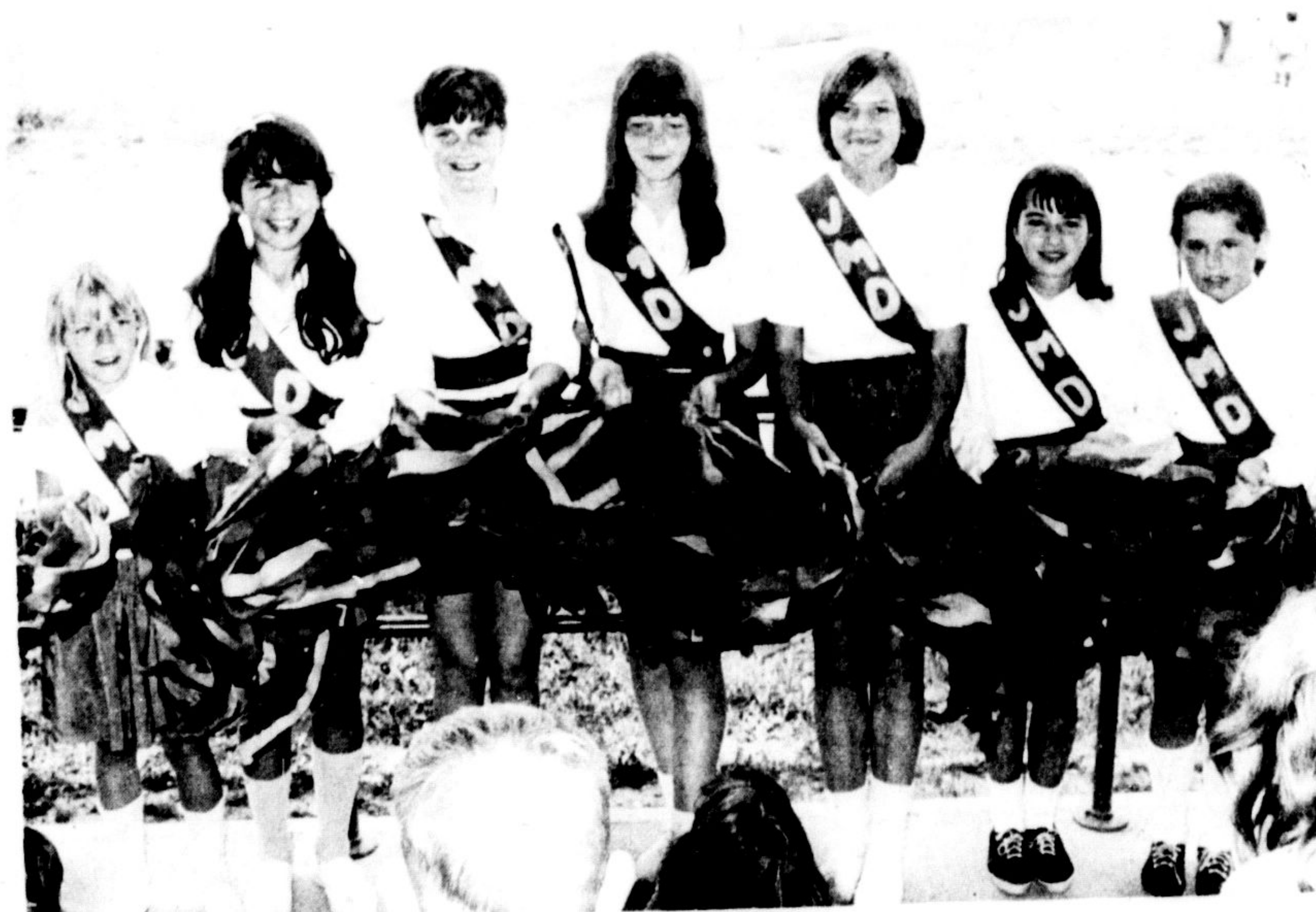
RAH RAH RAH, and it is time for the public school field day held at the fair grounds Friday afternoon. J. M. Denyes cheerleaders cheered their heroes on throughout the afternoon. Cheerleaders from Bruce St. and W. I. Dick were also there and all three groups added much color to the afternoon.