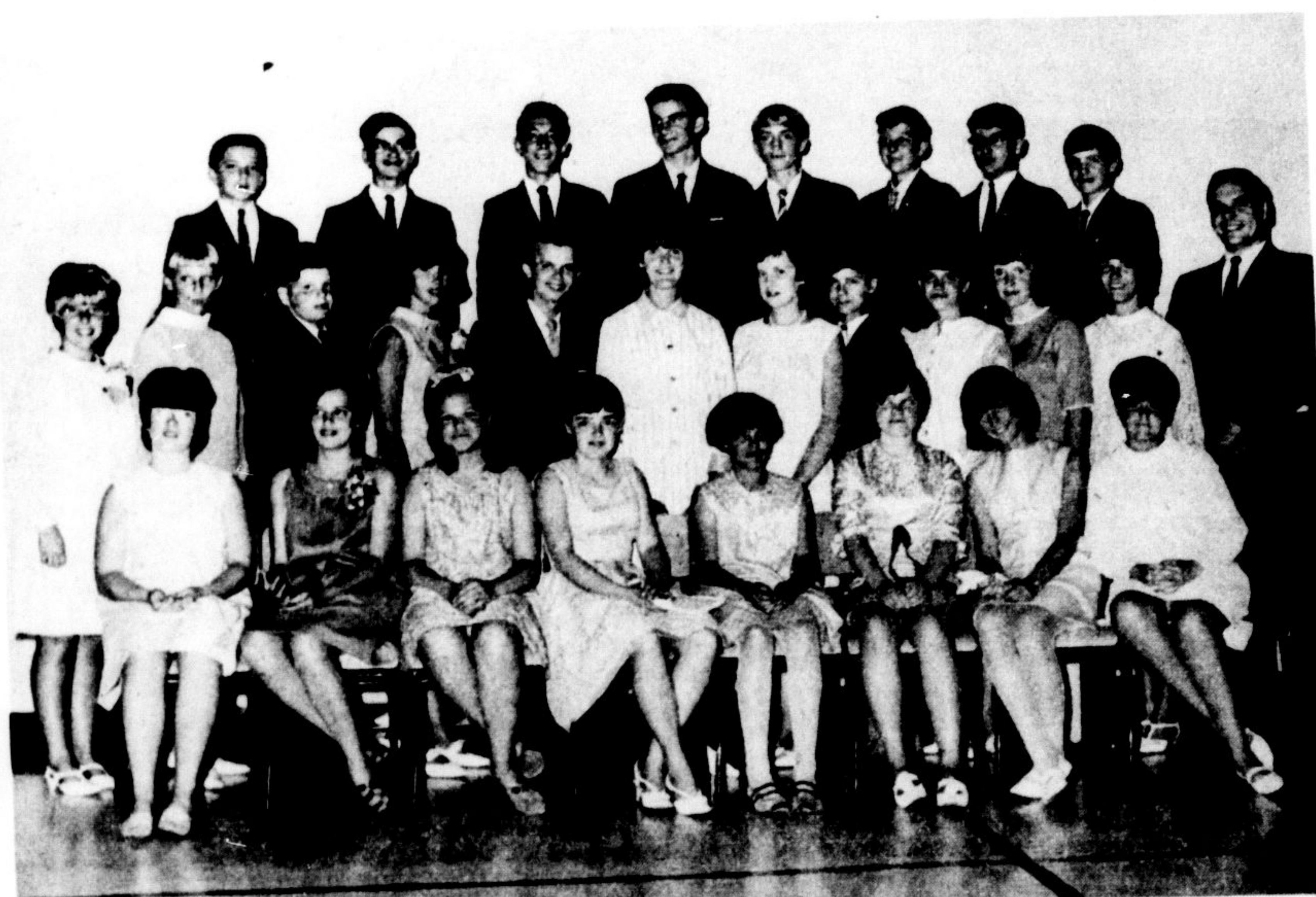
THE GRADE 8 CLASS of J. Hier will include some of the first students to graduate from both grade 7 and 8 at the new school.