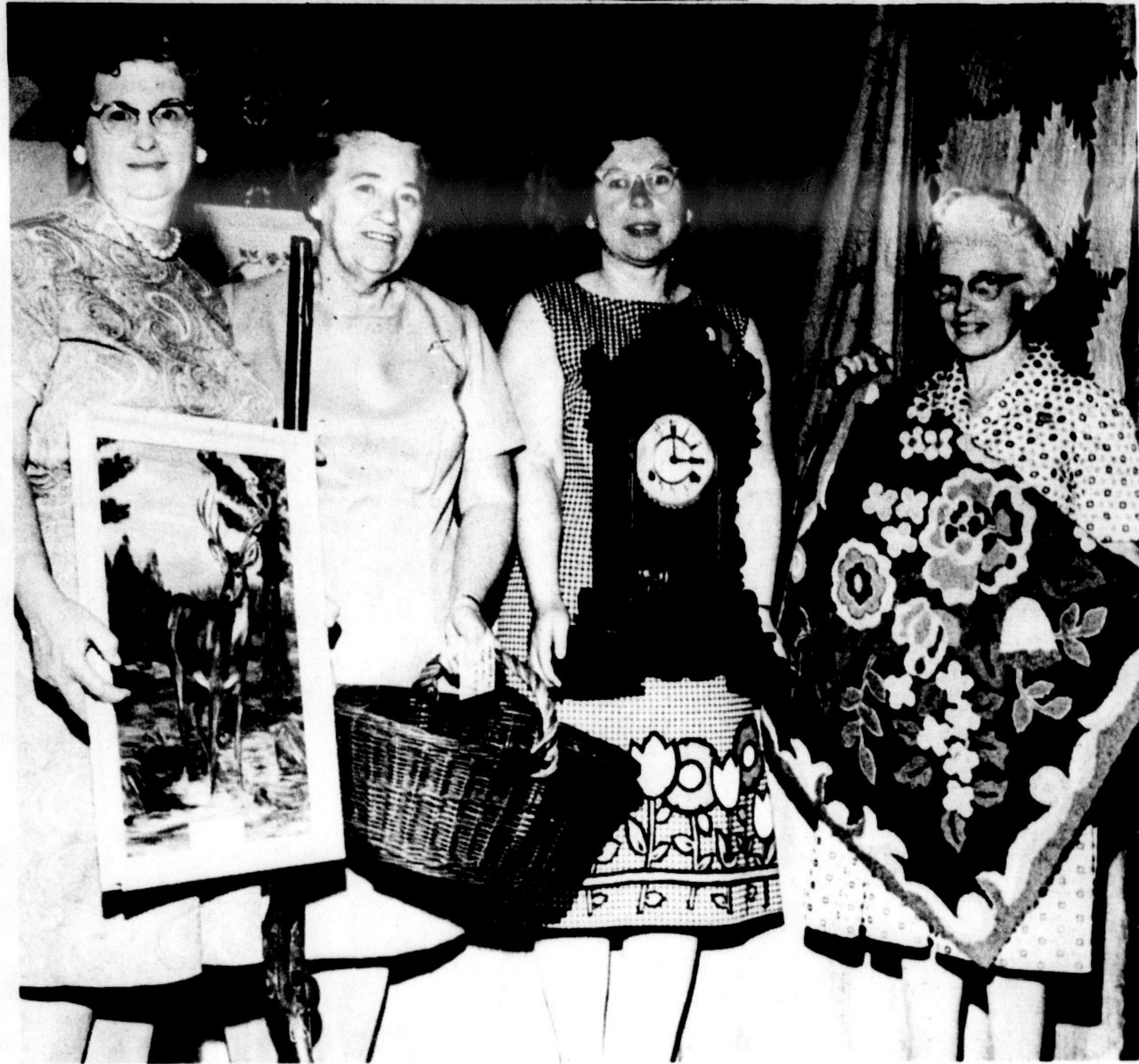
A QUILT, CRAFT AND HOBBY SHOW was held in the agricultural grounds in Milton on Saturday by the ladies of Hornby Women's Institute, as a centennial project. The ladies, assisted by residents of Hornby and district, collected a vast array of rugs, quilts, handicrafts, rep-