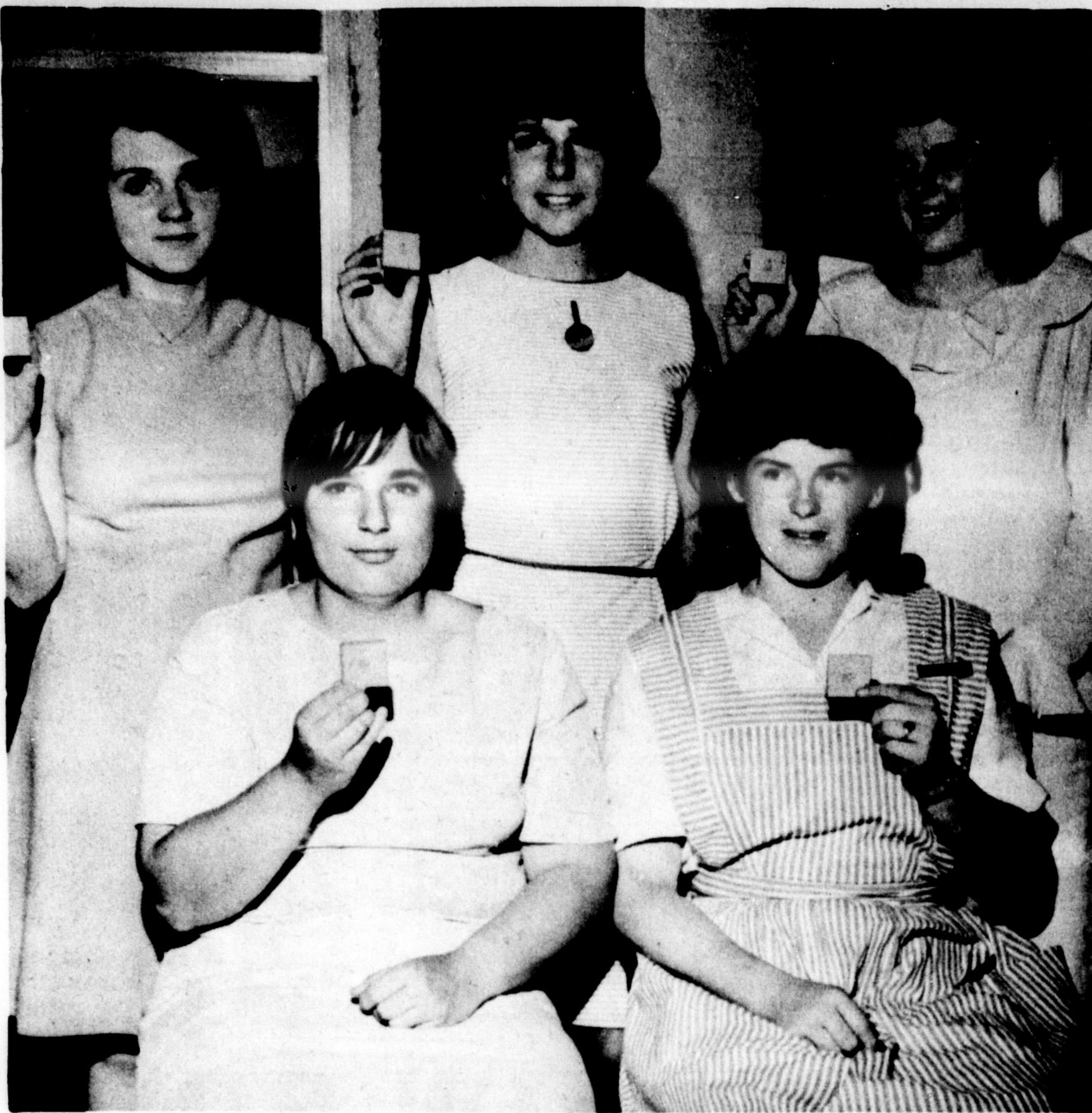
MILTON HOSPITAL'S CANDY STRIPERS are piling up good work records these days, as the young girls serve endless hours in service to patients and staff at the busy hospital. Last week at the Hospital Auxiliary annual June supper party, these five were honored with