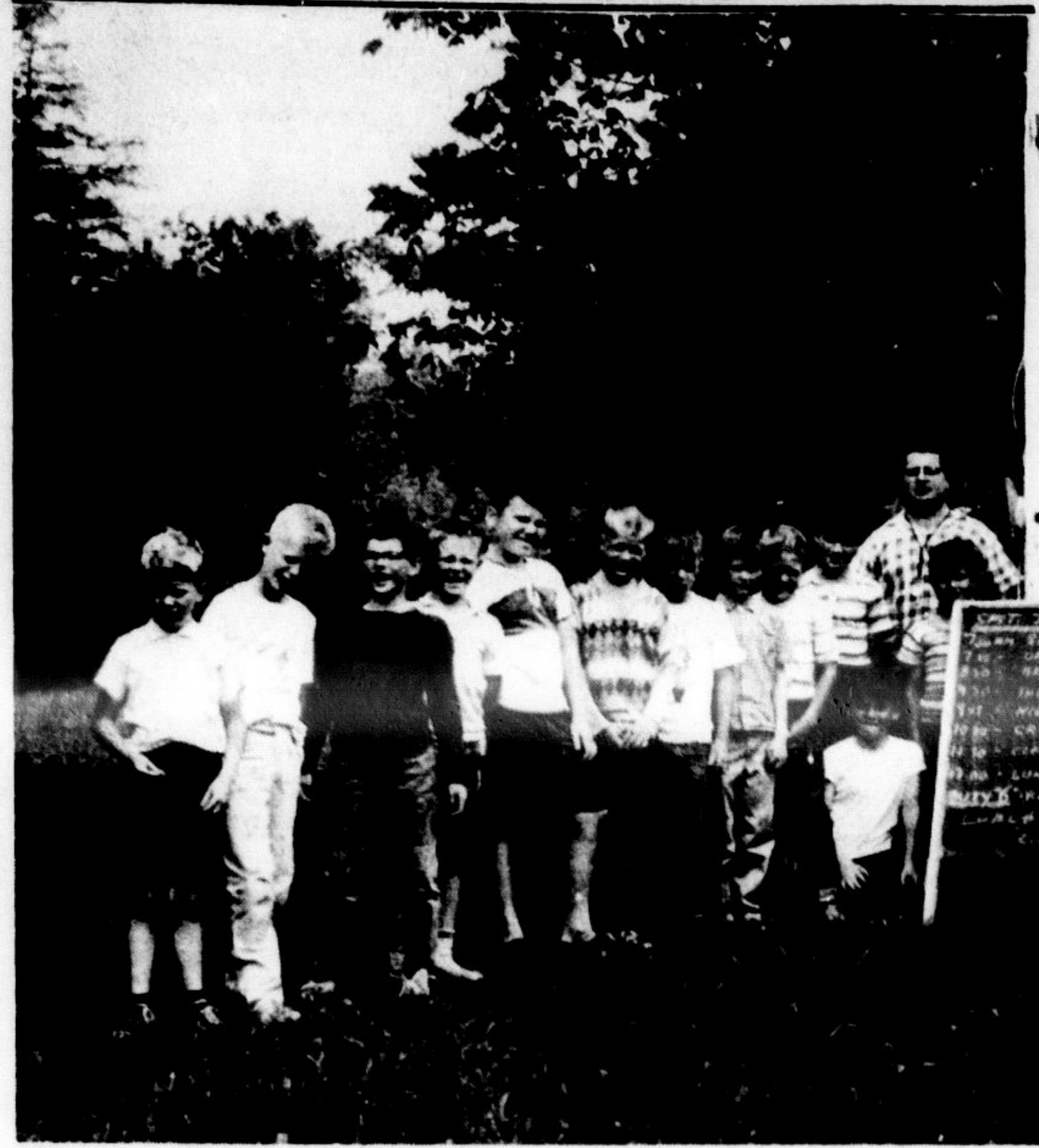
AROUND THE FLAG a group of 24 cubs and leaders gathered at the weekend camp of the Fifth Milton Cub Pack. The pack left Friday and returned Sunday after a weekend of hikes, crafts, badge and star work, sing songs, campfires and games.