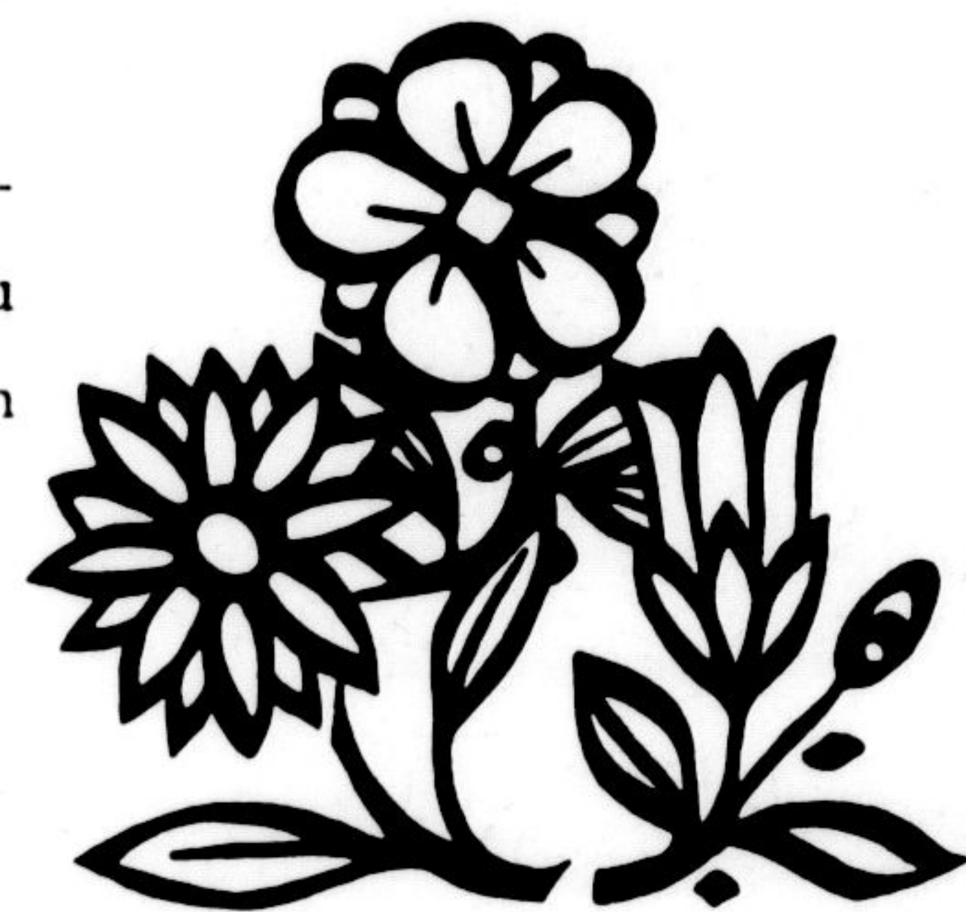
"Flowers of Hope"

All we ask you to do is—on Mother's Day if possible—plant these seeds in your window box or garden. Then plant a seed of hope for the retarded children in your neighbourhood by giving as generously as you can to the Retarded Children's Association.