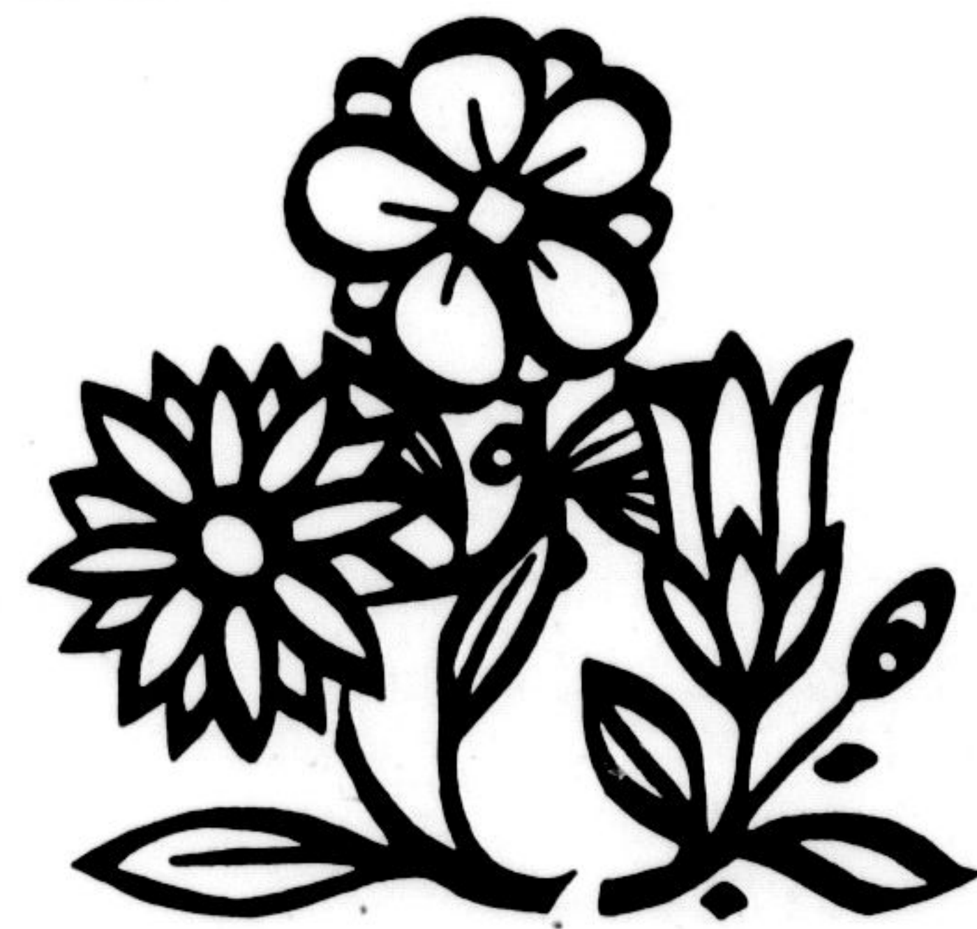
"Flowers of Hope"

Share in the work of this local organization by helping the North Halton Association for Retarded meet its objective of $5,000. Funds will be used to assist in the continuation and development of the local services aimed at helping retardates fill a useful position in the community.