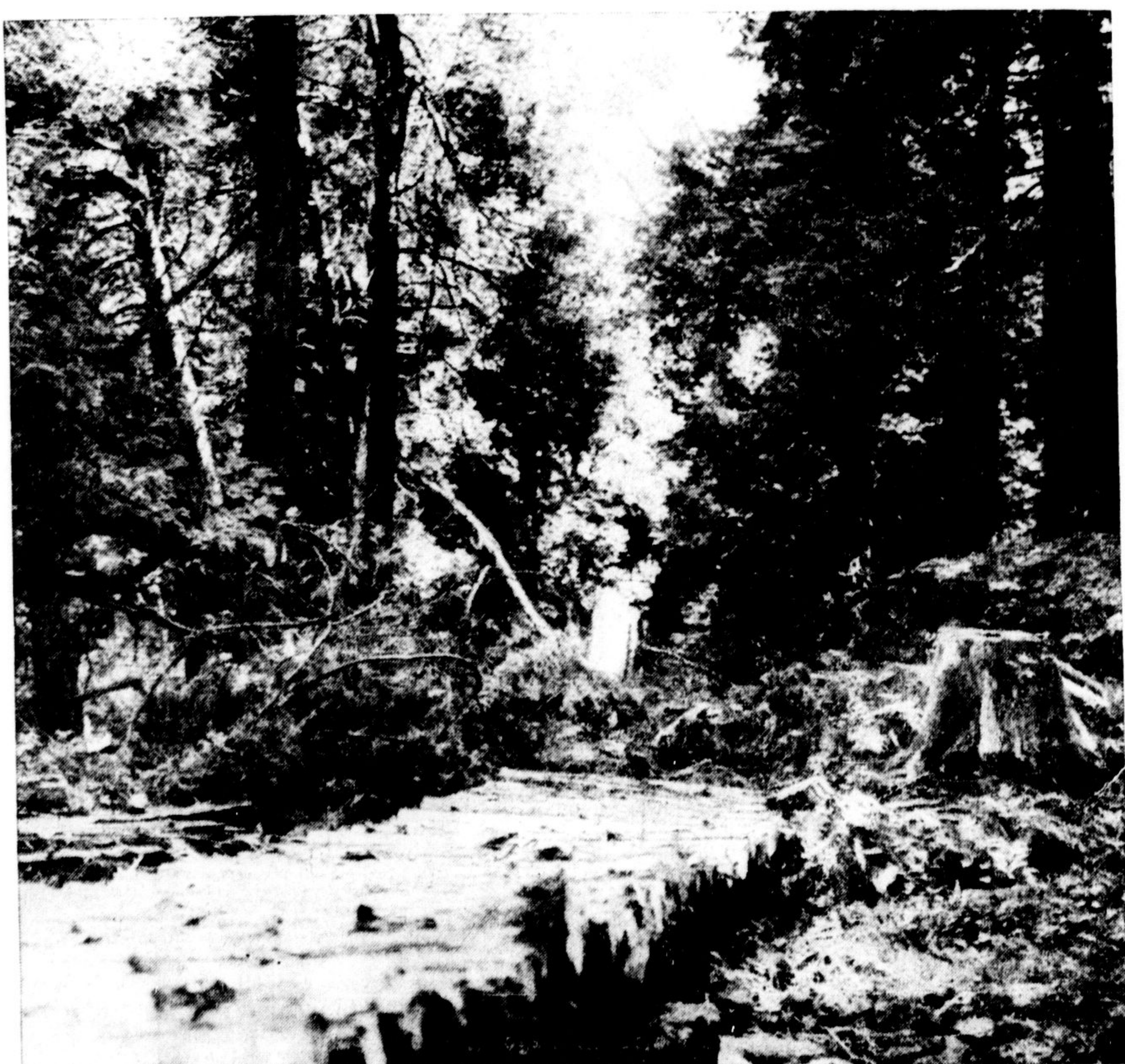
A foot bridge made of logs leads across a rippling creek