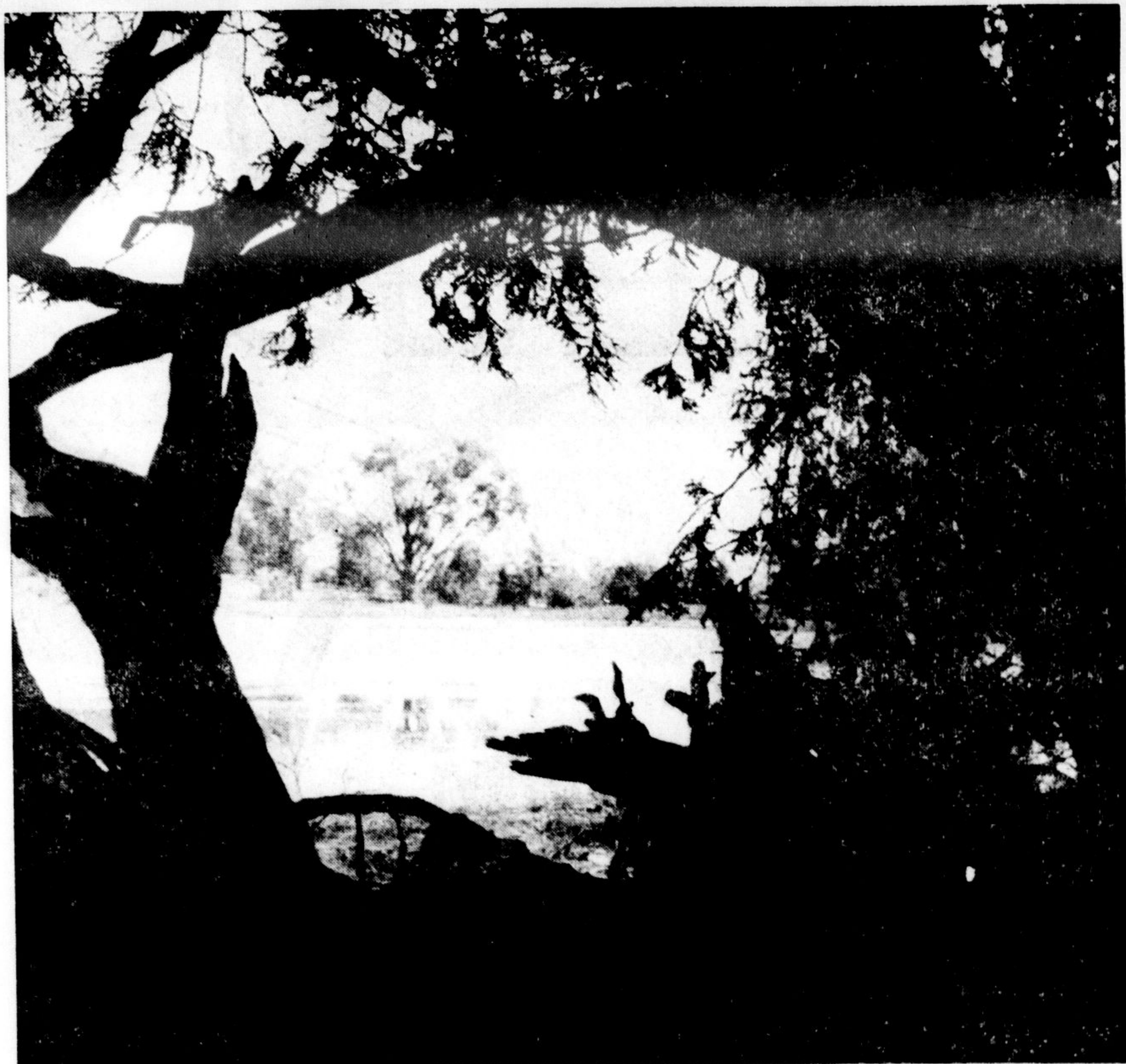
Looking out onto the reservoir through an old wooden fence

If you like to walk in the woods — but not too far — the Burns Nature Area just northwest of Campbellville might be an ideal spot.