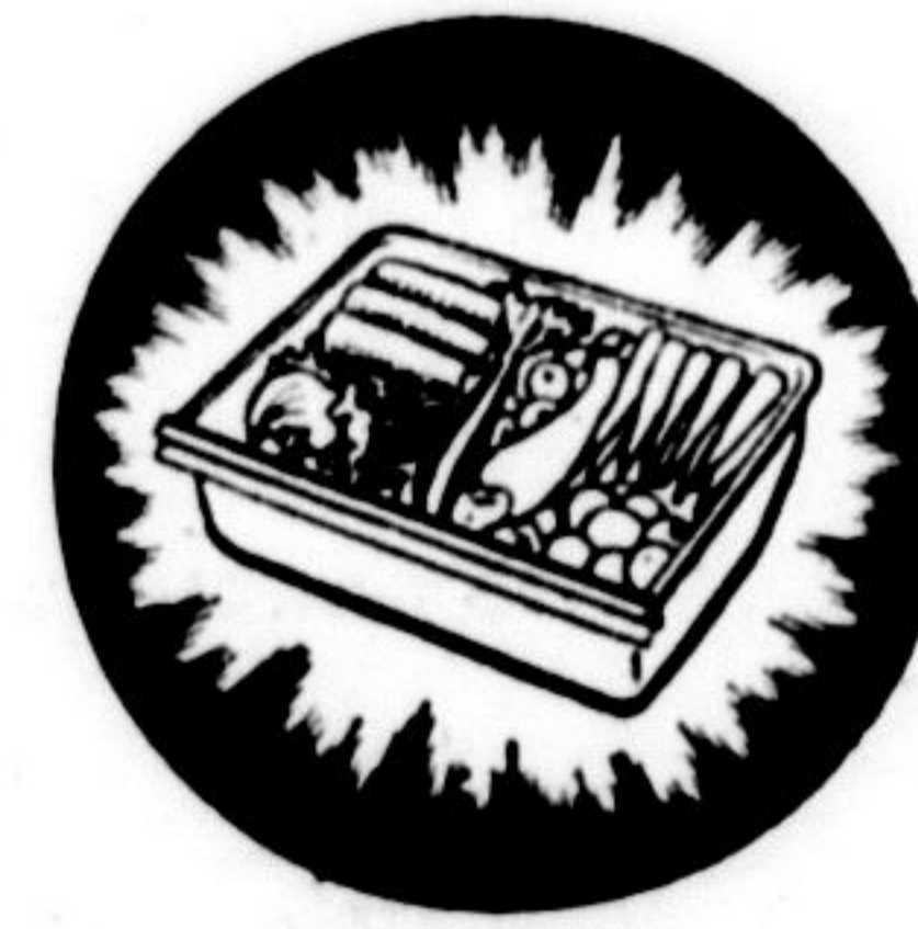
Full Width Vegetable Crisper

Limited Quantity -- 10 Only at This Low, Low Price