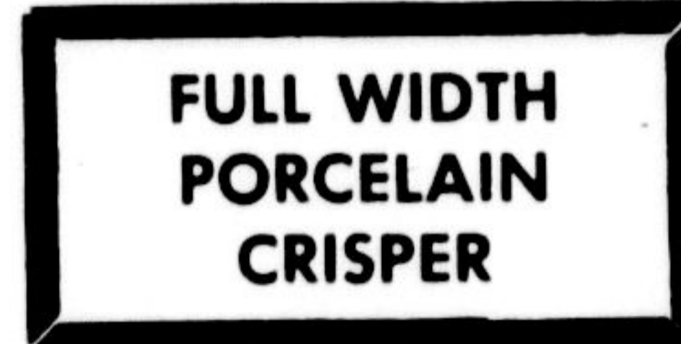
FULL WIDTH PORCELAIN CRISPER