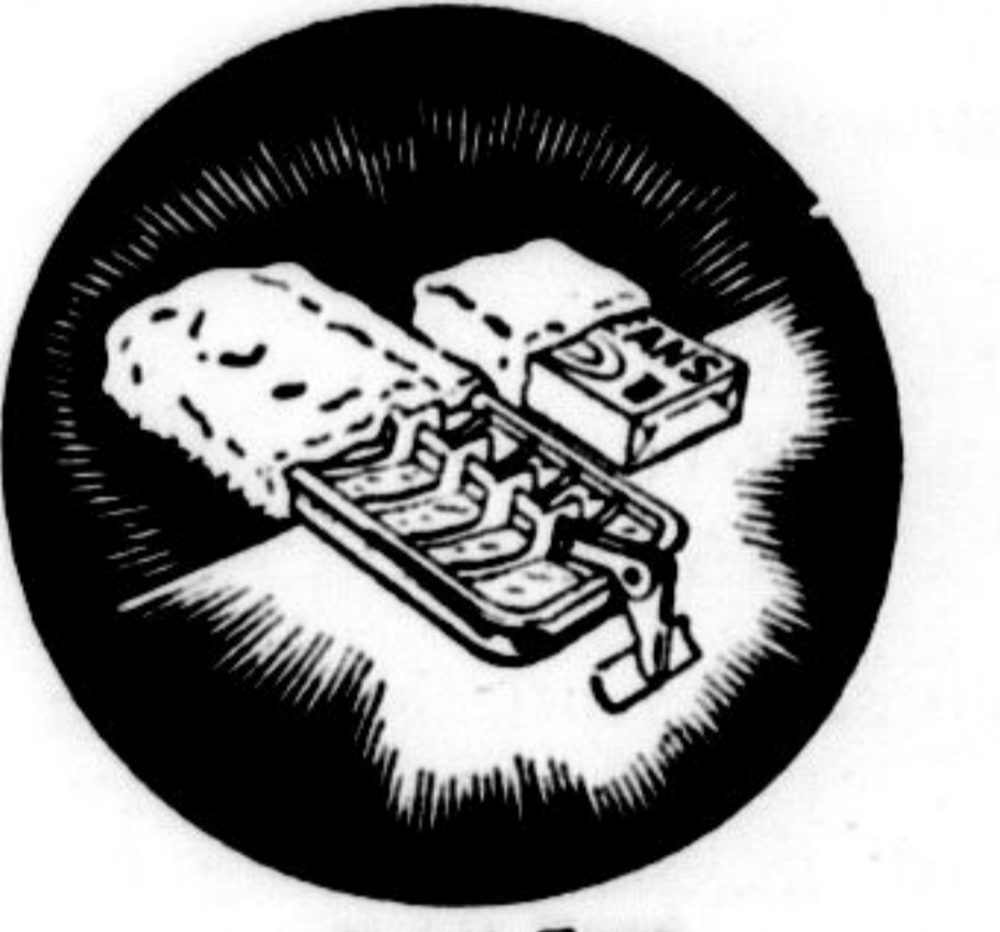
Frost Free — Never Defrost Again