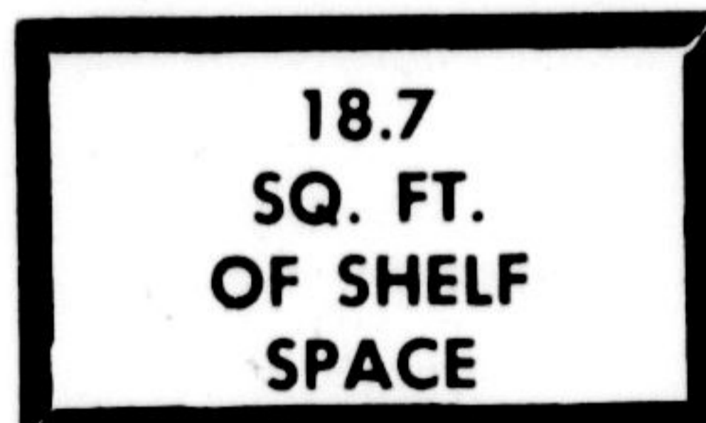
18.7 SQ. FT. OF SHELF SPACE