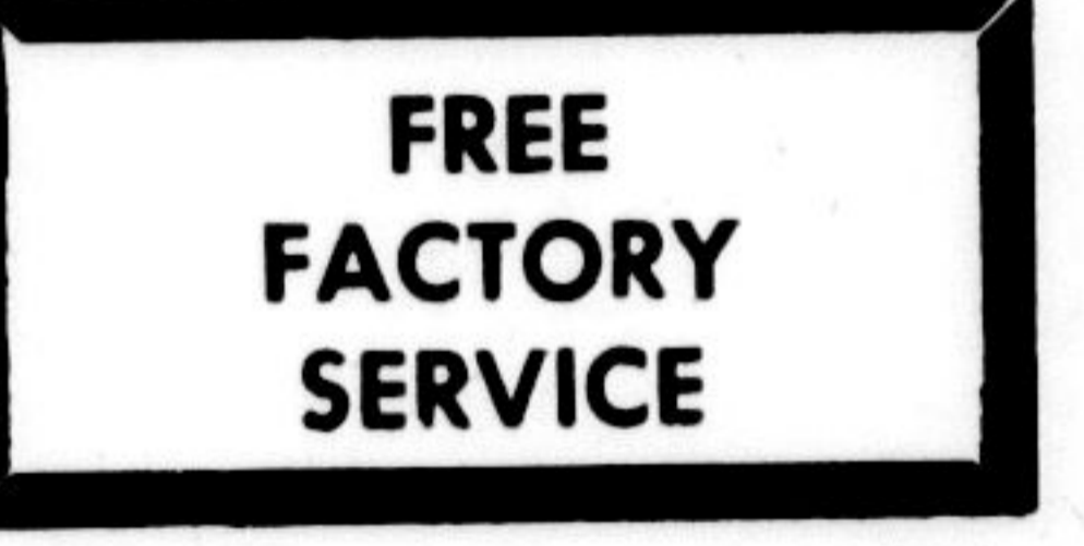
FREE FACTORY SERVICE