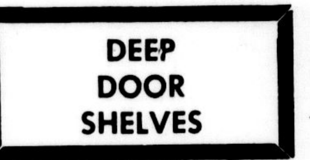
DEEP DOOR SHELVES