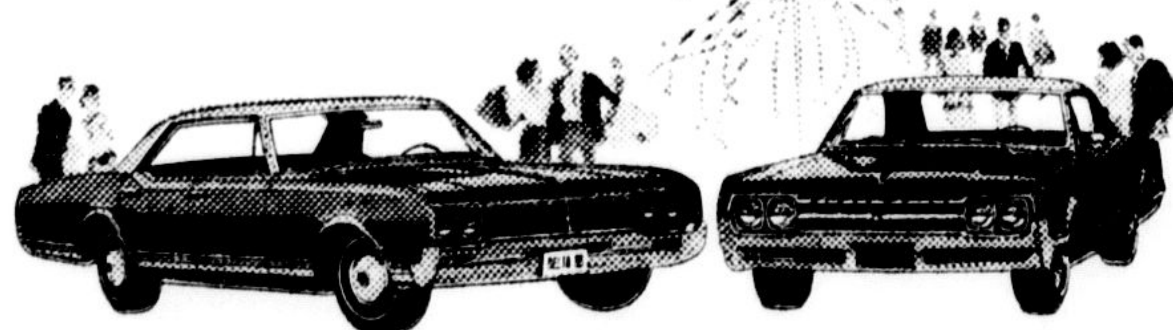
Delta 88 Holiday Sedan