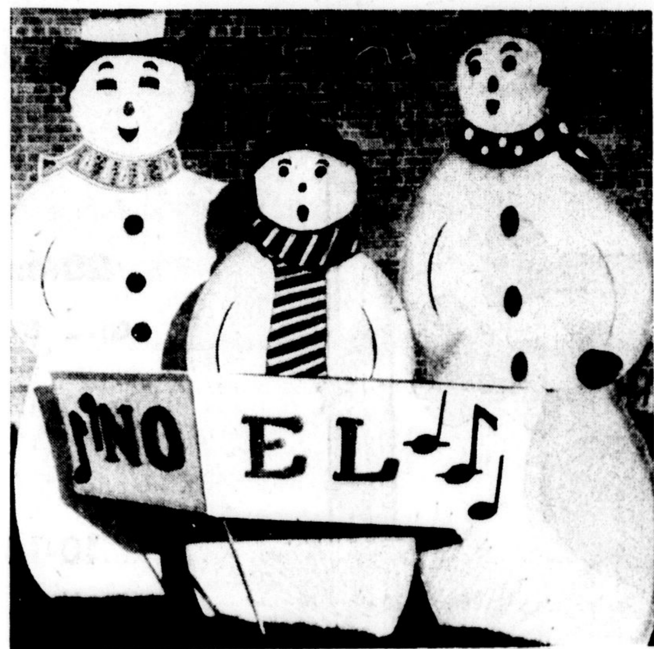
CAROLING SNOWMEN were among the colorful outdoor decorations at Ontario School for the Deaf this year. The displays, done by school staffers, helped brighten up the school campus over the holiday period.

However, for all the criticism and friction it stirred up, the design is still the most popular of Christmas cards in Canada was James Campbell and Son of Montreal in about 1874. However, in 1872 penny postcards were introduced in England and by the 1890's, the popularity of Christmas cards had begun to wane. But something was lacking in the postcards, especially as the message was on view for many an inquisitive eye. By 1910, Christmas cards were back in favor bearing a more personal 'From me to you' type of message and from this, today's cards have evolved.