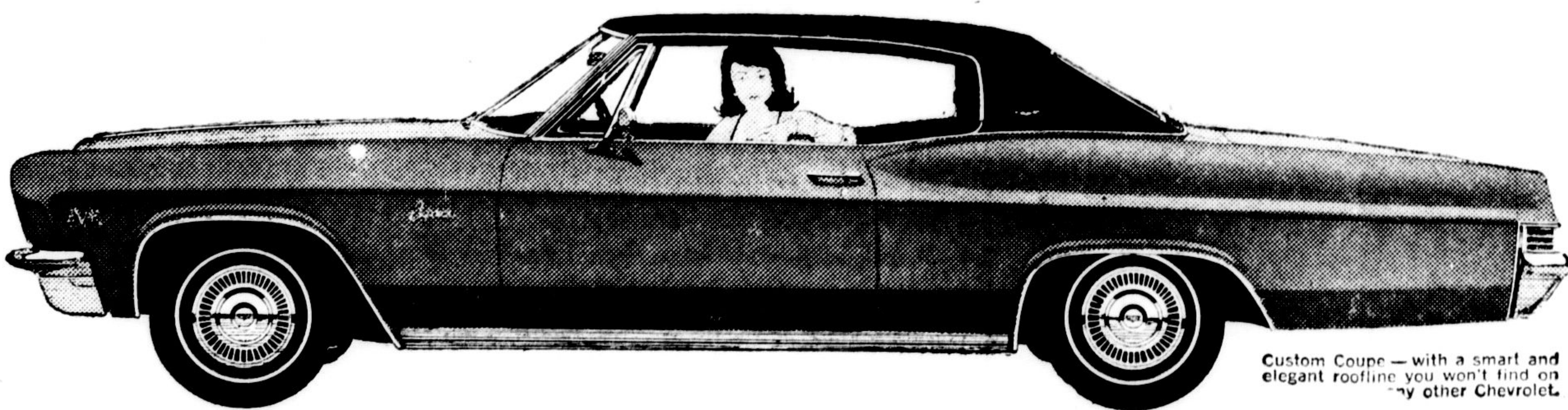
Custom Coupe — with a smart and elegant roofline you won't find on any other Chevrolet.

A whole new series of elegant new models — the most lavish Chevrolet has ever built. There's the Caprice Custom Coupe, Caprice Custom Sedan and the luxurious new Caprice Custom Wagon. Truly elegant in every detail, they invite (and deserve) your closest inspection.