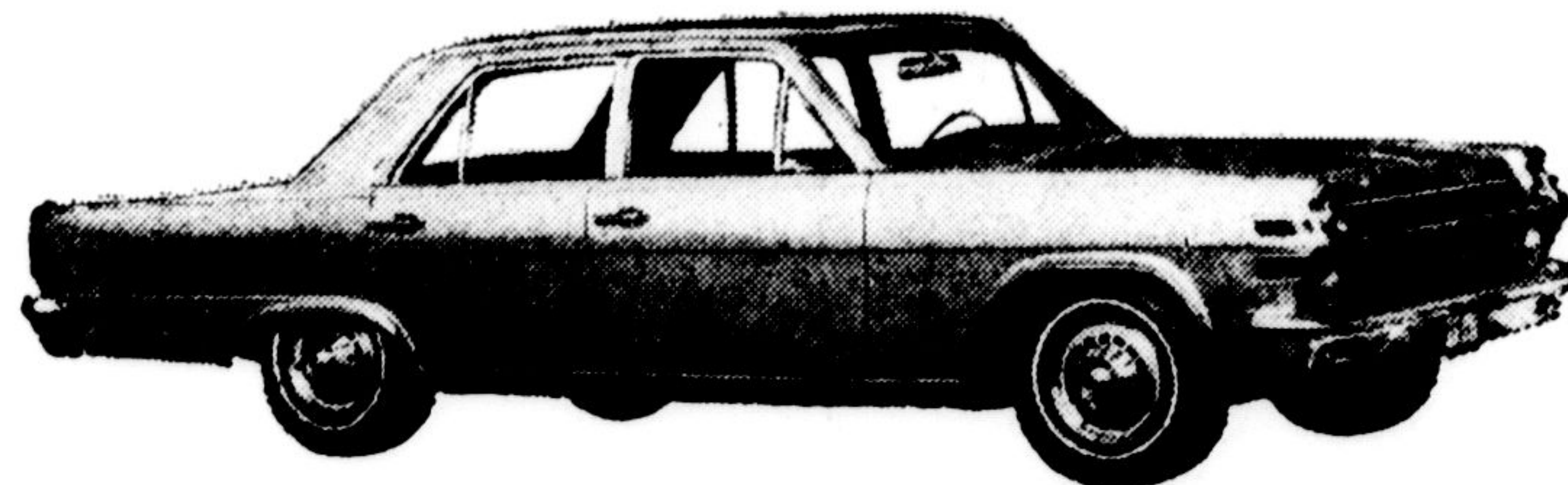
1966 AMBASSADOR 990 Four-Door Sedan by American Motors