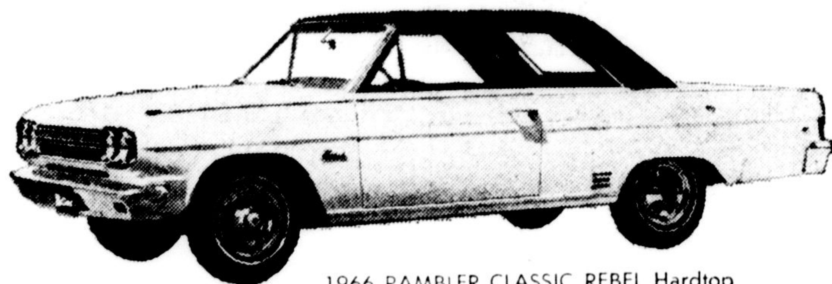
1966 RAMBLER CLASSIC REBEL Hardtop