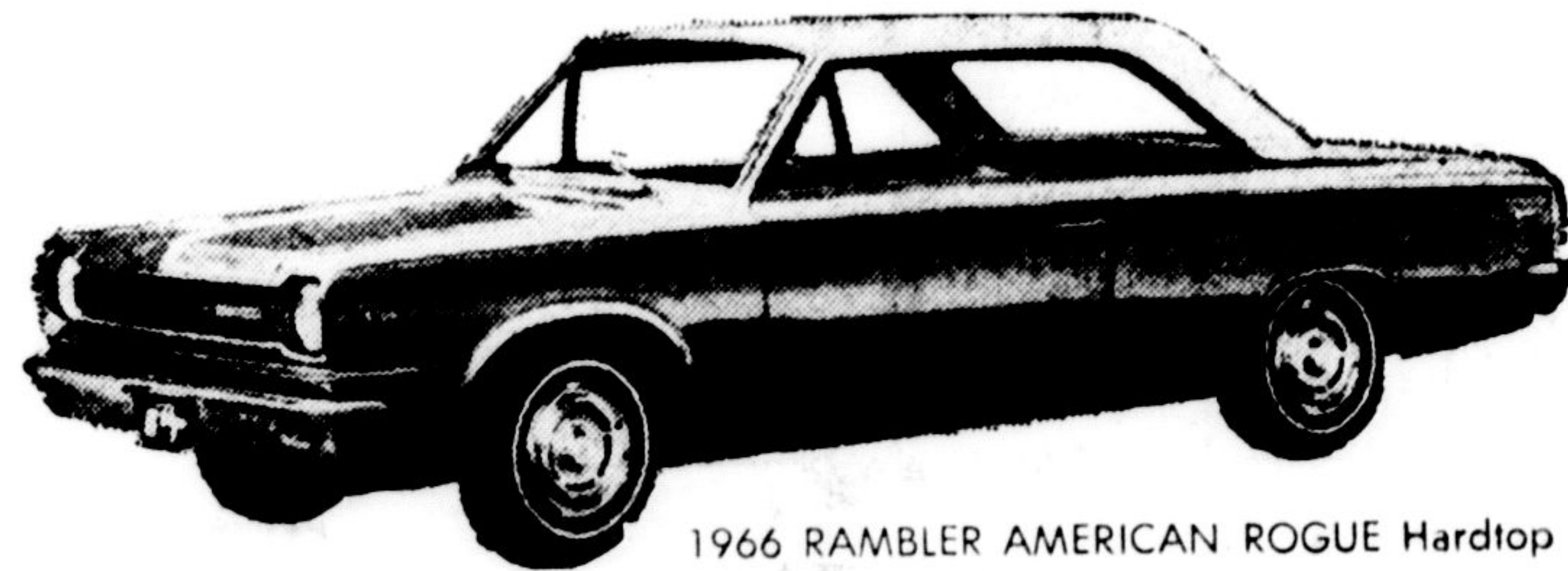
1966 RAMBLER AMERICAN ROGUE Hardtop