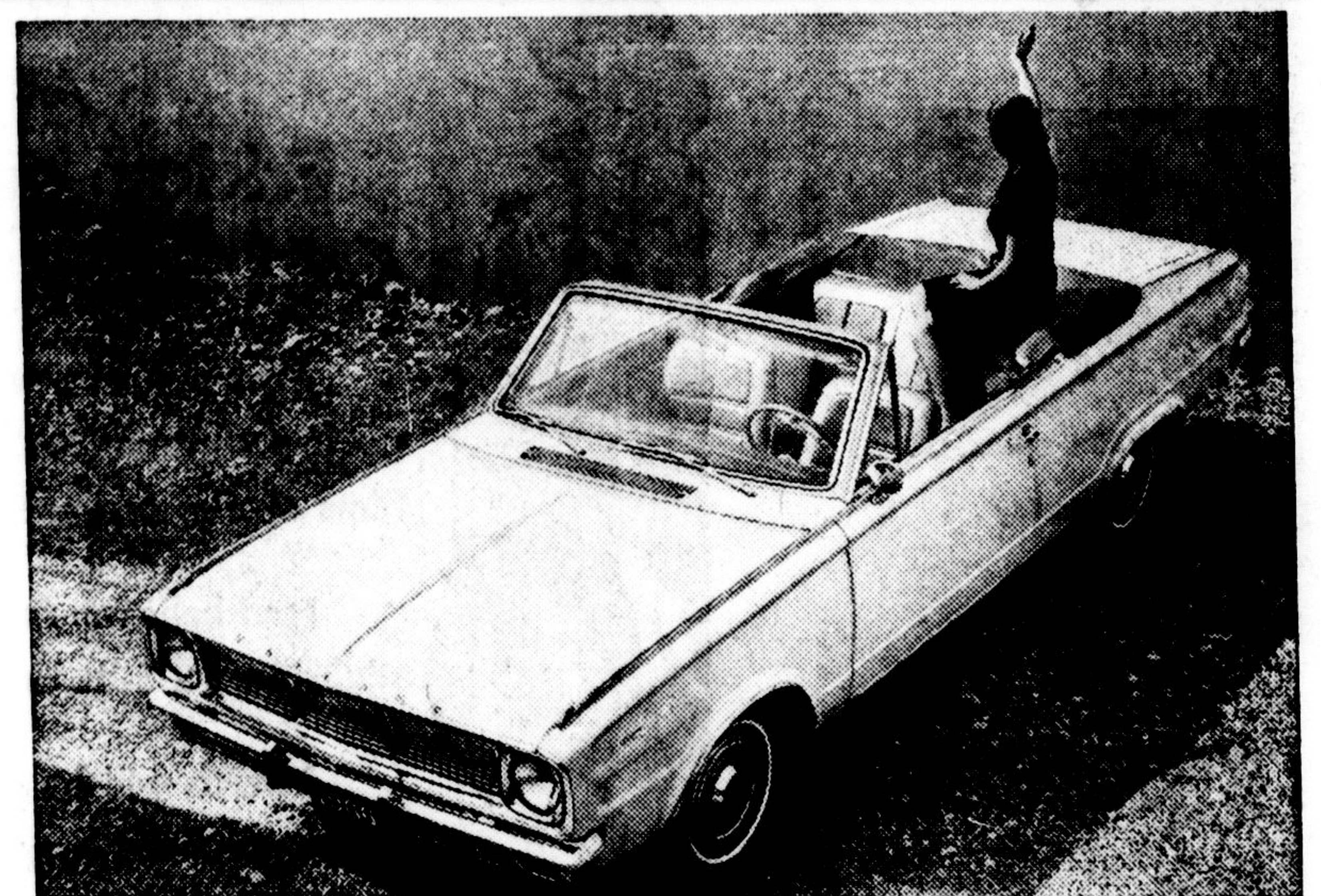
1966 VALIANT SIGNET CONVERTIBLE

MOST MODELS OF THE NEW '66's AVAILABLE NOW AT BELL BROS.