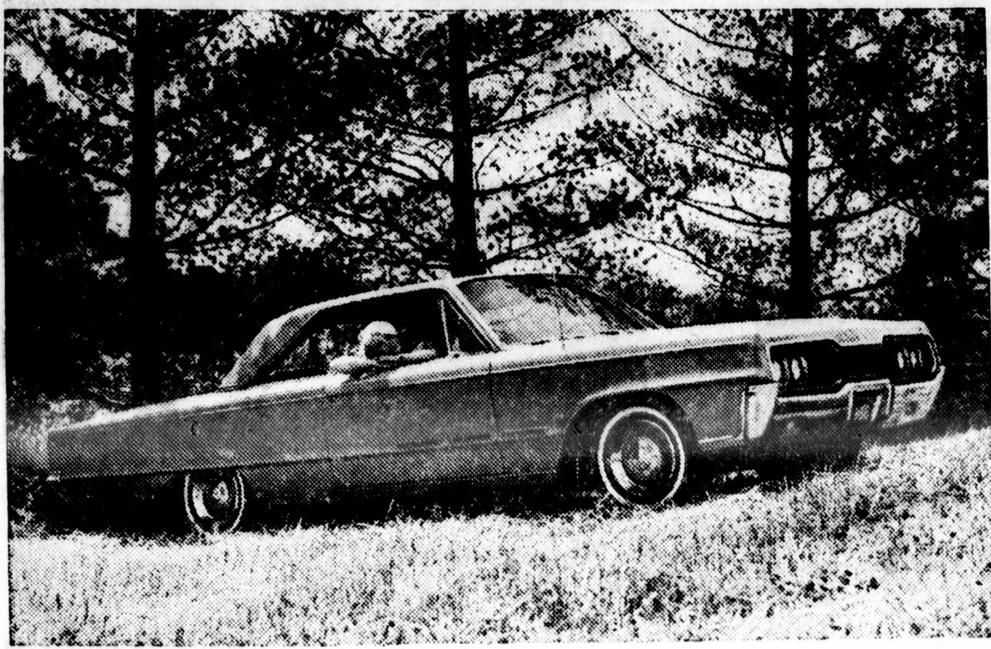
DRAMATIC NEW IDEAS in styling, performance, spaciousness and comfort distinguish Dodge for 1966. Crisp, clean lines of the new Dodge are set off by a bold new grille and neatly-styled delta shaped tail lights. There are 30 models available. Shown is the Monaco two-door hardtop.