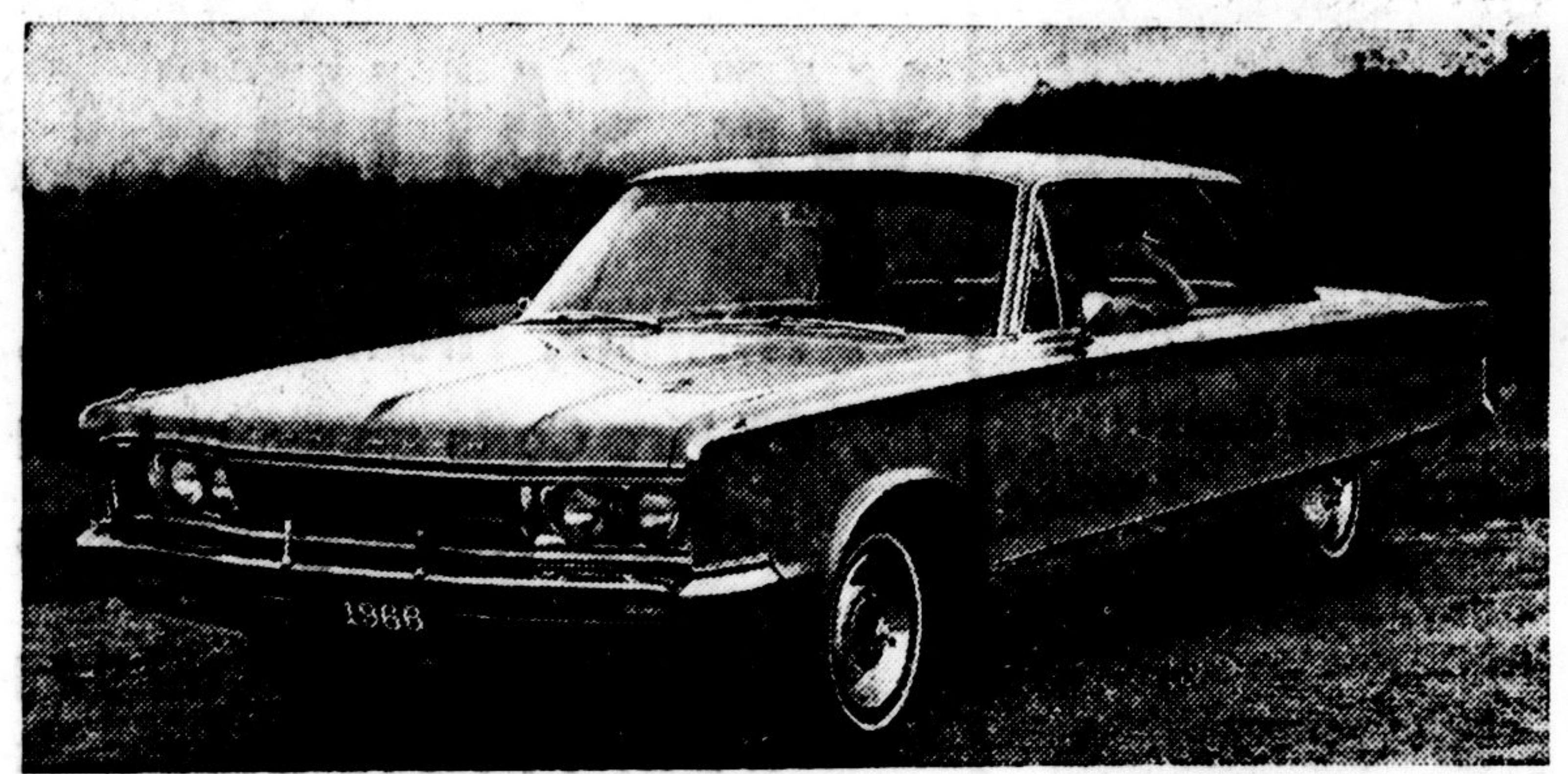
1966 CHRYSLER NEW YORKER 4-DOOR HARDTOP

SEE THE NEW '66's AT BELL BROS. THURSDAY, FRIDAY, SATURDAY