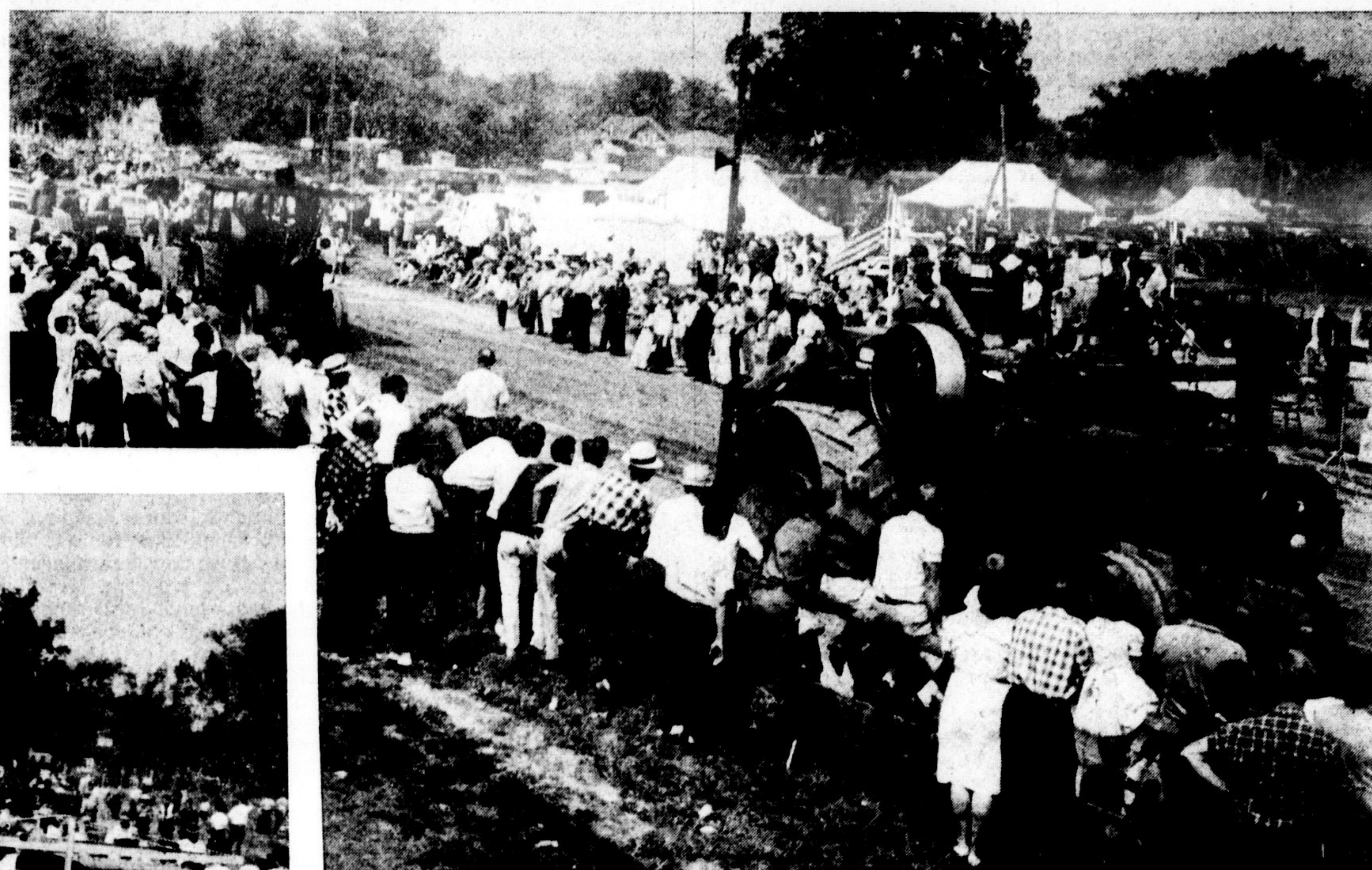
DAILY PARADES IN MILTON FAIR GROUNDS attracted a large crowd of Steam-Era visitors as dozens of gas tractors, steam engines, antique cars and trucks drove "under their own steam" around the race track. The grandstand, seating close to 3,000 was full for every parade and thousands more watched along the sides of the track.

AND A DANDY it was at that, as evidenced by these photos showing some of the Saturday and Monday crowds at Steam-Era parades. At left is a threshing demonstration, at right a parade in the fair grounds, and below a view of the sawmill area.