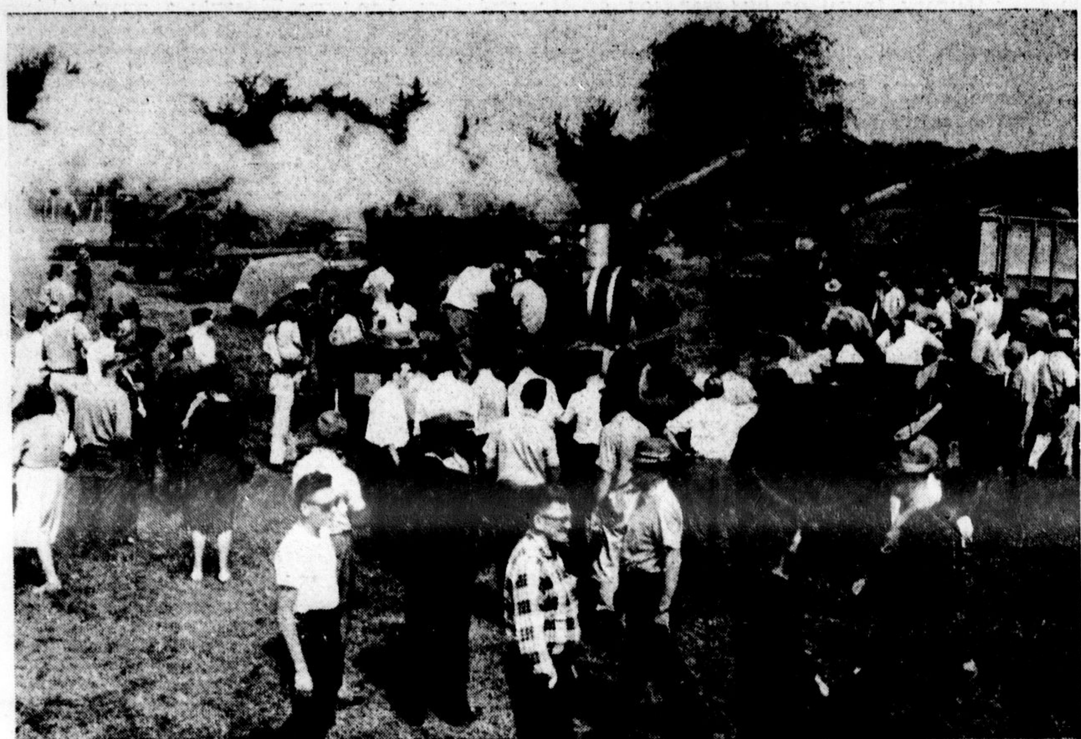
AN OLD FASHIONED THRESHING BEE could be seen almost anytime during the weekend Steam-Era reunion and gas tractors operated the ancient separators, as steam. The smoke and the chaff filled the air, as the outdated giants of yesteryear did their stuff.