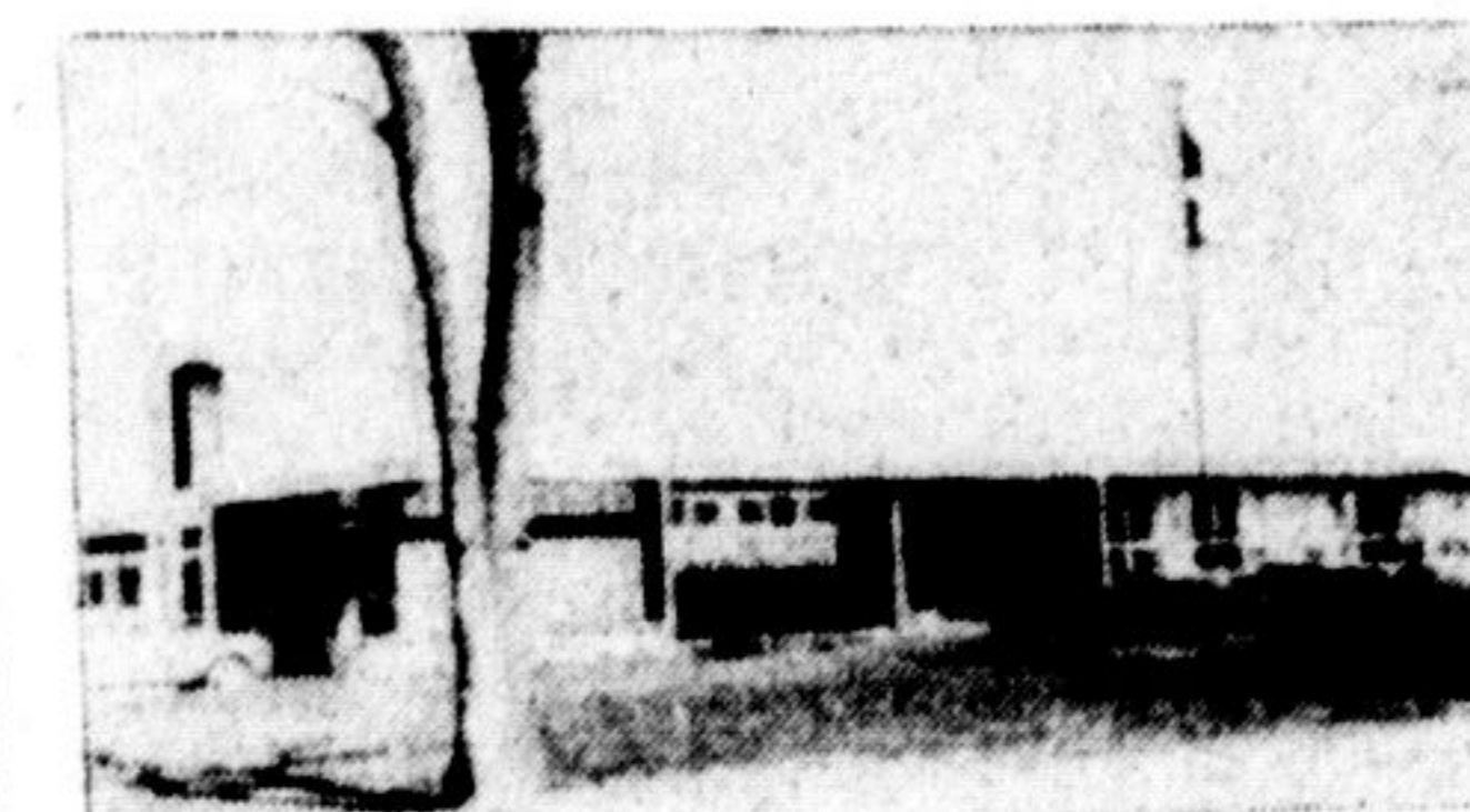
Public School Board Briefs

Board members agreed to continue the discussion at another meeting.