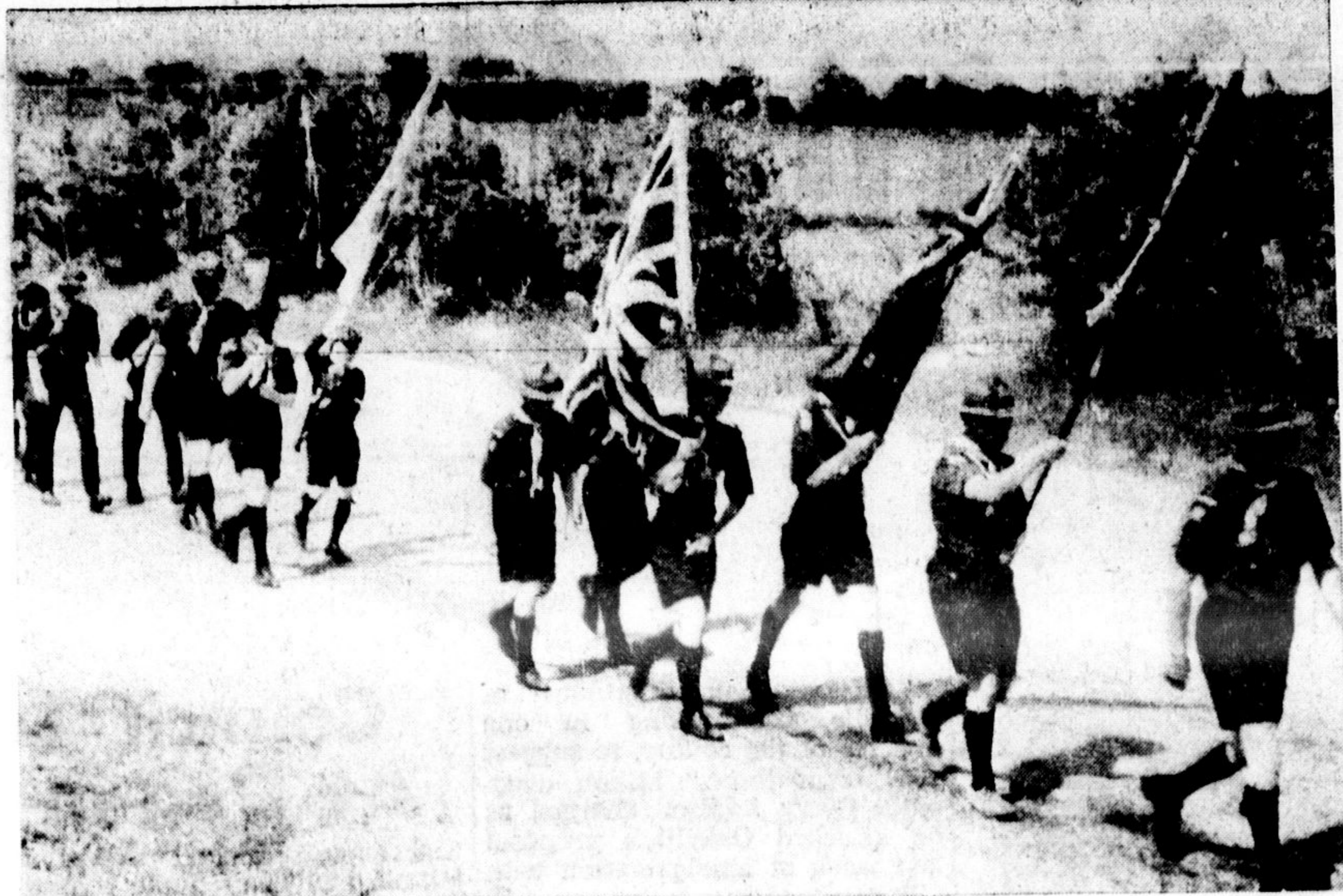
MORE THAN 30 CUBS and Scouts from the First Hornby Cub and Scout Group marched to St. Stephen's Anglican Church on Sunday morning for a flag dedication service. At an 11 a.m. service Canon Maxwell dedicated a Red Maple Leaf flag. Youngsters are shown here as they march to the church.

The two groups agreed to meet again July 5.