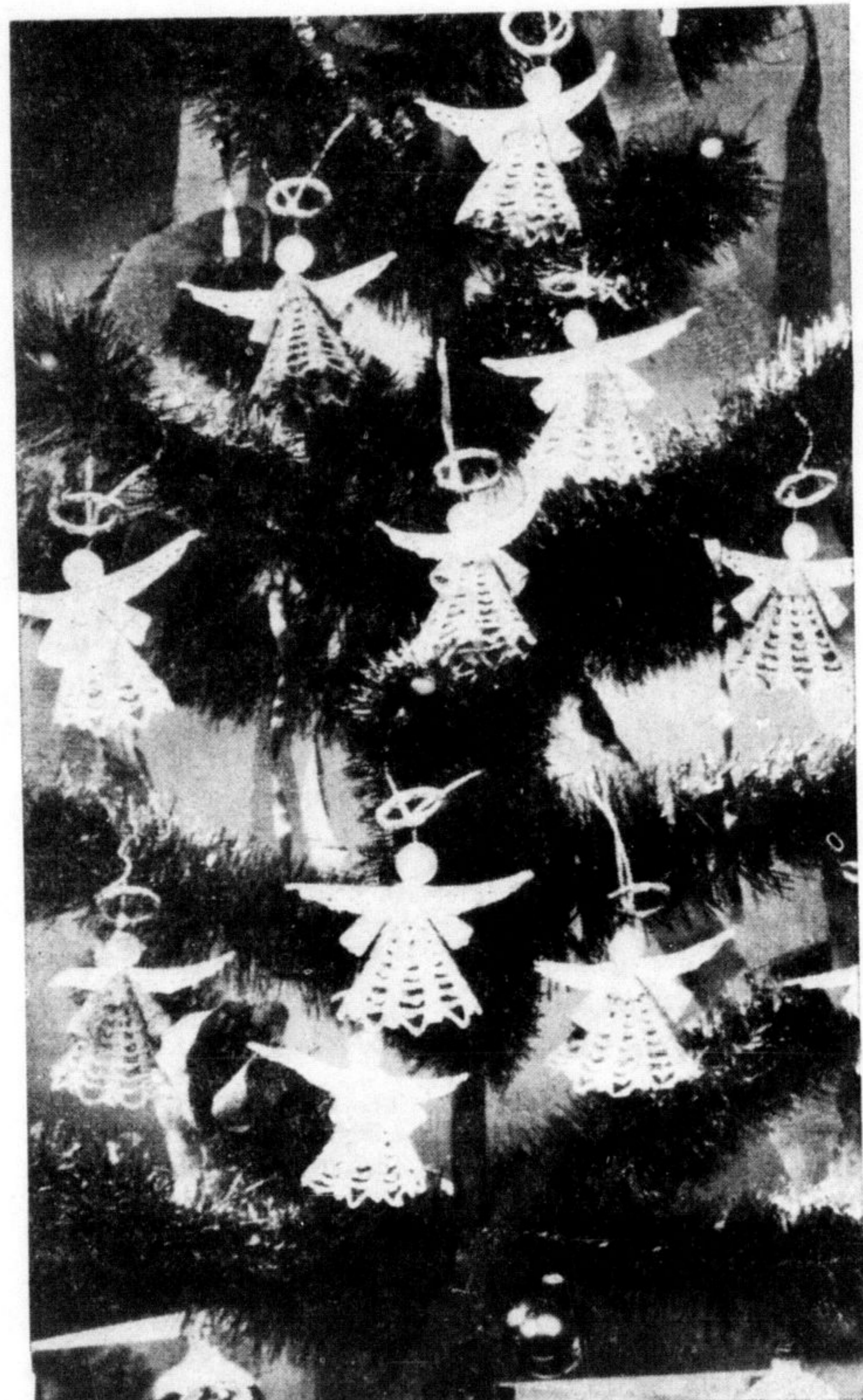
ANGEL TREE DECORATIONS: For originality use these crocheted angels for your Christmas tree decorations. Besides adding sparkle to your tree, they also give that touch of individuality. Send 10 cents and a stamped, self-addressed envelope for Leaflet No. C-8550, to The Champion.