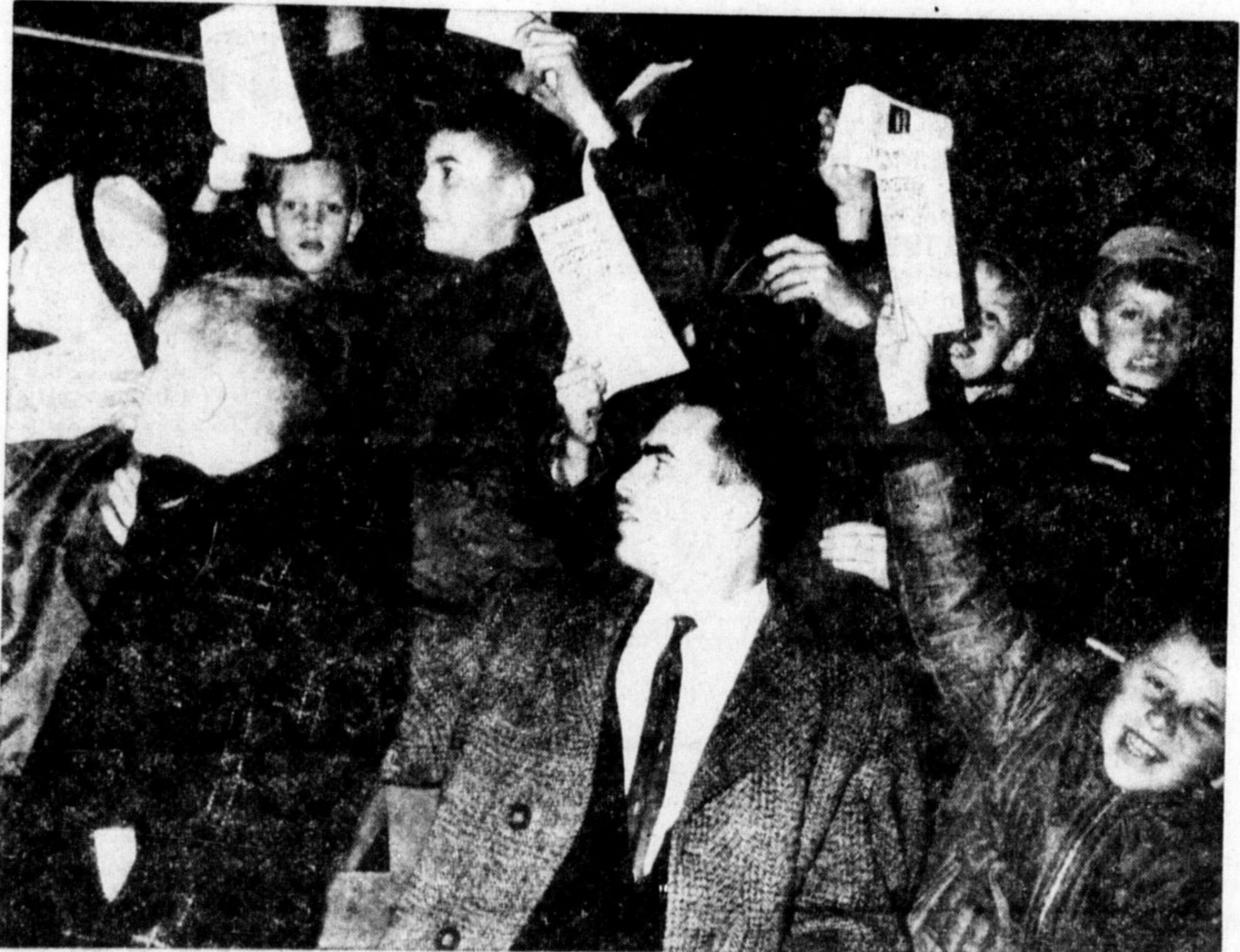
35 STUDENTS from the Ontario School for the Deaf, Milton, were special guests of the Milton Merchants for the season opener. All the youngsters seemed to enjoy the game and they are shown here as they register their approval.