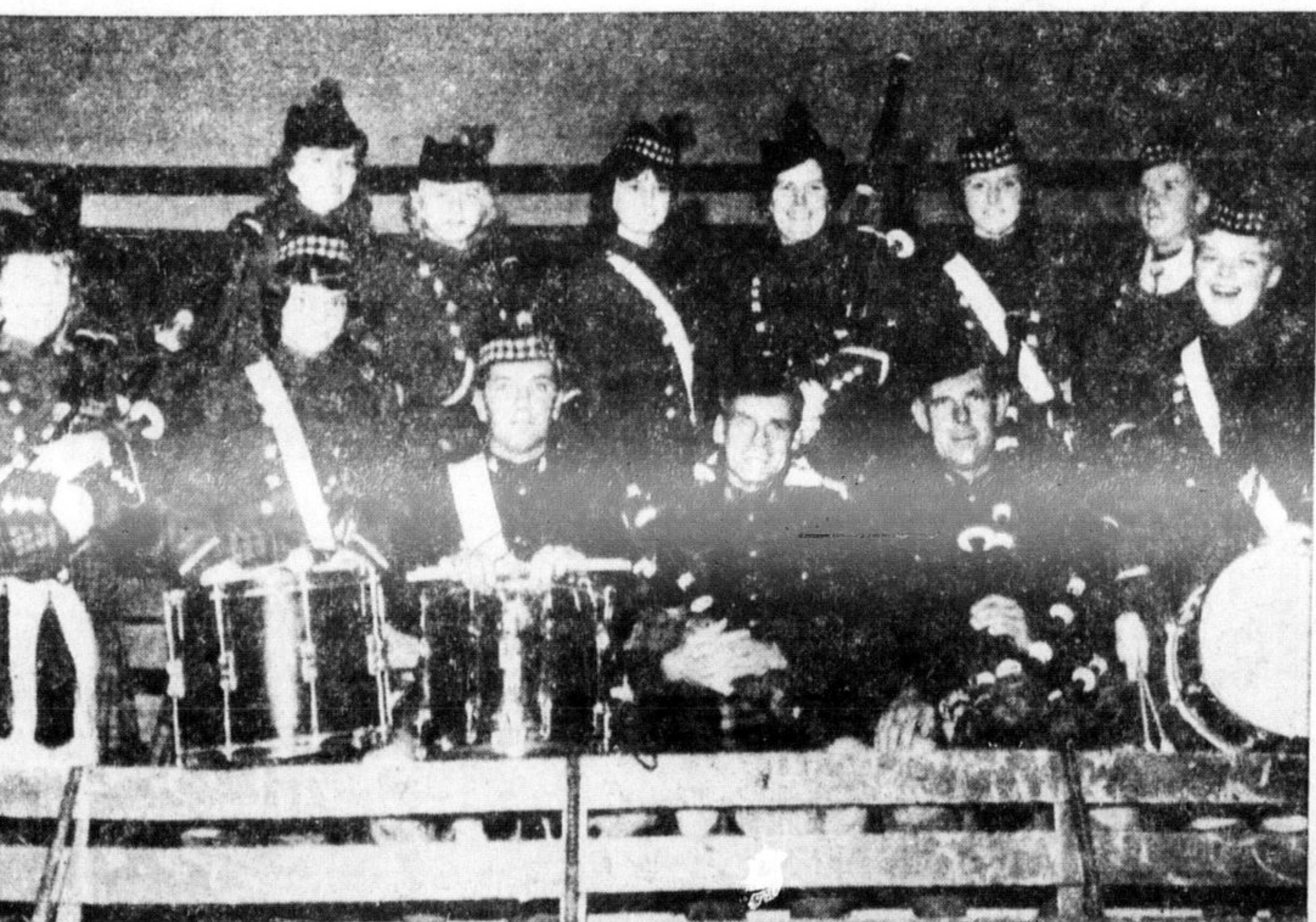
PIPE AND DRUM MUSIC at the opening game festivities was supplied by members of the Lorne Scots and Milton Girls' Pipe bands. Shown before the start of the game are some of the pipers and drummers who performed on Friday evening.