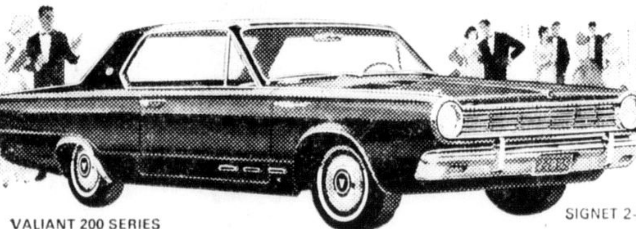
VALIANT 200 SERIES

NOBODY BEATS VALIANT FOR VALUE AND CHOICE