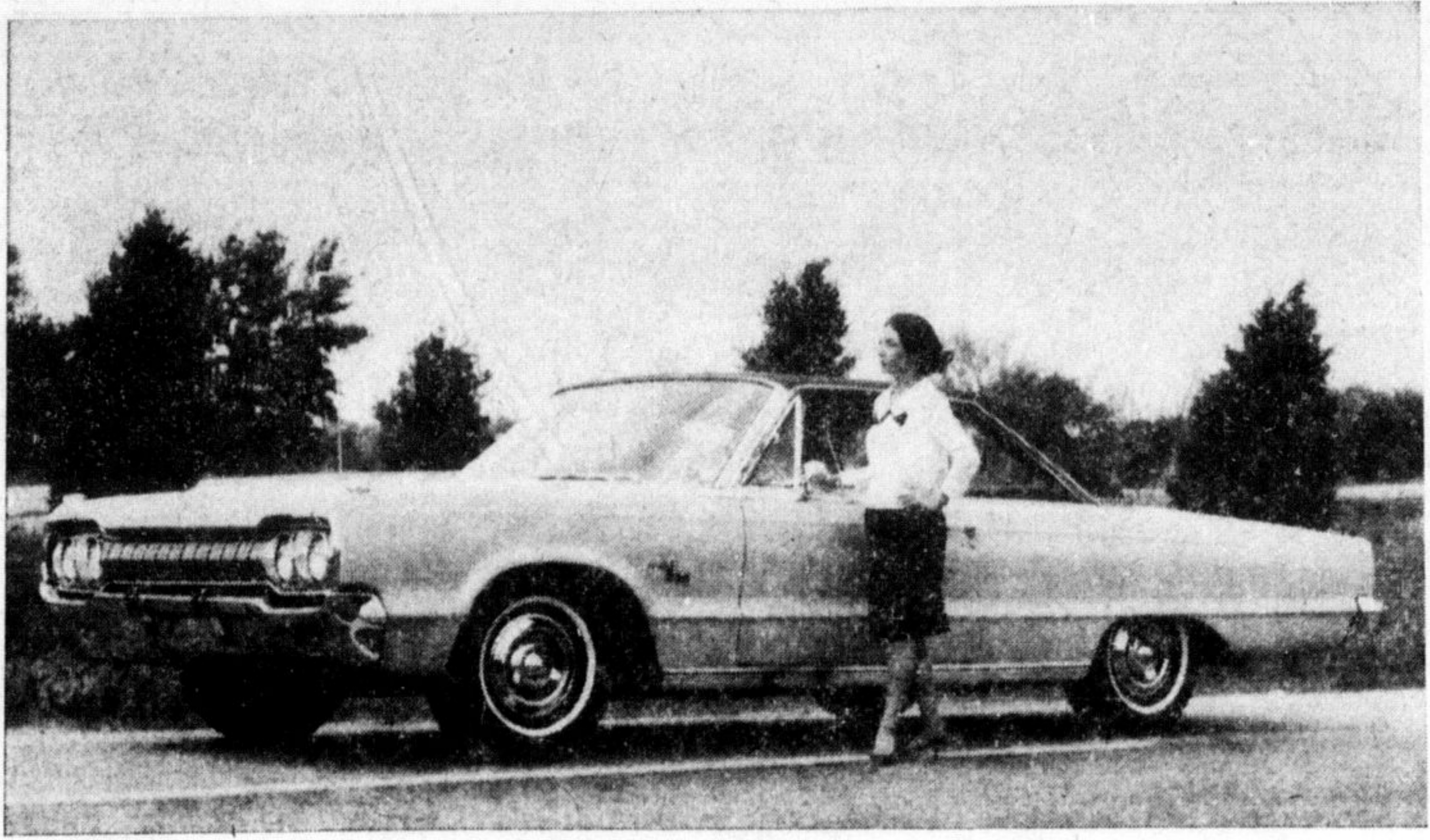
RESTYLED AND BUILT on a 121-inch wheelbase, the 1965 Dodge from Chrysler Canada Ltd. represents an entirely new conception in motoring beauty and function. Engine and suspension system refinements enhance the operation and riding qualities of the new Dodge for 1965. Pictured is the Dodge Monaco two-door hardtop.