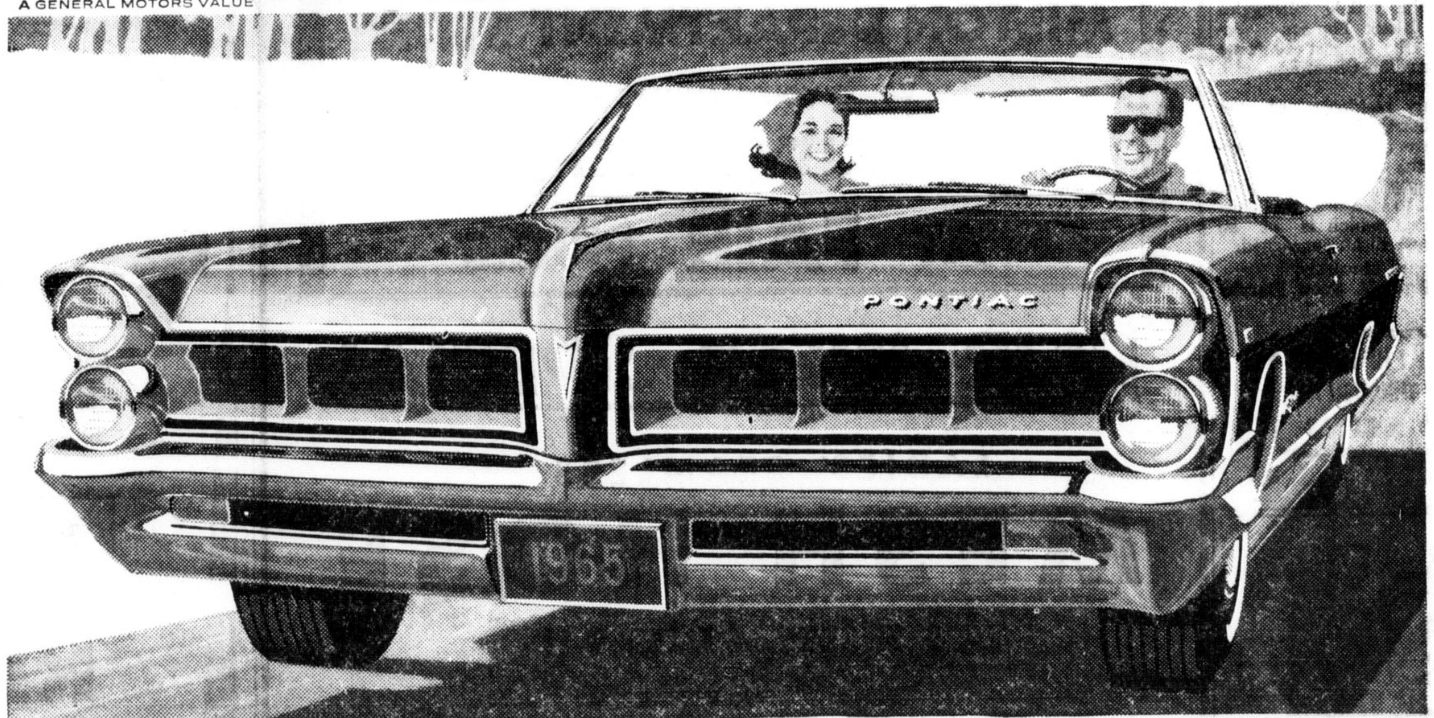
Parisienne Custom Sport Convertible

The 1965 Pontiac is new. Completely new. It's excitingly longer and wider. Dramatically sleek and low, with a breathtaking beauty that promises adventure in every racy line. Pontiac '65 has a perimeter frame. It's roomier and quieter than ever. There's a new wider track that gives Pontiac steady-as-a-rock stability; new, easy