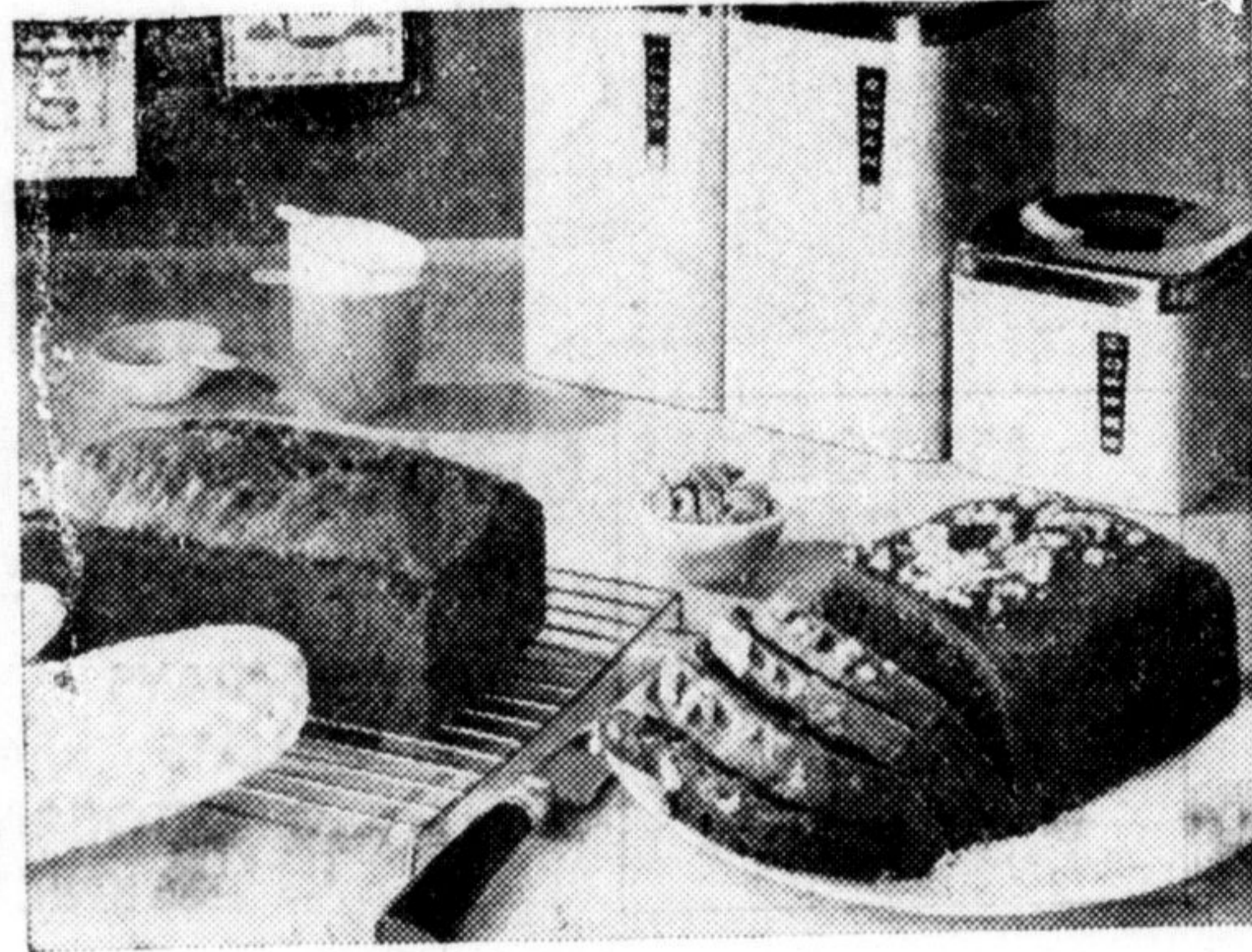
"PECAN CHOCOLATE LOAF CAKE"

Yield — One Loaf Cake 1-1/3 cups once sifted all-purpose flour OR 1 1/2 cups once sifted pastry flour 1 1/2 teaspoons baking powder 3/4 teaspoon baking soda 1/2 teaspoon salt 1/3 cup shortening 1-1/3 cups lightly packed brown sugar 1 egg 2 ounces unsweetened chocolate, melted 3/4 cup milk 1/2 teaspoon vanilla 1/2 cup coarsley-chopped pecans Grease a loaf pan (4 1/2 x 8 1/2 inches, top inside measure) and line with greased waxed paper