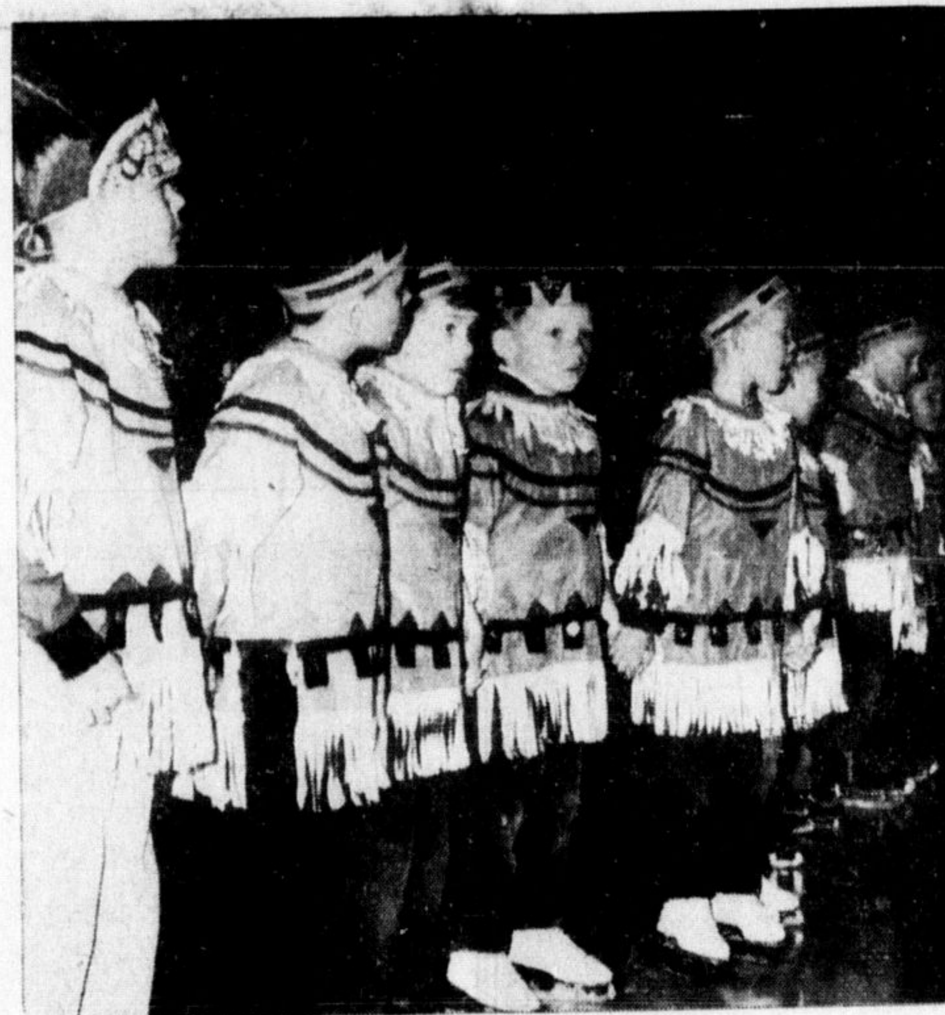
MEET THE CHILDREN of the old woman who lived in a shoe — you can see why she didn't know what to do! These boys performed in the opening "Babes in Toyland" act at Saturday's carnival.