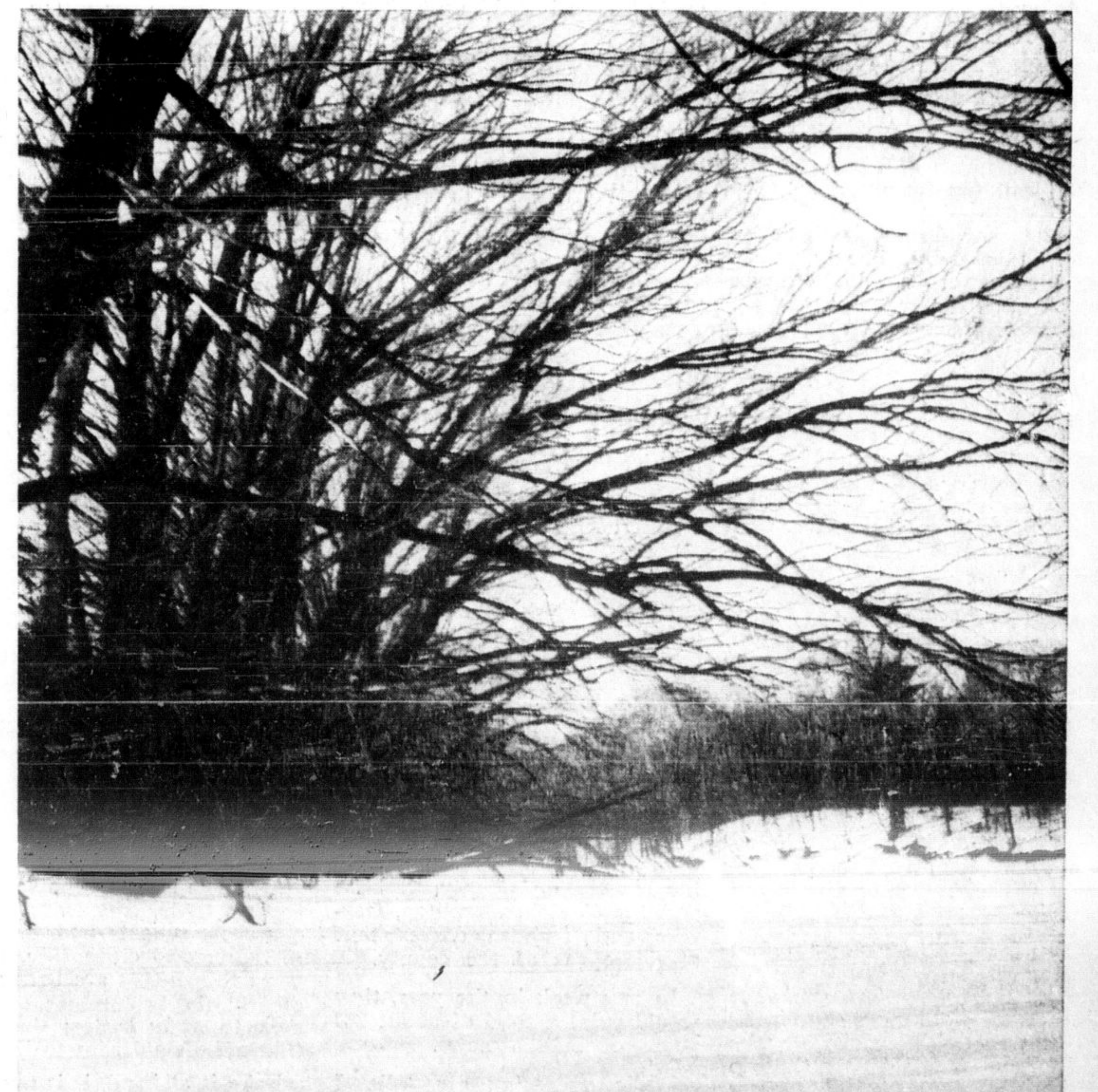
Trees along the pond bank cast long shadows on the snow