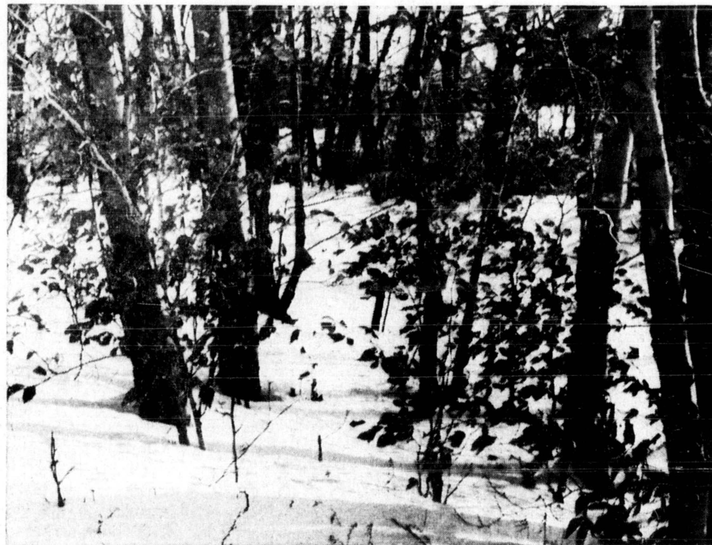
Leaves still flutter on some trees and cast shadows on the snow