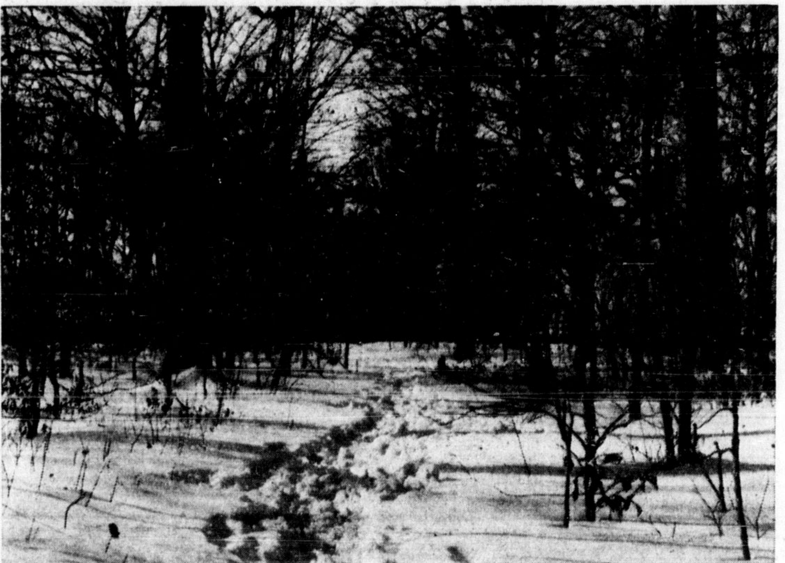
Human footprints cut a trail through the thick bush