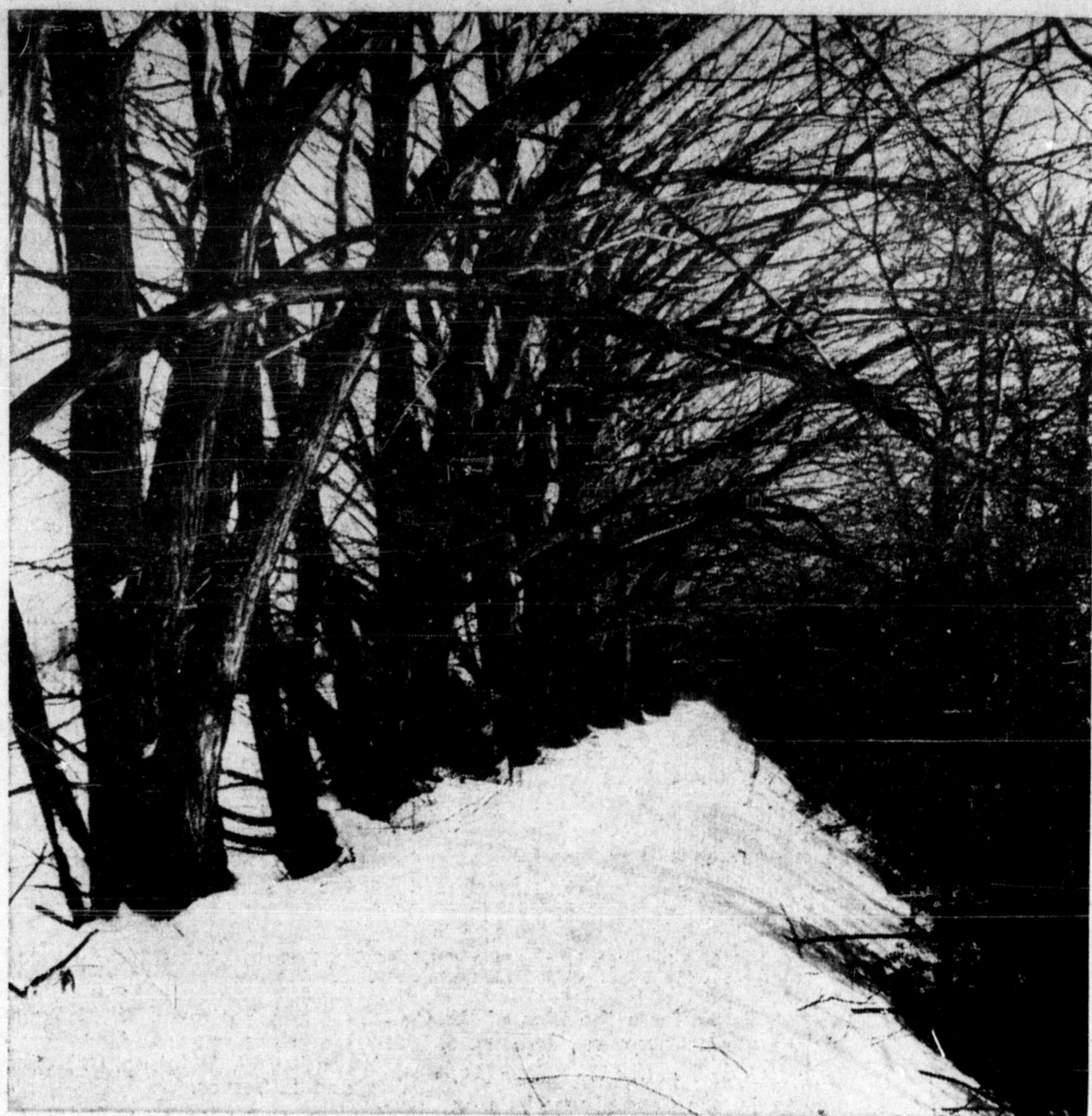
Looking up the pond bank between the pond and the creek

Not doing anything this weekend? Take a walk through the area, skirt the pond banks and walk through the bush, over the C.N.R. tracks, and upstream to the "Y" in the creek at the old dam and "whirlpool" cement structure. You're bound to enjoy it, and you'll be surprised at the hidden beauty right in our town's midst.