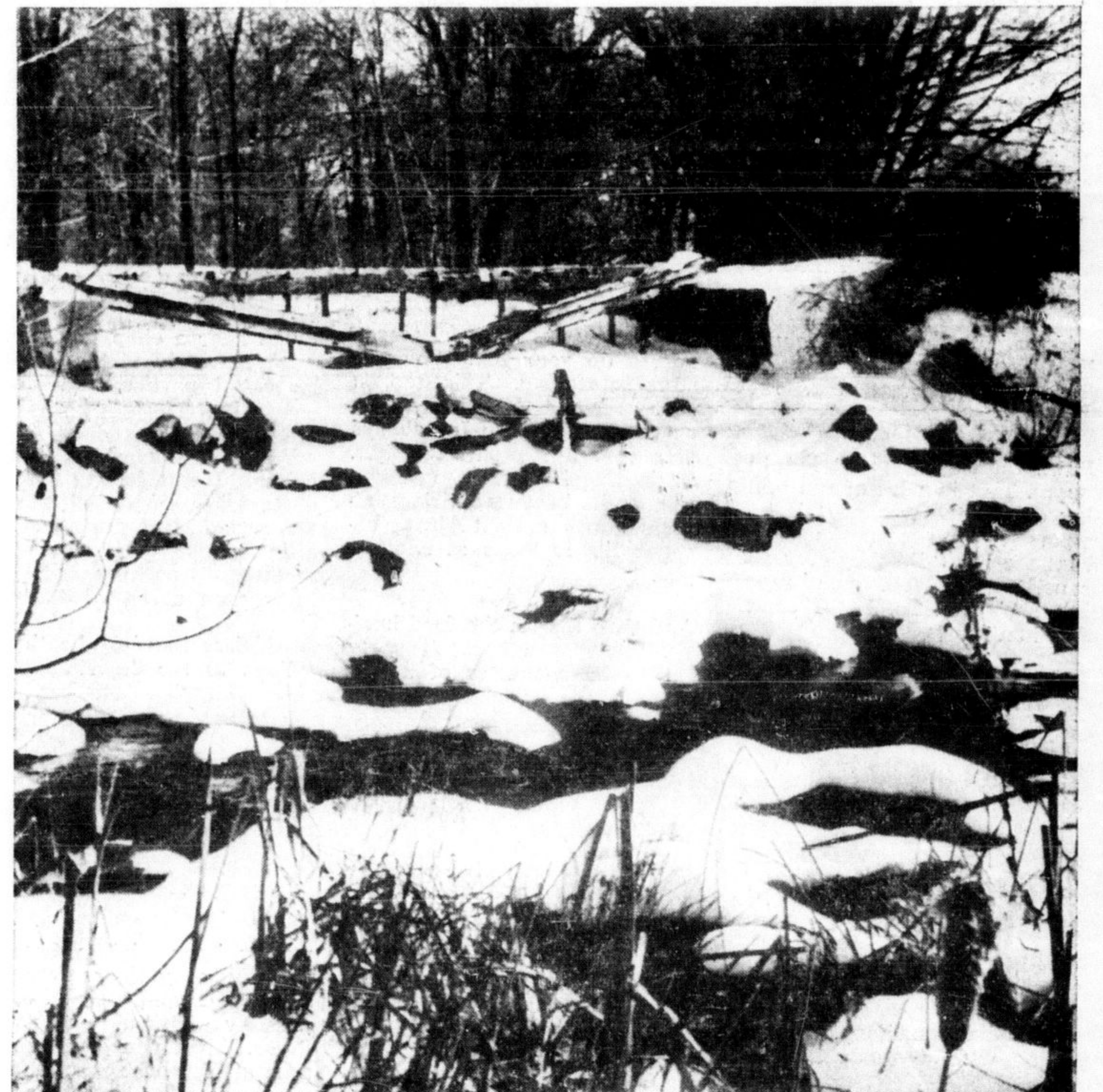
Scenic beauty is evident at the old dam upstream from pond