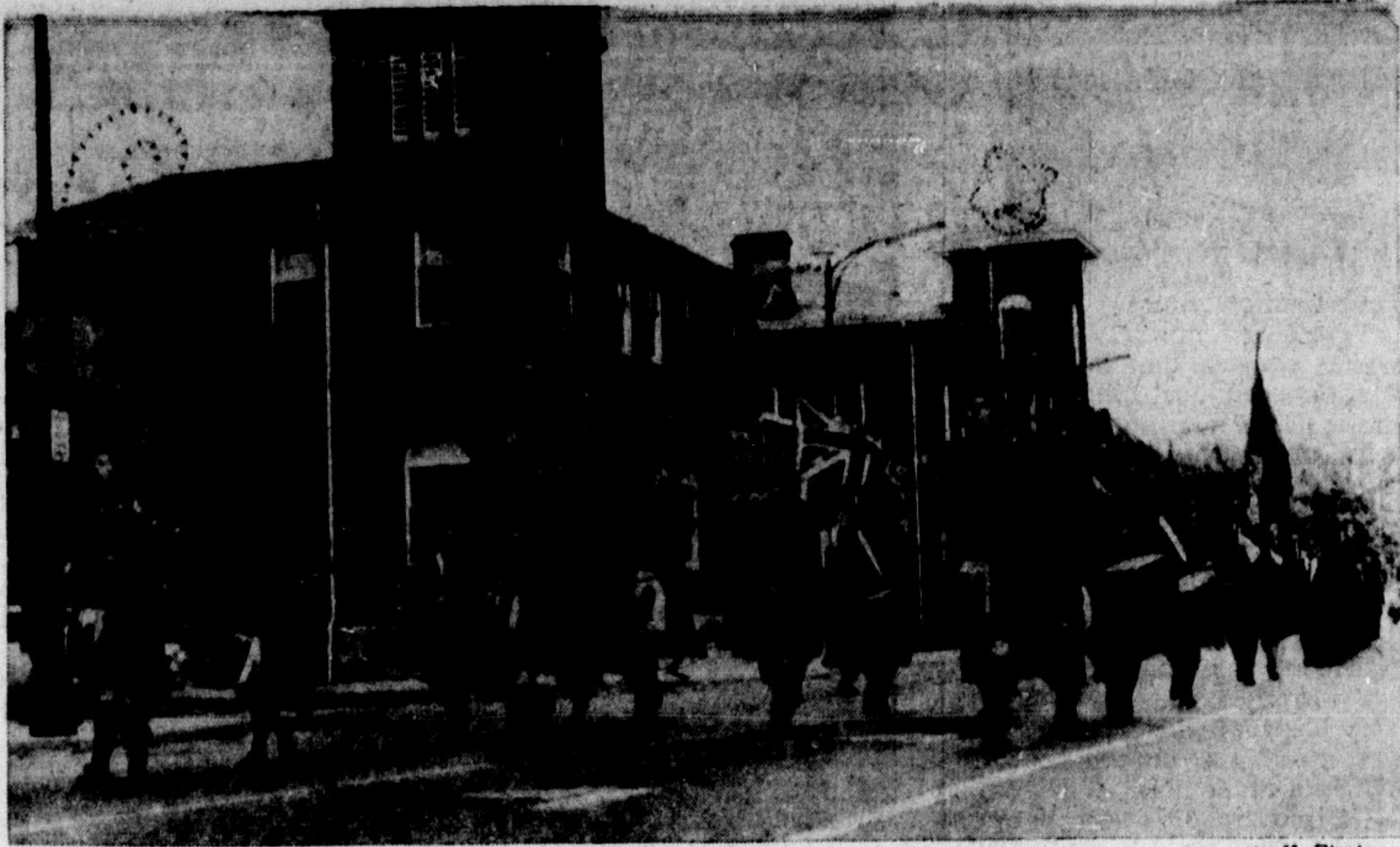
MILTON GIRLS' PIPE BAND led Legion, L.A. and Milton Fire Department marchers on Sunday afternoon, when they paraded to the Cenotaph in Victoria Park and to Evergreen Cemetery for the annual Decoration Day parade. A small crowd attended the two services.