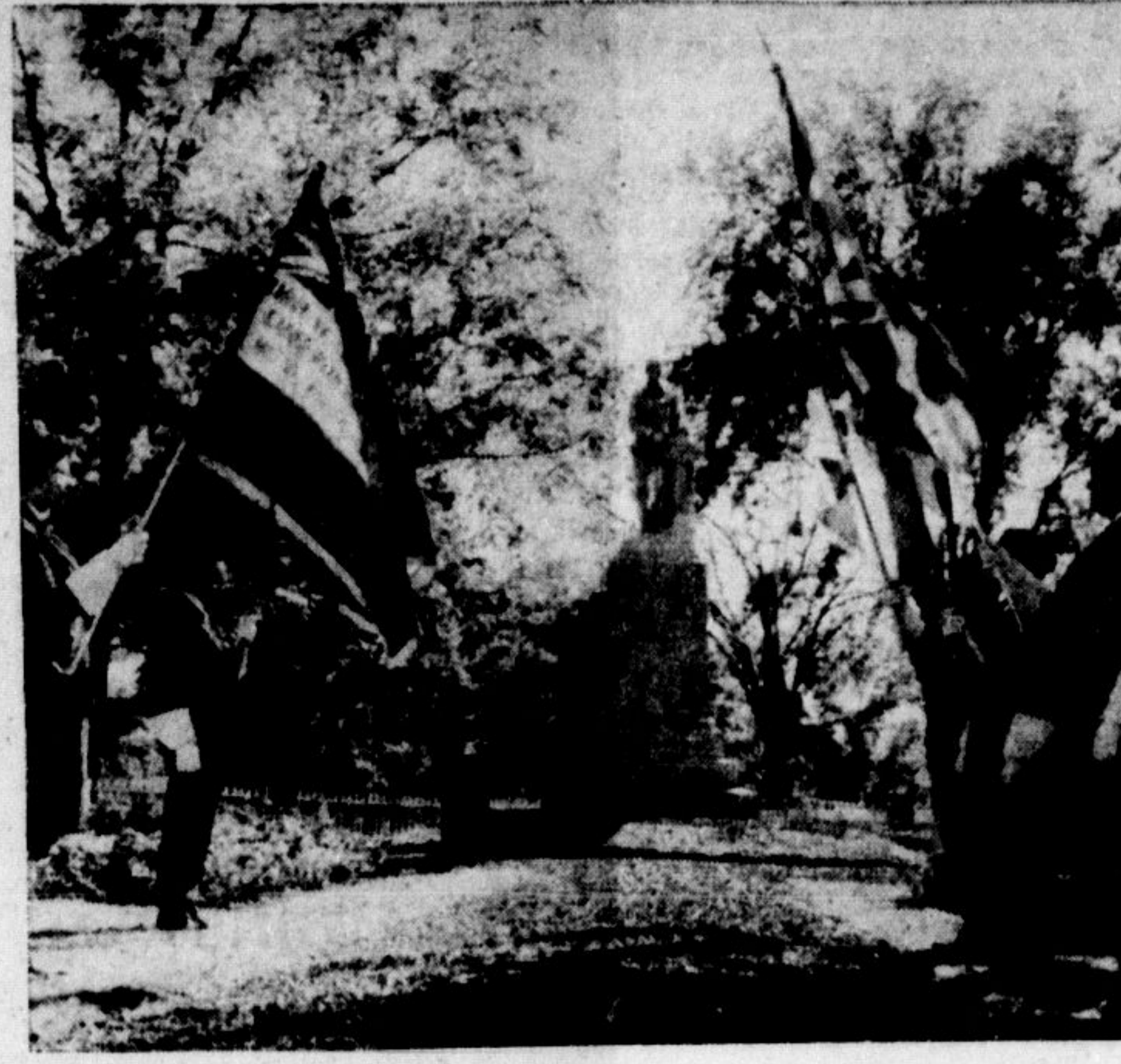
UNDER SUNNY SKIES Milton Legionnaires honored their comrades at Evergreen Cemetery. Shown is the dramatic moment as Last Post is sounded by the bugler.