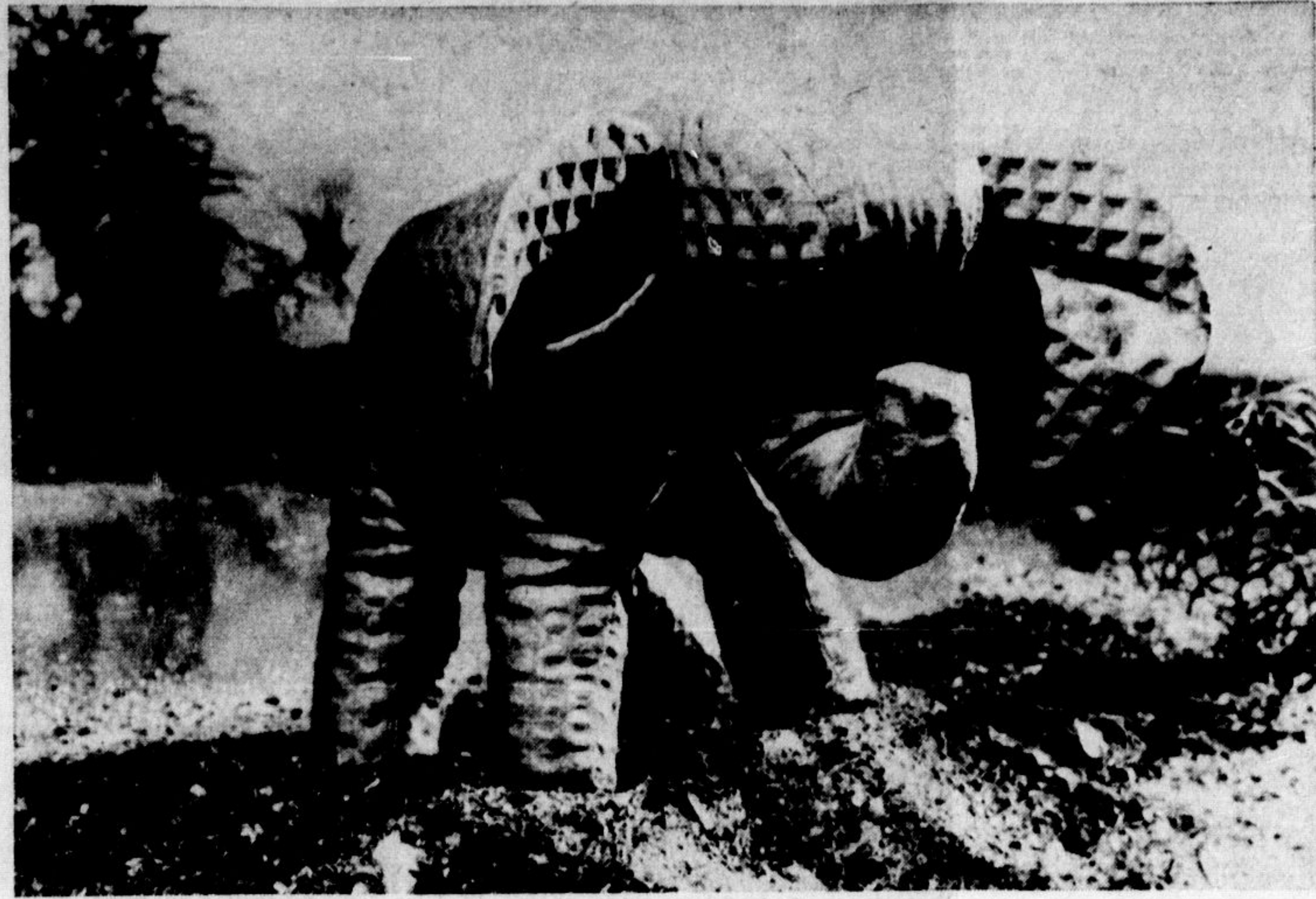
THIS TOY ELEPHANT will please daughters, sons, nephews or neices, which you can easily make in your spare time. Send 10 cents and a stamped, self-addressed envelope for Pattern S-5099, to The Canadian Champion, 191 Main St., Milton.