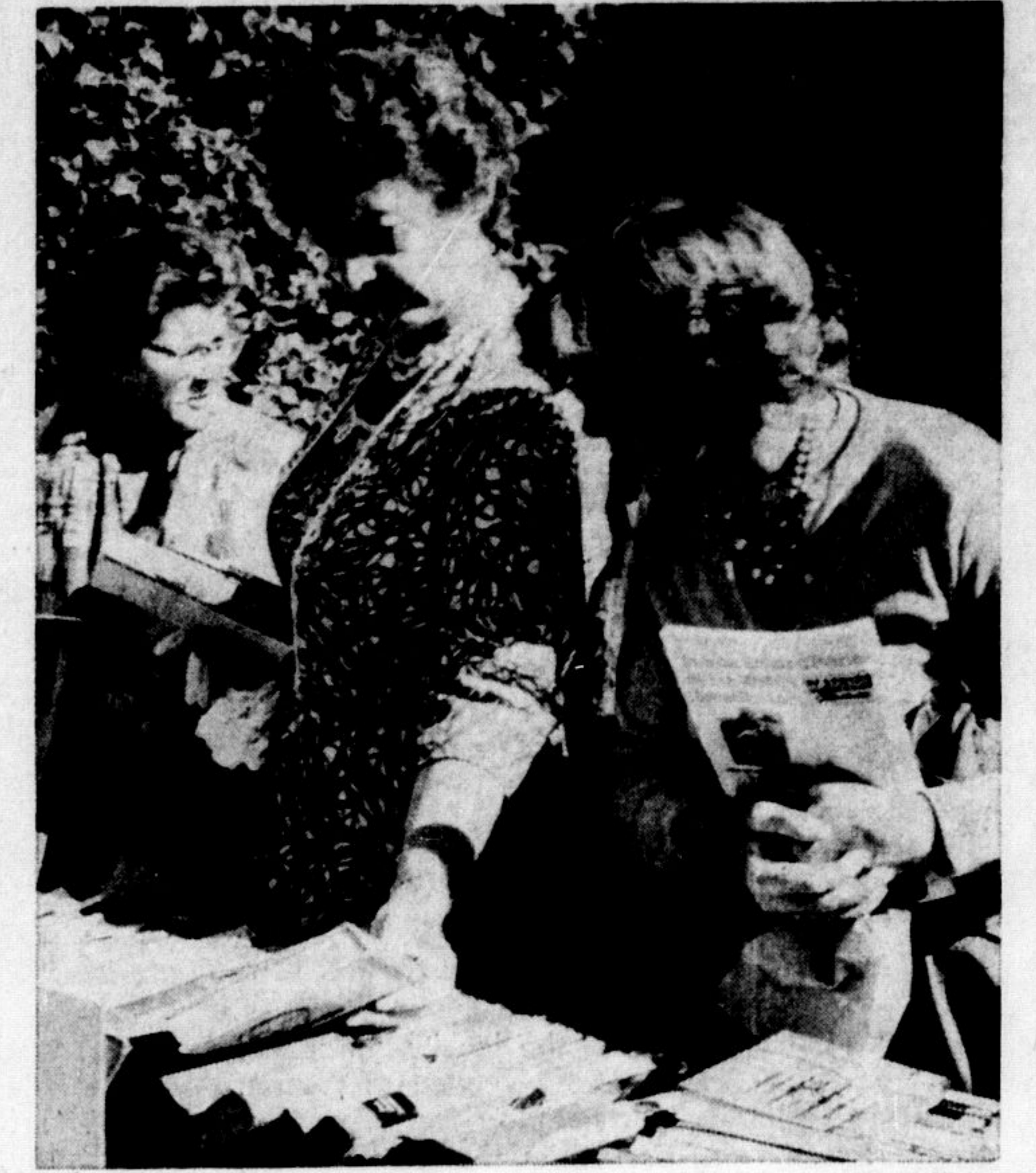
BOOKS FROM THE WORKS of James Baldwin to those of Hans Christian Anderson, were on sale at the book stall, one of the busiest spots throughout the afternoon.