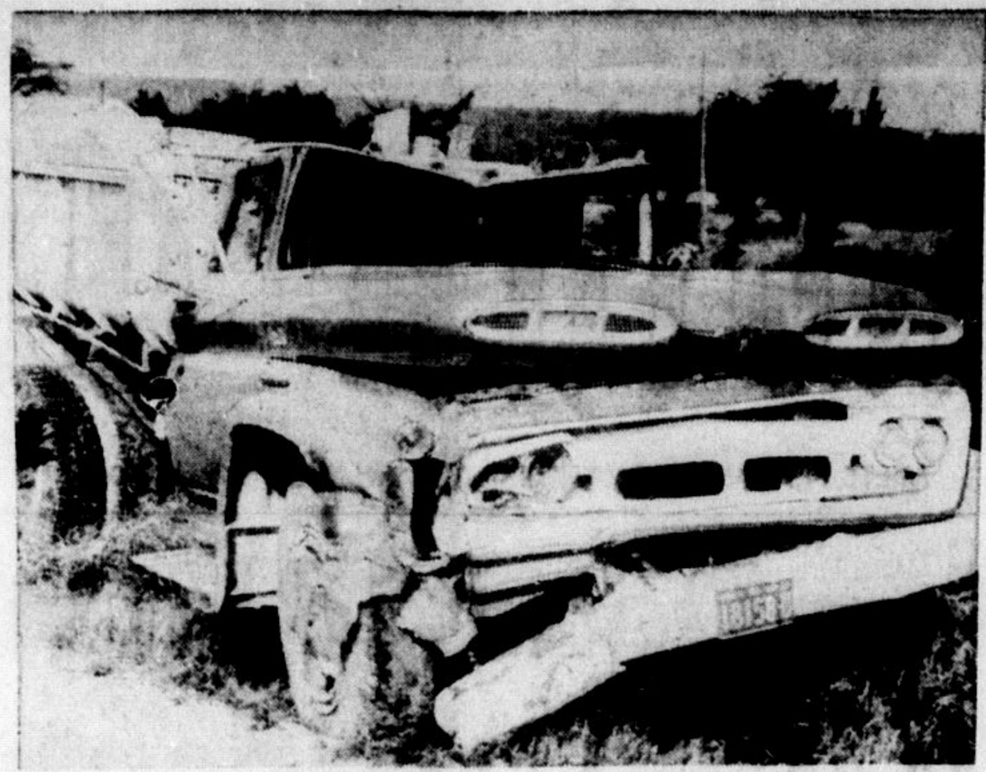
THIS TRUCK RECEIVED $1,500 damage and a Grimsby man's car was a total wreck Wednesday morning, when they collided on Five Sideroad at the Esquesing-Nassagaweya Town Line north of Milton Heights. The truck rolled over onto its roof after colliding with the car, which was pulling onto the sideroad as the truck came around a curve. Several tons of stone were spread through the ditch and a nearby field as the truck tipped over.