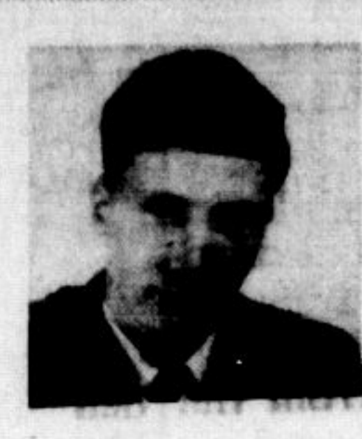
By BRIAN MCCRISTALL