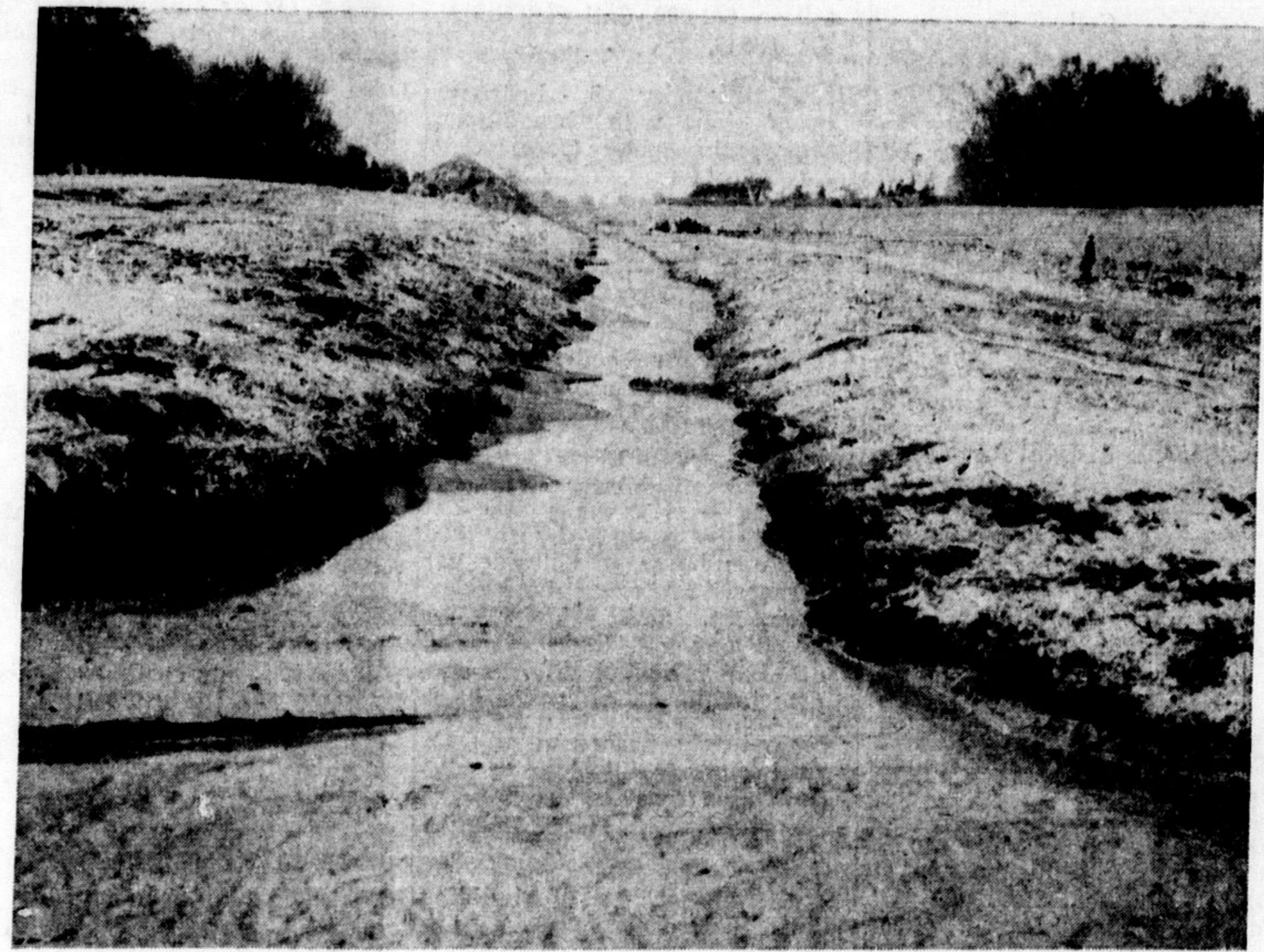
A QUAGMIRE OF QUICKSAND faced Canadian National Railways workmen when they attempted to reconstruct the C.N.R. line through Esqueving Township. A 9,000 foot long water table near the Third Line and 10 Sideroad held up the construction for a year, but a draining program has begun and they hope to complete the new track this summer. Above, the mud and water are shown just north of the sideroad.

half-way between the Third and Fourth Lines and continues south to just below 10 Sideroad, he said. The delay has held up the construction end of the entire Milton-Georgetown section of the line. Tracks have been laid from the Georgetown station South-erly to just above the start of the water table.