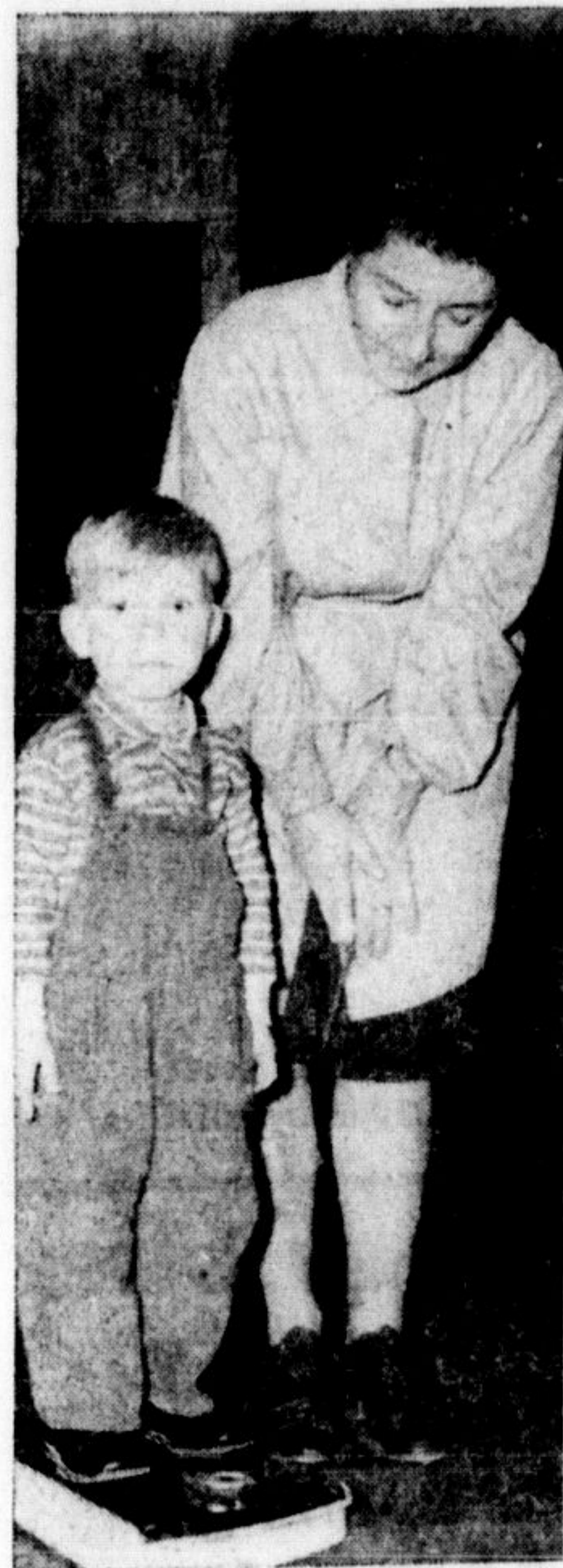
CHILDREN ARE WEIGHED each time they make a visit to the Health Centre, and the weight is filed. Each year many mothers are able to bring their children to the Centre for free medical check-ups.

Are You Helping to Find the Solution or . . . are You Part of the Problem? BEAUTIFY MILTON