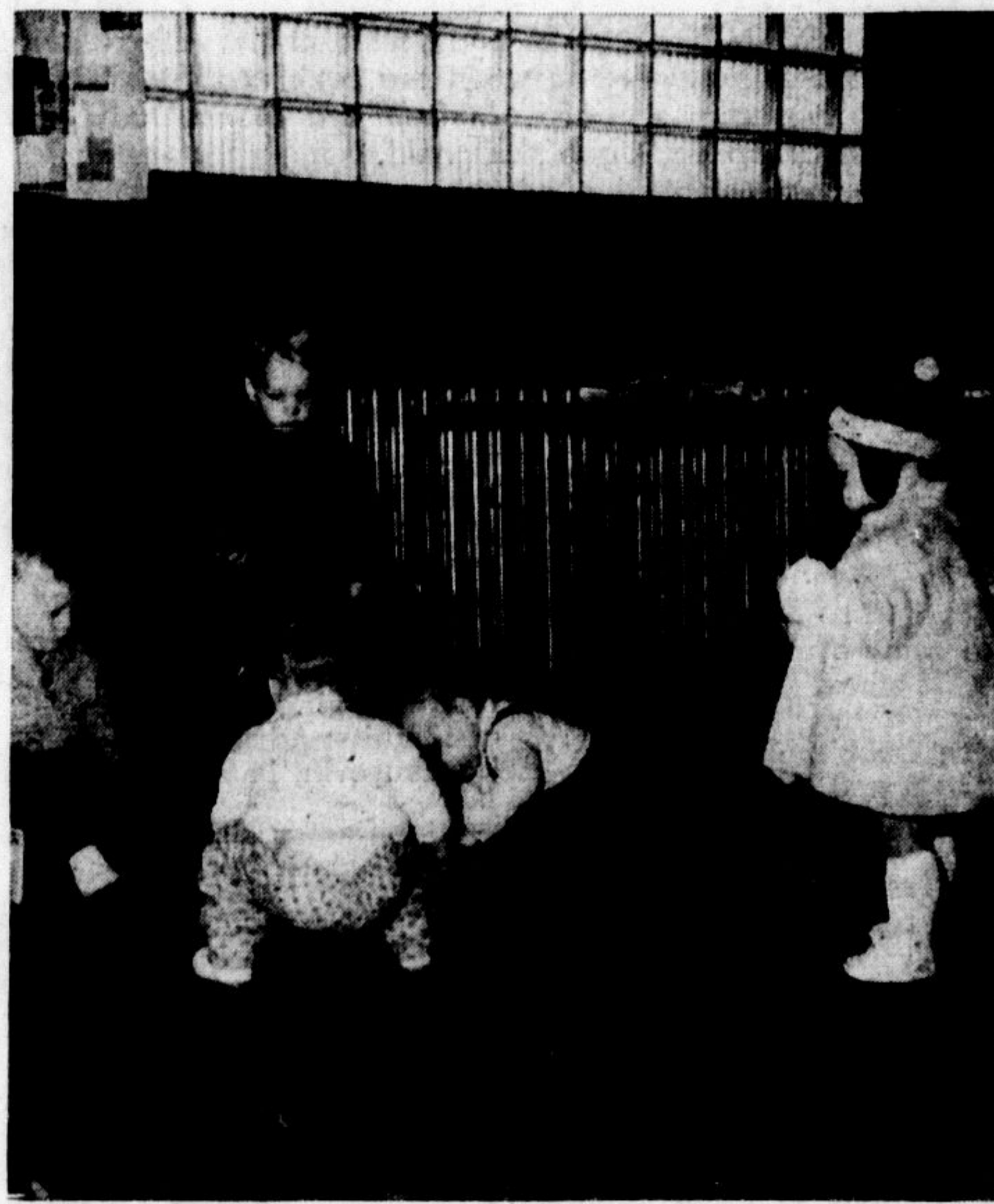
CHILDREN ARE ABLE TO PLAY as they await their examination. The monthly Health Centre has been held in the Legion Hall since 1958. Previously it was held in the Sunday school room of St. Paul's United Church and in the Halton County Health Unit on Hugh St.