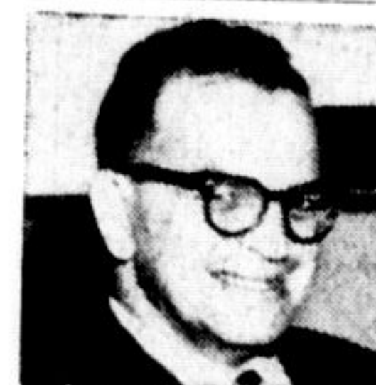
New Democratic Party Candidate

Drug legislation will be strengthened to protect the public. To meet urgent needs, the Liberal Government will pay unemployment benefits to people who are unable to work because of sickness. The objective is a comprehensive plan of income maintenance during illness.