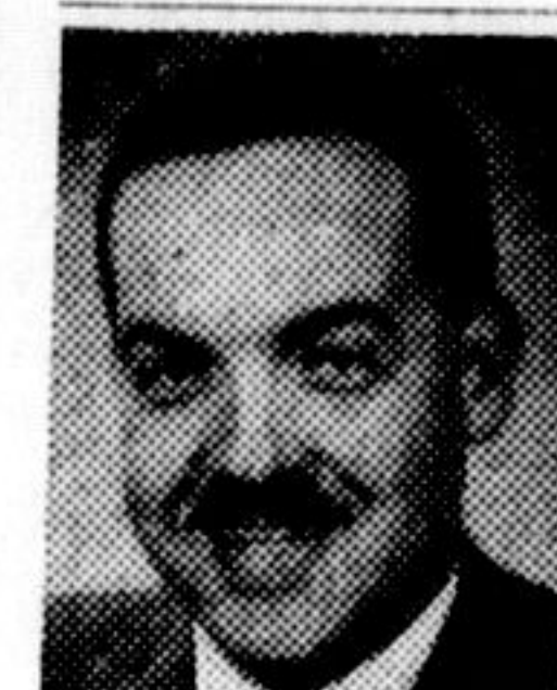
Halton Conservative Candidate

The following space has been donated by The Champion to the three Federal election candidates in Halton County, so they may present their views to the voters. We hope readers will find their weekly columns informative and thought-provoking. If you care to comment on their articles, letters to the editor would be welcomed.