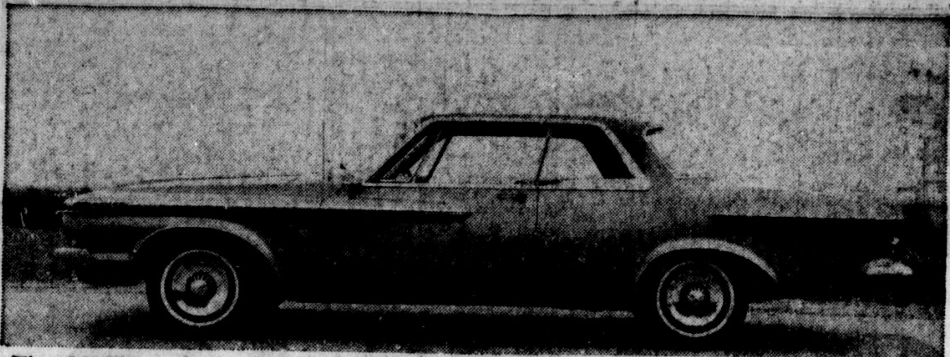
The 1962 Plymouth passenger cars from Chrysler of Canada feature a clean, crisp design that is new from the attractive grille treatment to the sweptline rear deck. The design of this series of Plymouths also is enhanced by a reduction in the wheelbase to 116 inches, although there is no appreciable reduction in passenger space. Pictured is the Plymouth Fury two-door hardtop.