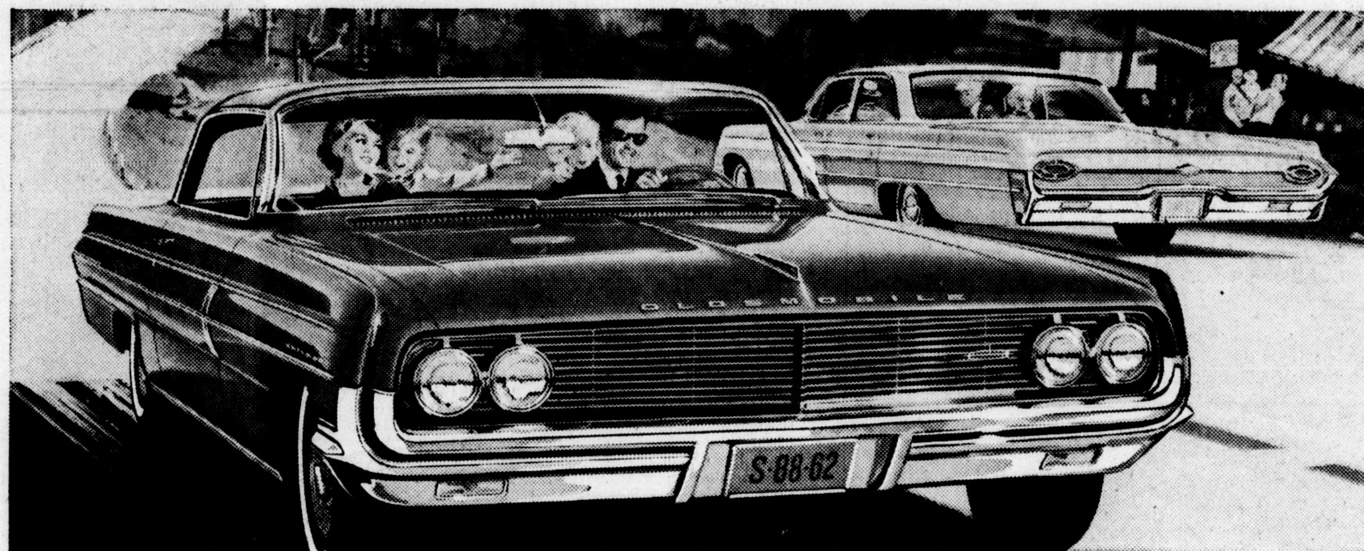
A General Motors Value

And you tingle with the knowledge that this is Oldsmobile in its finest form—bringing you the ultimate pleasures of motoring. From the first exciting moment that you park it in the driveway, you're aware that there's "something extra" about owning an Oldsmobile for '62... perfection styled in the magnificence that only Olds could attempt—only Olds could achieve!