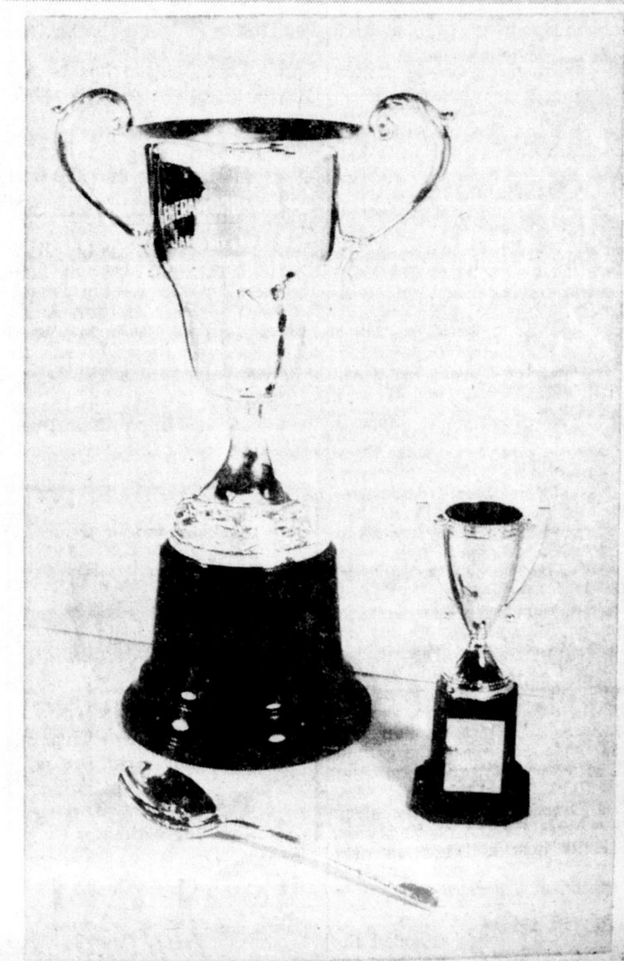
DISTRICT HOMEMAKERS are invited to participate in the jams jellies and marmalades section of this year's Milton Fair, for the winner of the Canadian Champion-General Foods special class will receive the large trophy and a small replica plus $10. Second prize winner receives the silver jam spoon and $7.50 while third and fourth prizes of $5 and $2.50 will also be offered.