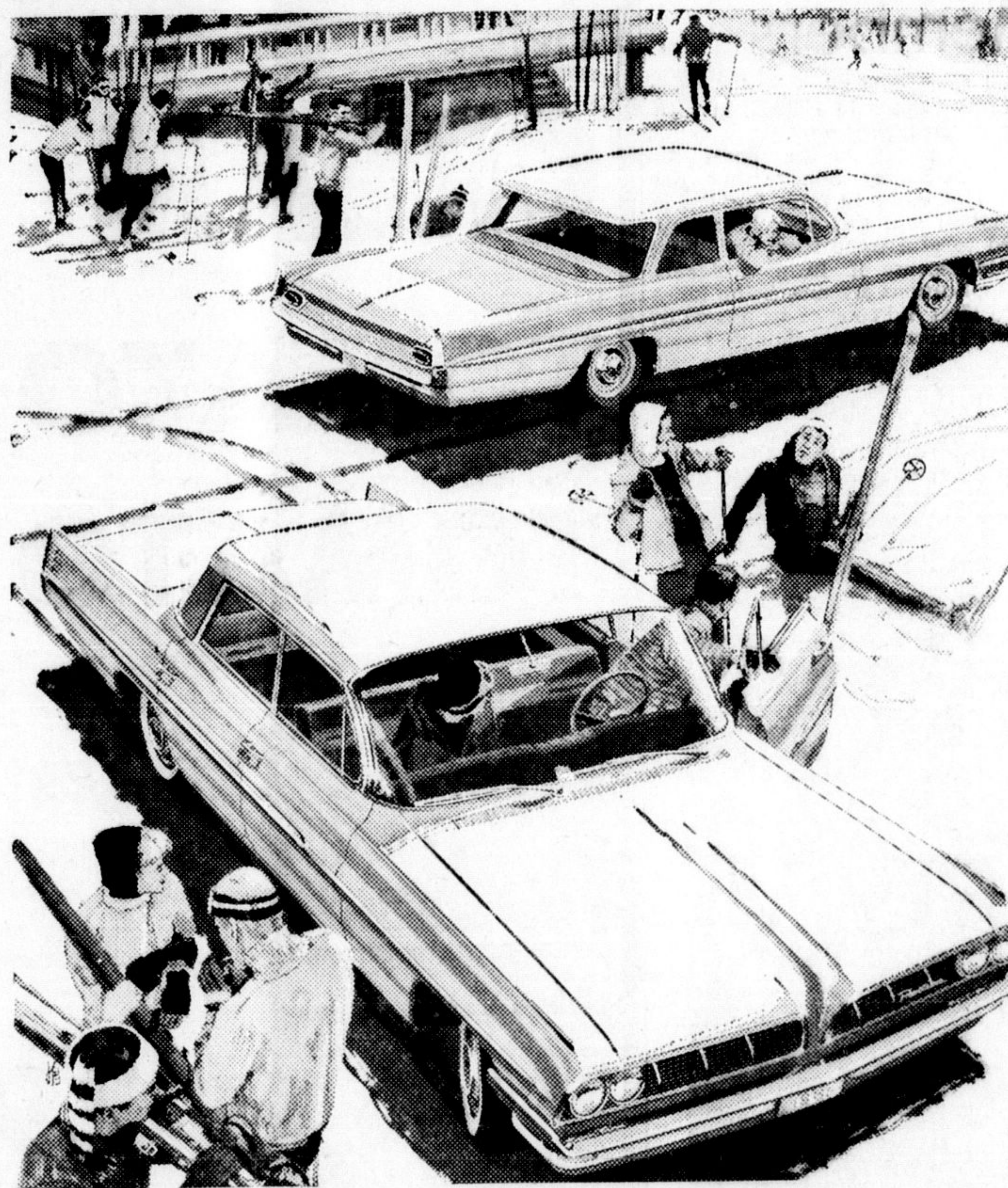
ABOVE: Strato-Chief 2-Door Sedan BELOW: Laurentian 4-Door Sport Sedan