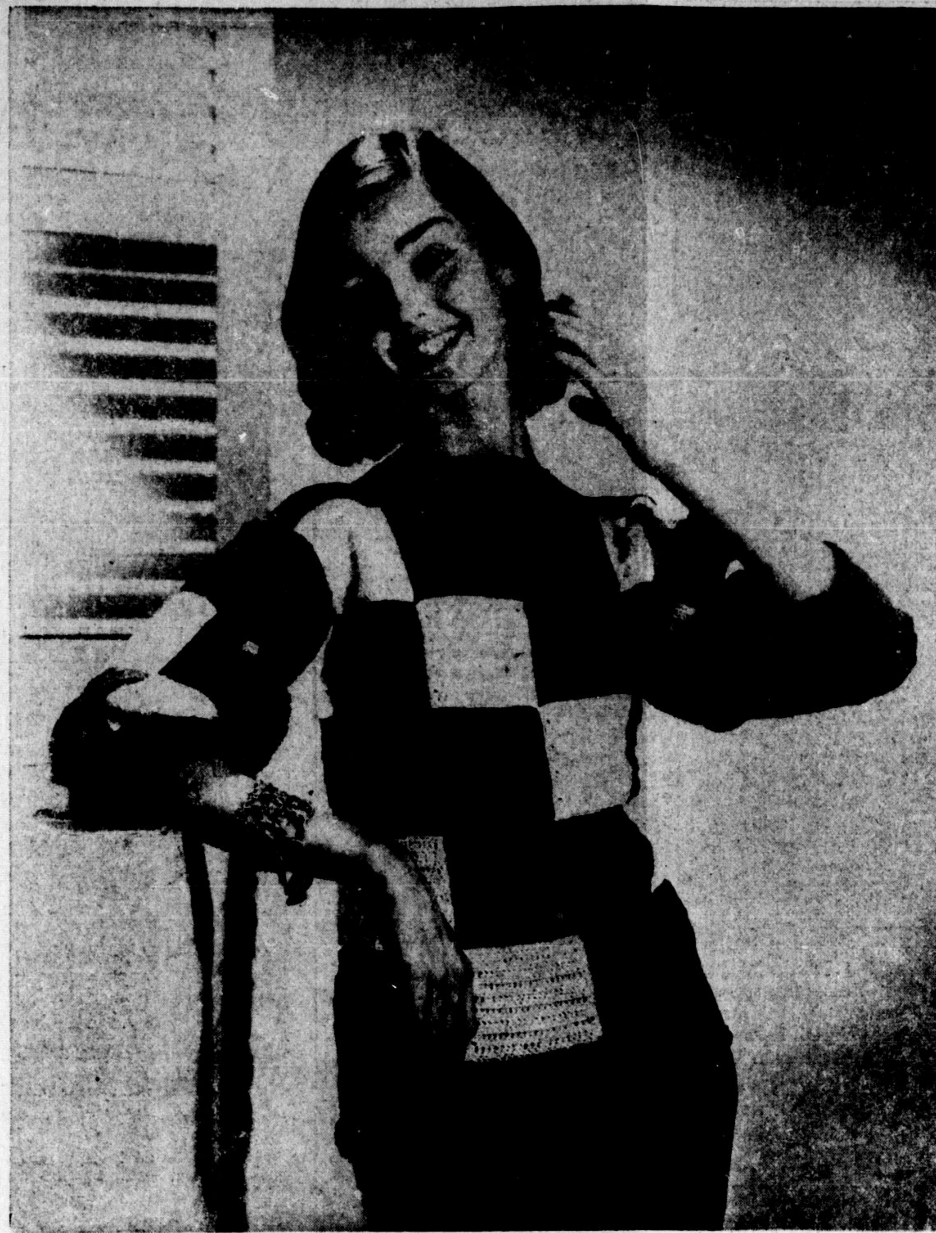
CHECKERBOARD SHIRT —A study in leisure time—this checkerboard shirt is the busy girl's portable project. Each square, made individually, is the perfect purse companion for in-between-times. When the blocks are joined, this shirt fits sizes small, medium and large. If you would like directions for making it, simply send a stamped, self-addressed envelope to the Needlecraft Department of this paper and ask for Checkerboard Shirt, Leaflet No. CPC 9713.