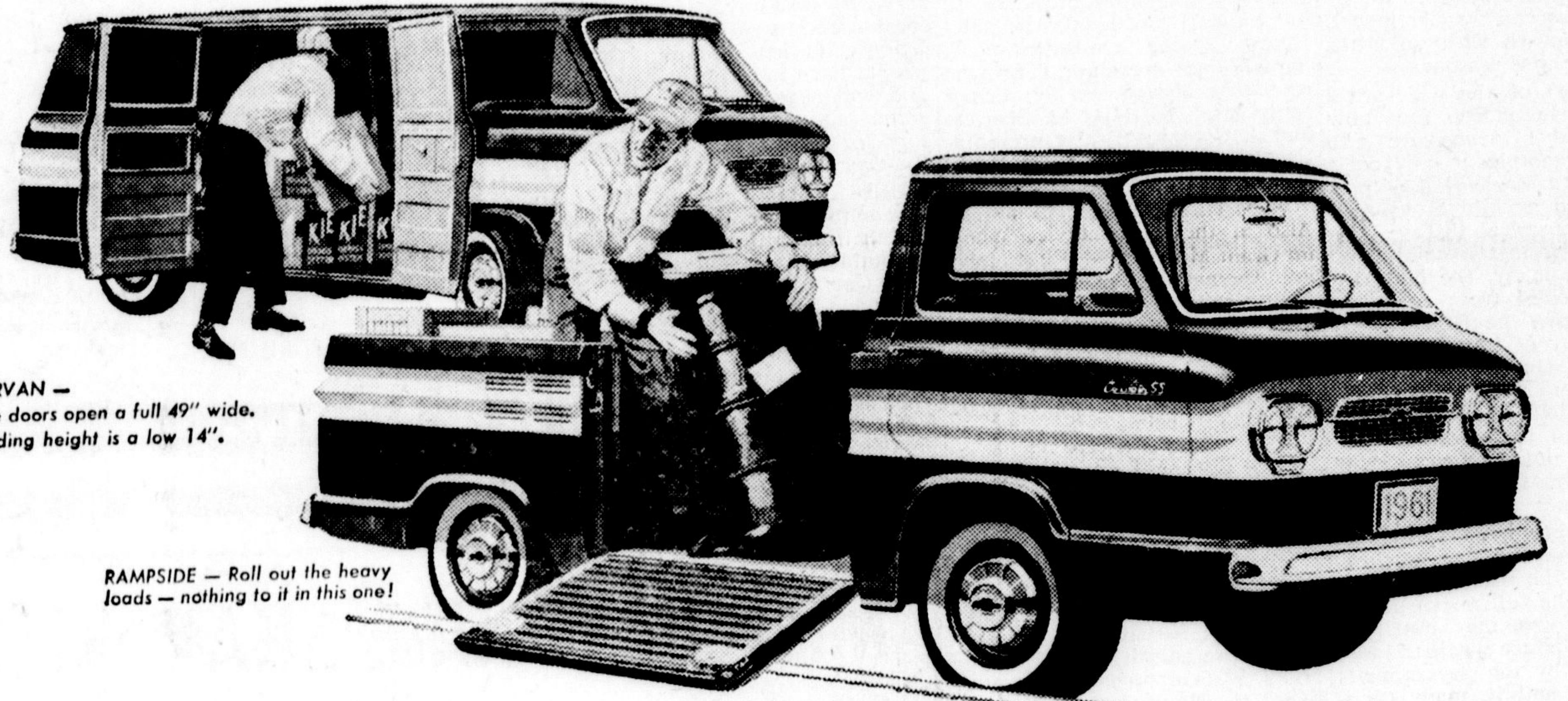
CORVAIR — Side doors open a full 49" wide. Loading height is a low 14".