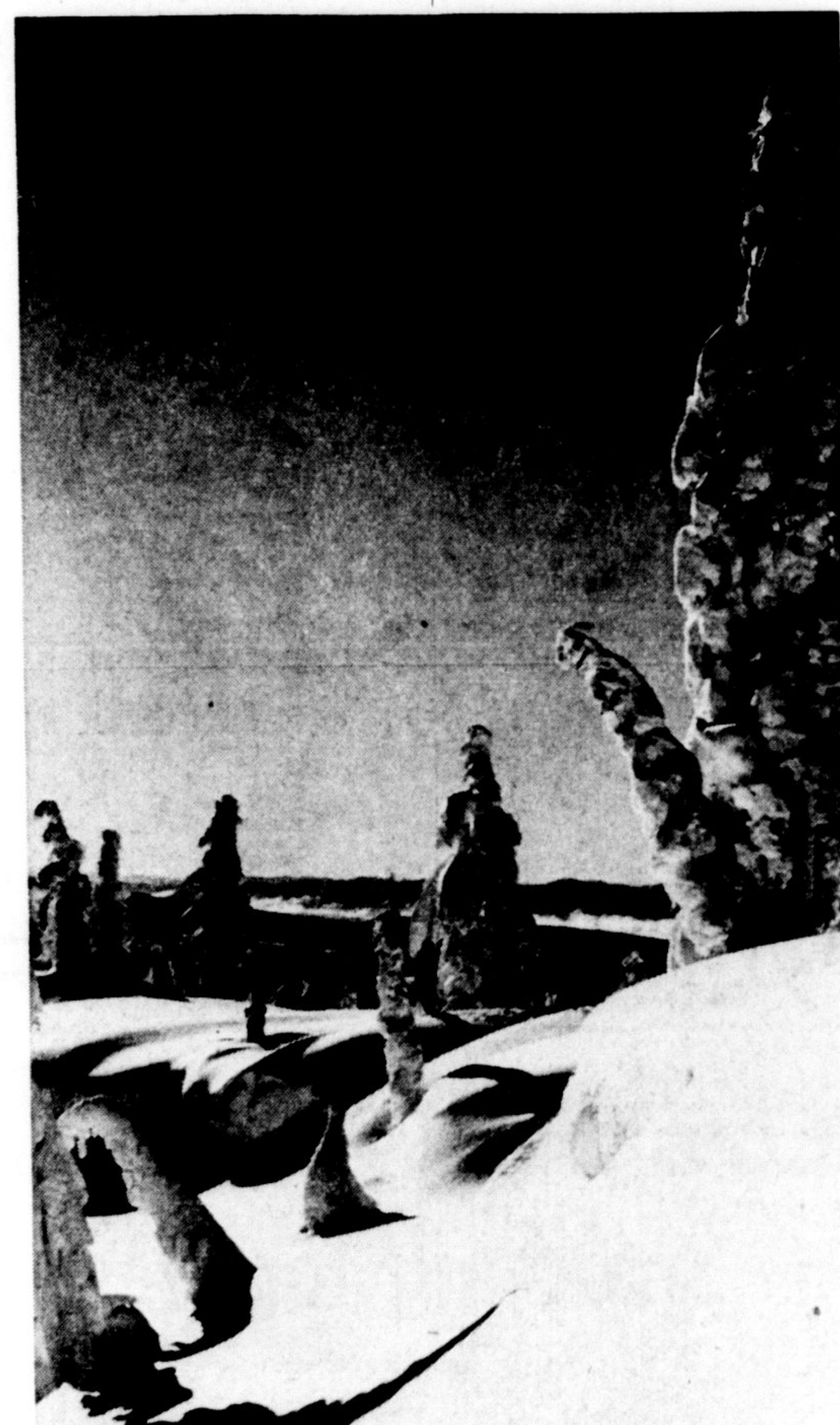
A SIMPLE CAMERA can make great pictures — if you use it properly. This picture could be snapped with any camera.

To 35 Junior Rangers from last summer's three Junior Ranger camps in the Sault, Ste. Marie district have been sent intimated tie clips as prizes for being members of camps which had no lost time injuries during the season. It is not the first time a tie has been recorded in the Junior Ranger Safety Contest—but, in this instance, it was a three-way tie for first place. Considering that most of the boys, from all parts of the province, had had no previous acquaintance with bush work and its dangers, Lands and Forests Department officials were understandably pleased with the record.