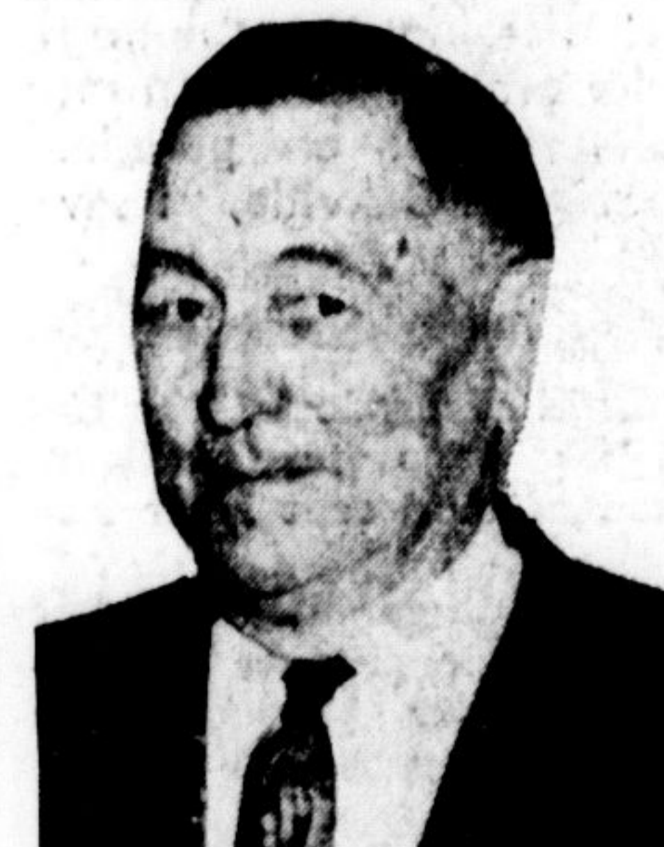
STANLEY HALL FOR HALTON

The dynamic achievements of the Government of Premier Leslie Frost have benefited all of our citizens. Ontario's standard of living has never been higher.