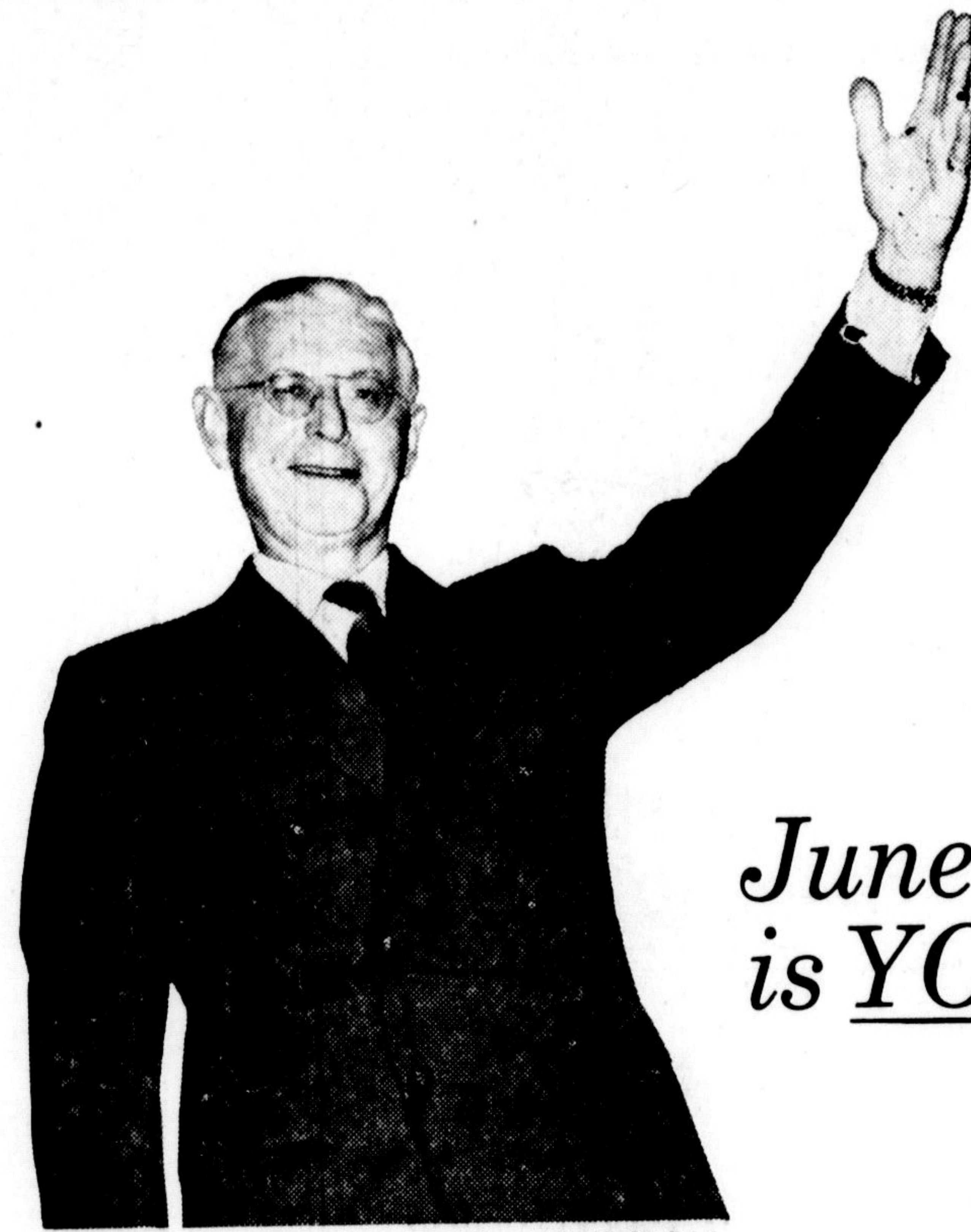
Premier Leslie M. Frost