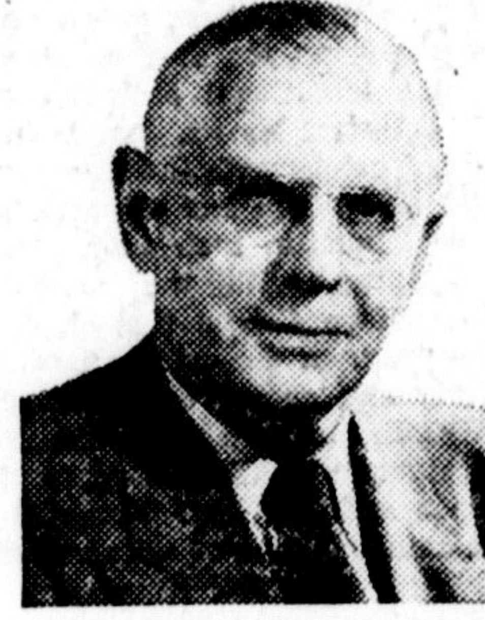
PREMIER FROST FOR ONTARIO