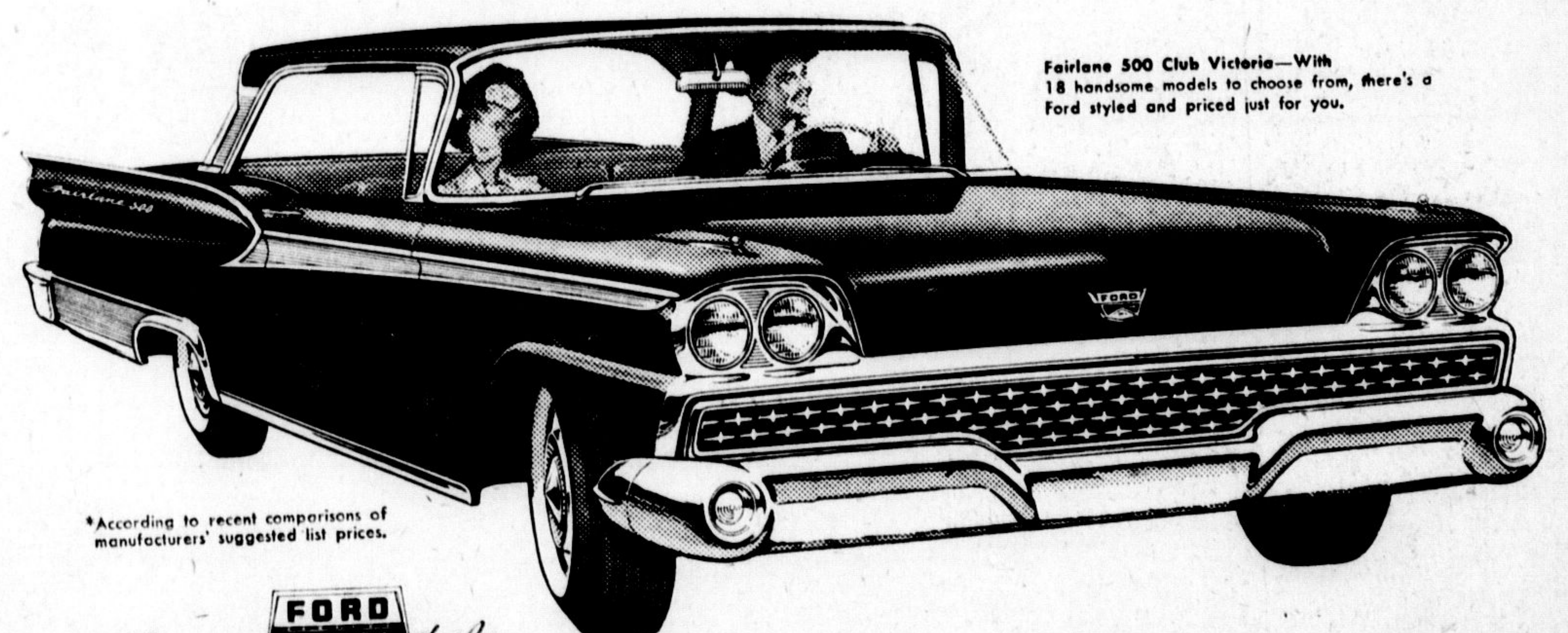
Fairlane 500 Club Victoria—With 18 handsome models to choose from, there's a Ford styled and priced just for you.

*According to recent comparisons of manufacturers' suggested list prices.