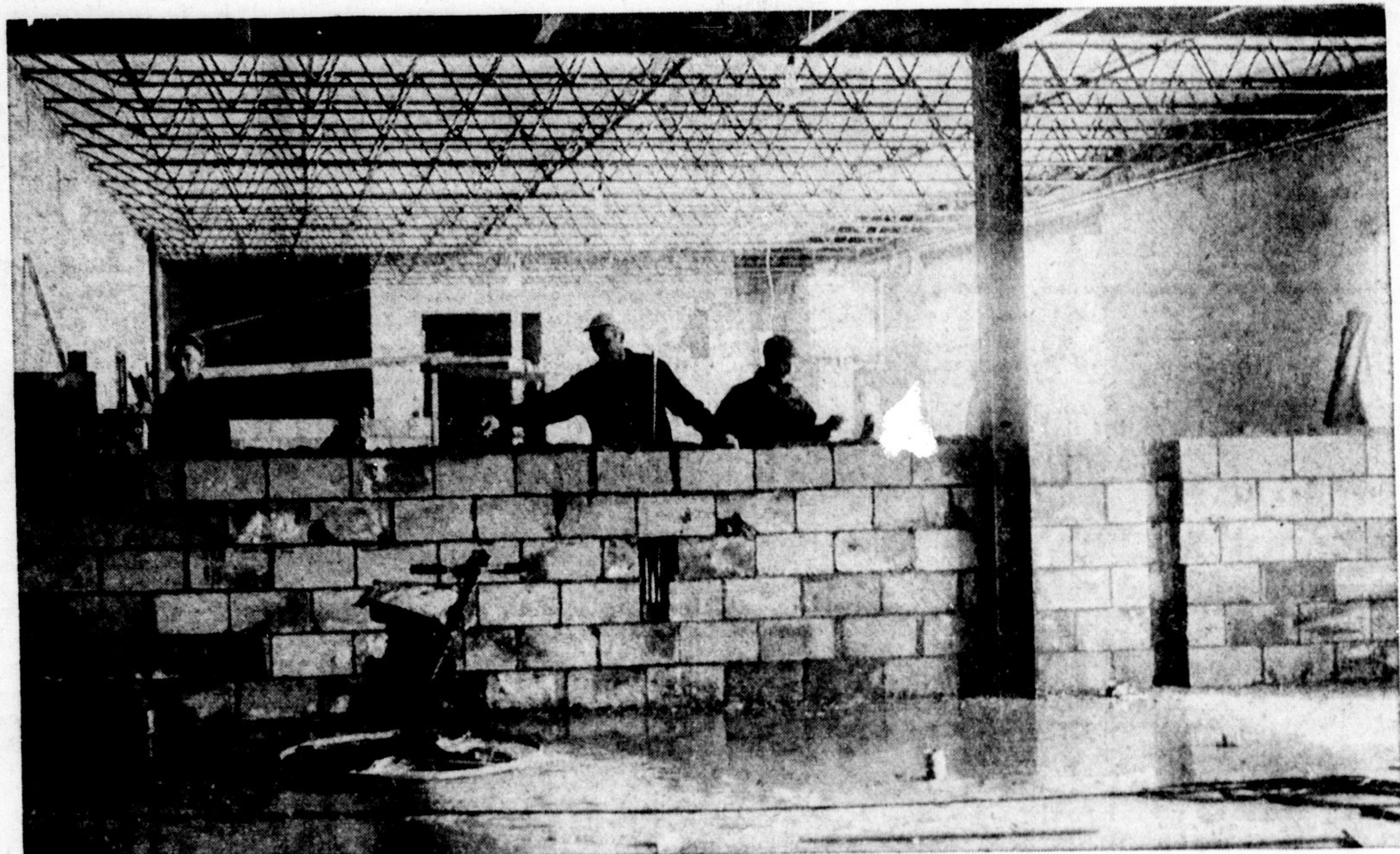
An interior wall in the east wing of Milton's new district hospital takes on shape as workmen lay the concrete blocks. There are 46,000 cement blocks going into the construction.