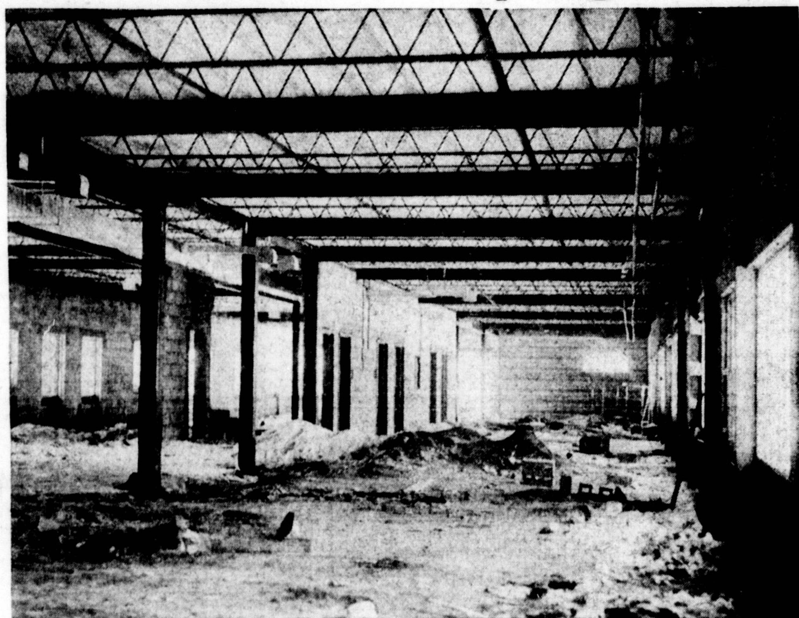
This is an interior view of the shell of the west wing of your new hospital. Interior walls and corridors will come later. This wing includes pediatric, surgical, medical and isolation rooms.

Take 135,000 bricks, 46,000 cement blocks, about 800 yards of concrete, 172 doors and 84 windows, throw in some 60 men, sheafs of architect's plans, hundreds of hours of preliminary groundwork by volunteers, divide evenly over nine months of construction (part of it winter) and you'll end up with a building valued at $543,652—the new Milton District Hospital.