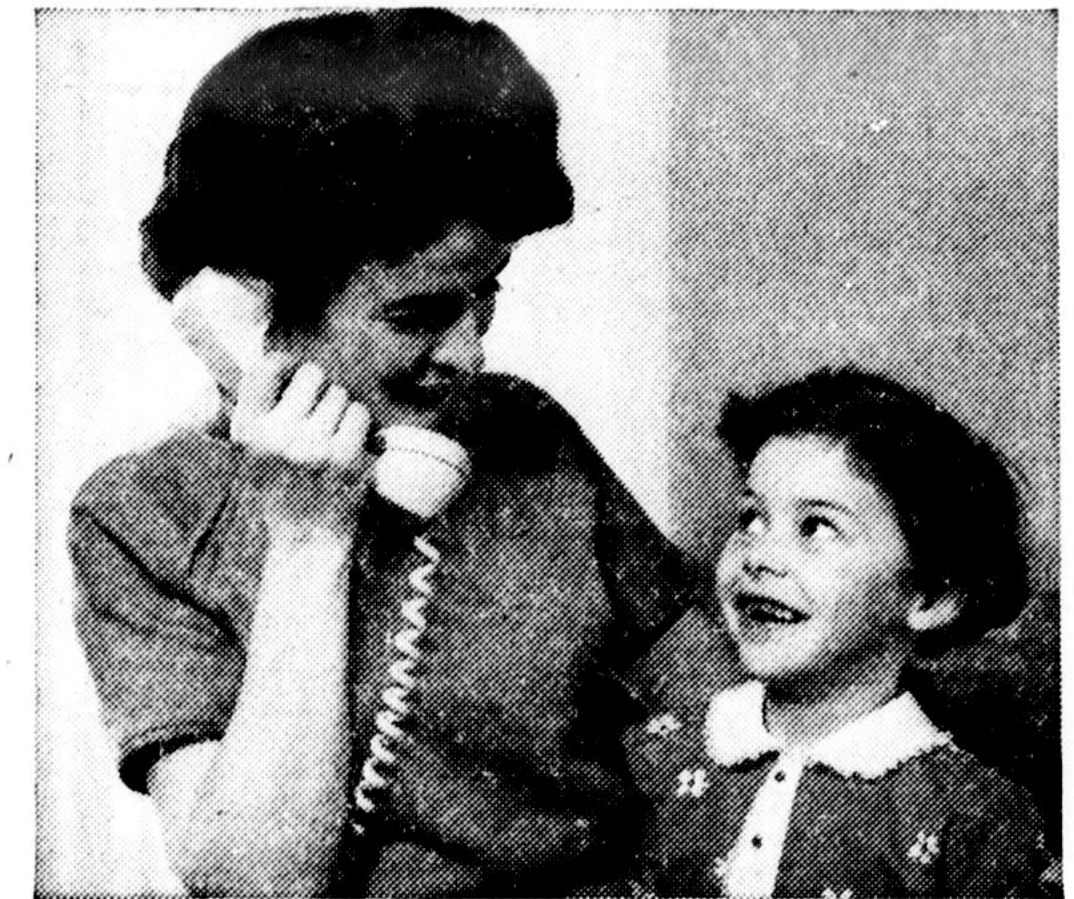
"Yes, Doctor...Wednesday will be fine!"