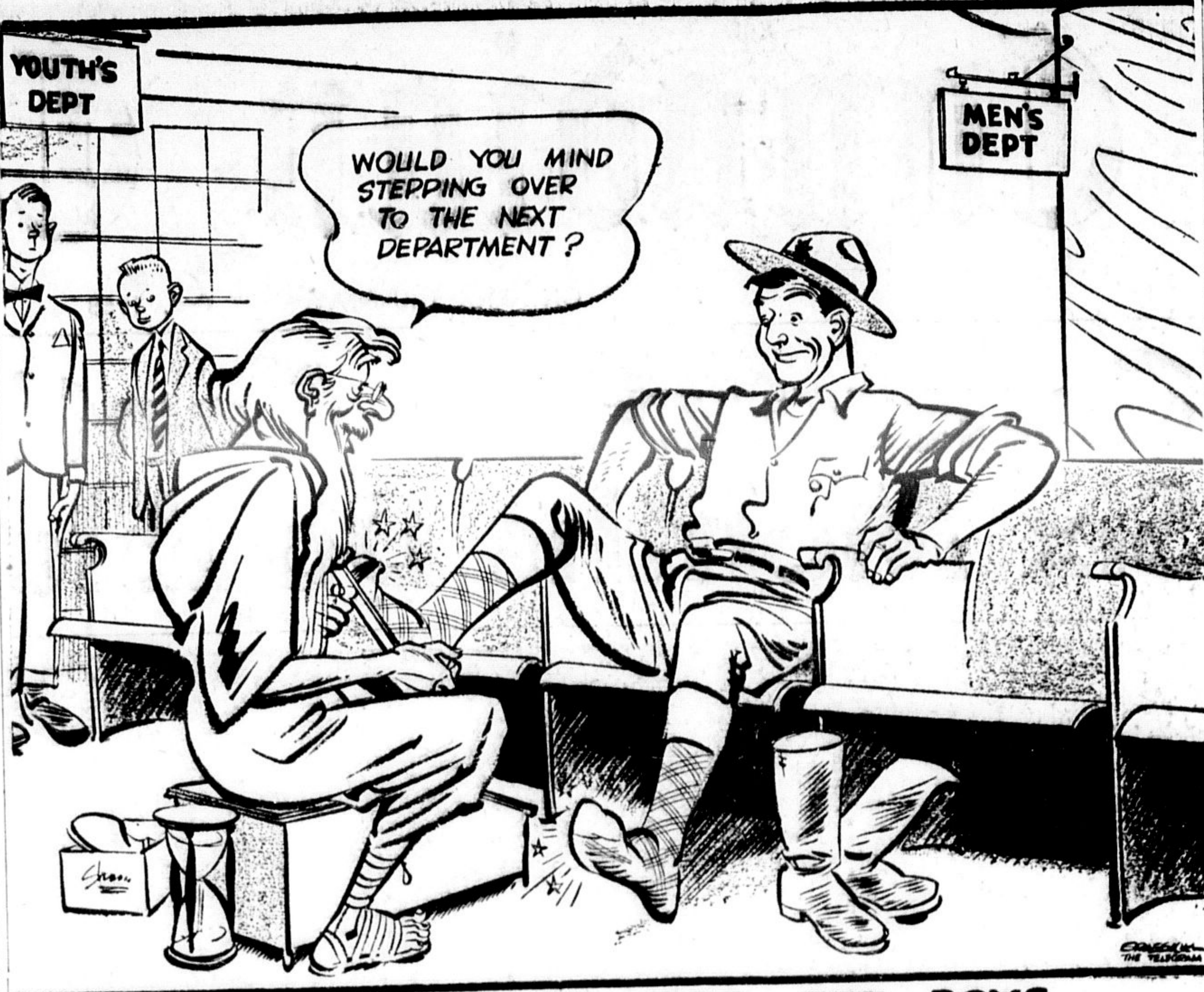
SEPARATING THE MEN FROM THE BOYS