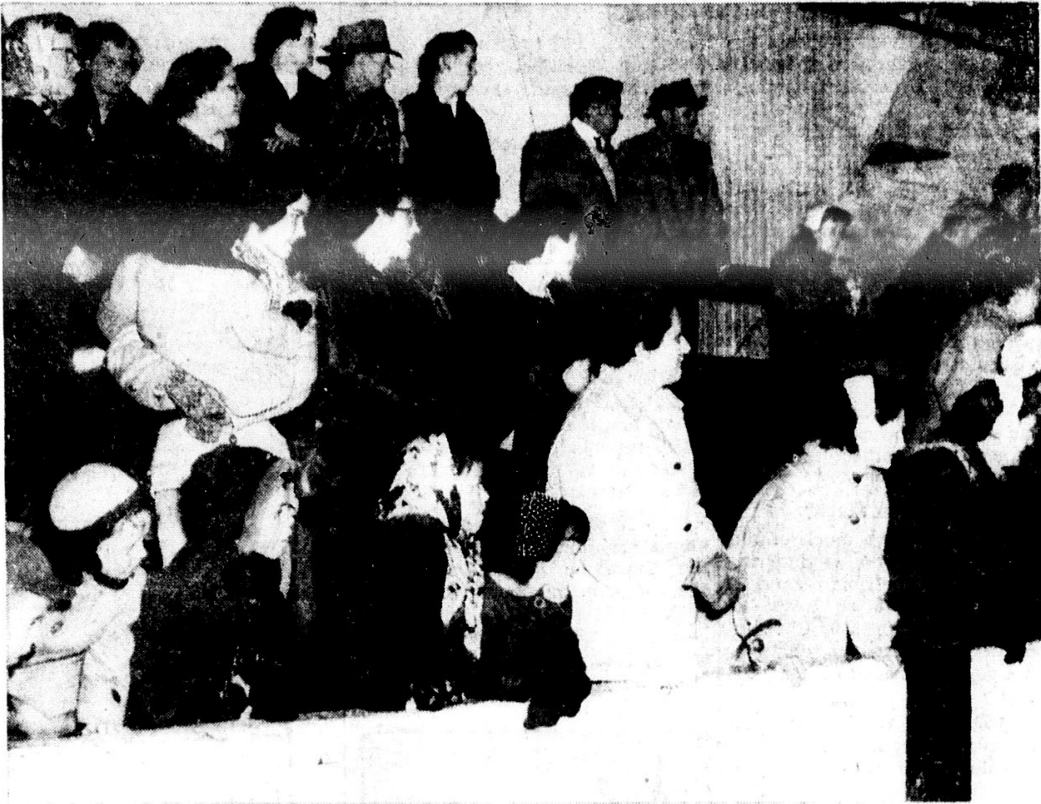
MINOR HOCKEY TOURNAMENT in Milton Saturday drew hundreds of friends and parents to watch the nine games (six preliminaries and three finals) by Milton, Georgetown, Orangeville and Acton players ranging in ages from eight to 13. Above a cheering crowd of mostly mothers root and holler for their young ice stars.

Following the game, crests were handed to all team members of the winning entries, and championship trophies were presented to captains of the day's big winners.