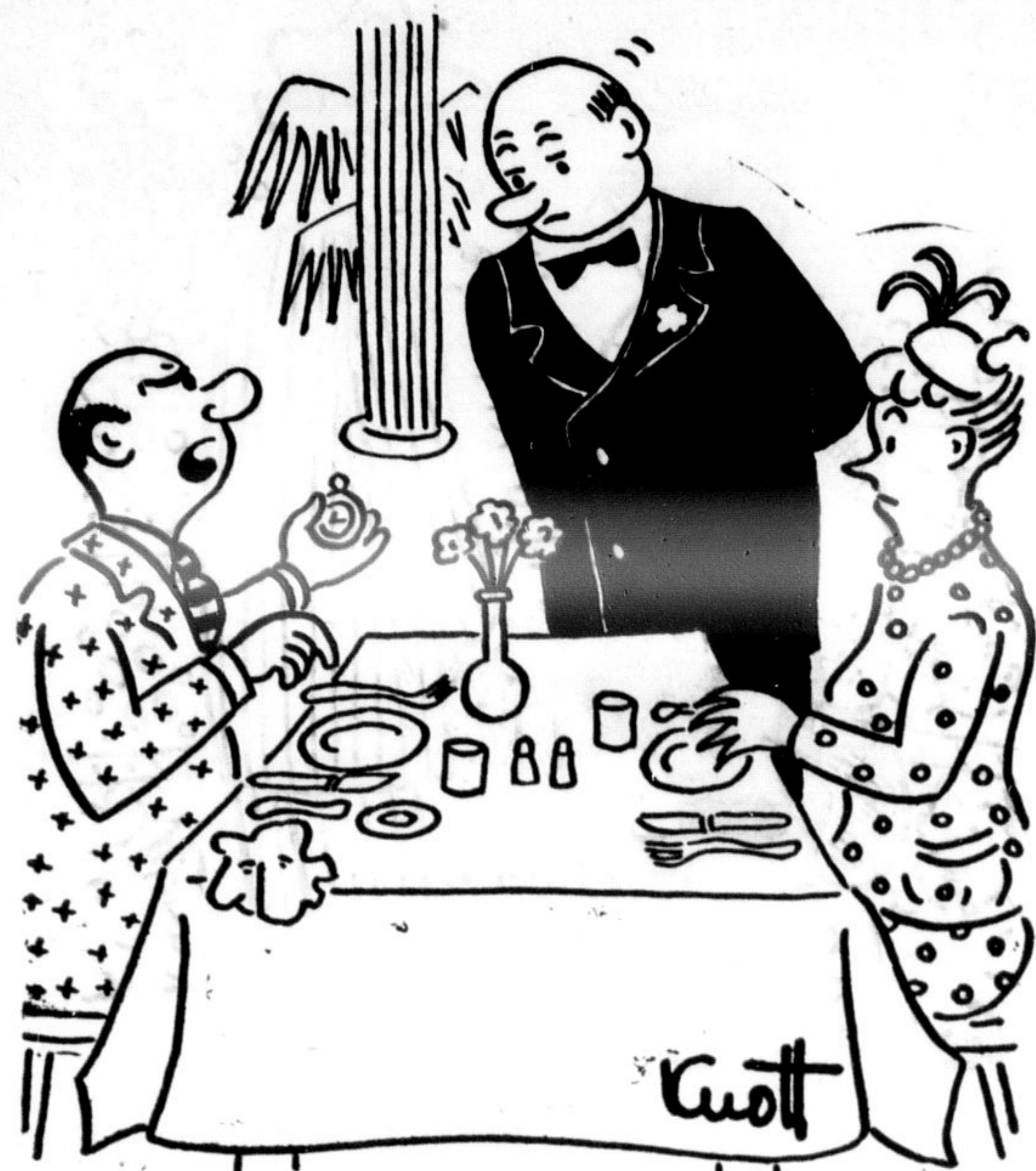
"That minute steak—I ate it in 32 seconds."